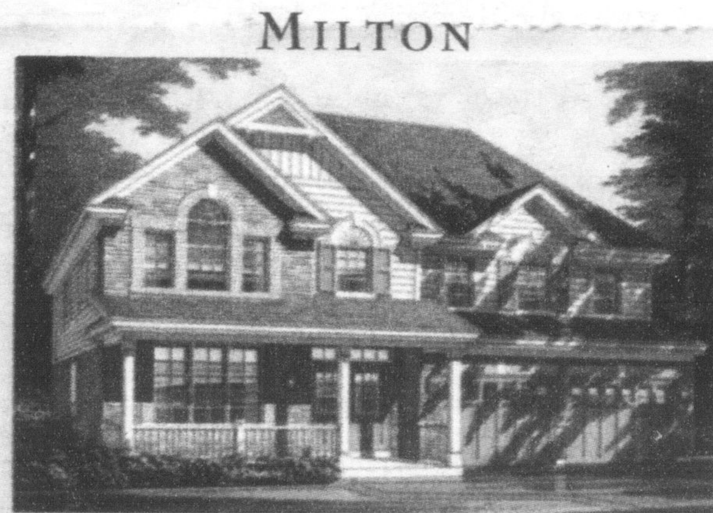
50' Home, The Ravenswood 'A', 3,390 Sq.Ft. $416,990