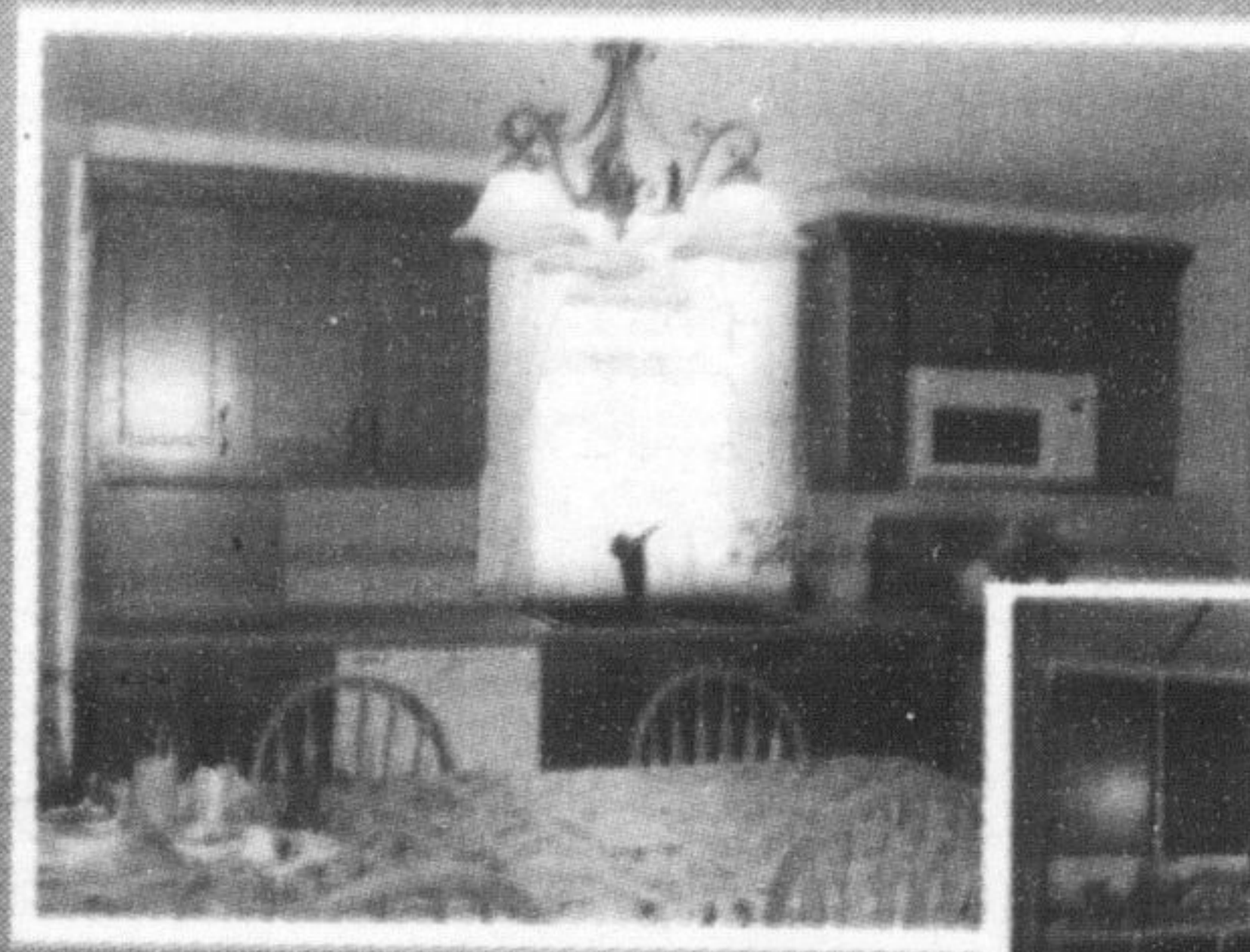
Last year's KITCHEN MAKEOVER