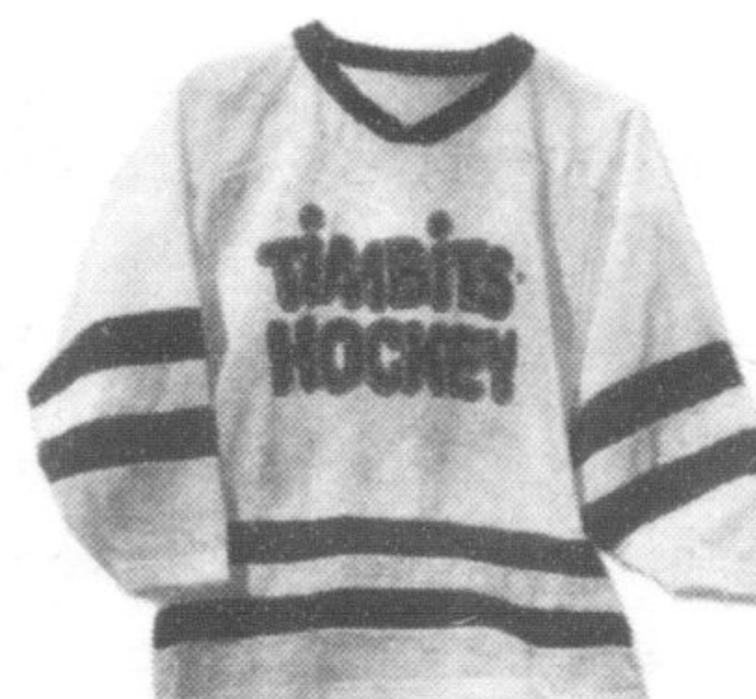
The first goal is having fun.

Timbits Hockey isn't about winning or keeping score. It's about learning the basics, making new friends, and most importantly, having fun. Every year over 50,000 entry-level players across the country discover just how great the game can be. That's why your Milton Tim Hortons is proud to sponsor Timbits Minor Hockey in your community.