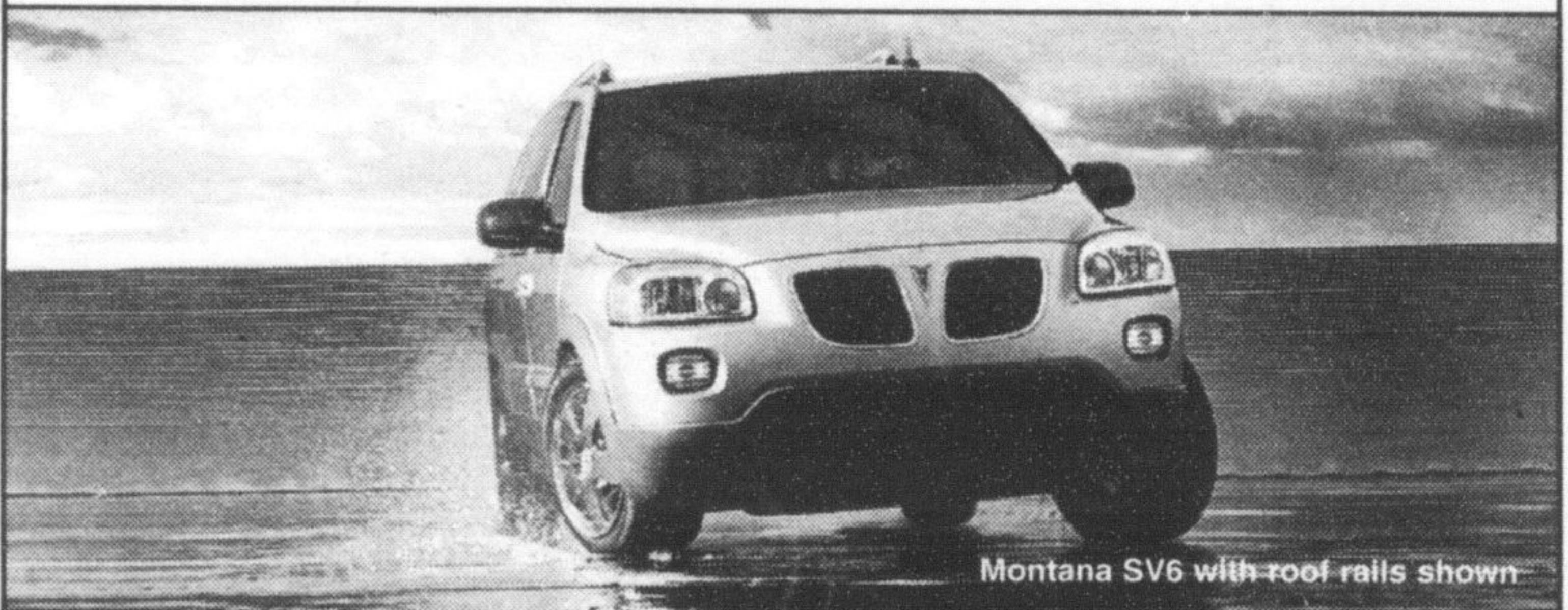
Montana SV6 with roof rails shown

SMARTLEASE $138* PER MONTH $1,630 DOWN PAYMENT $0 SECURITY DEPOSIT