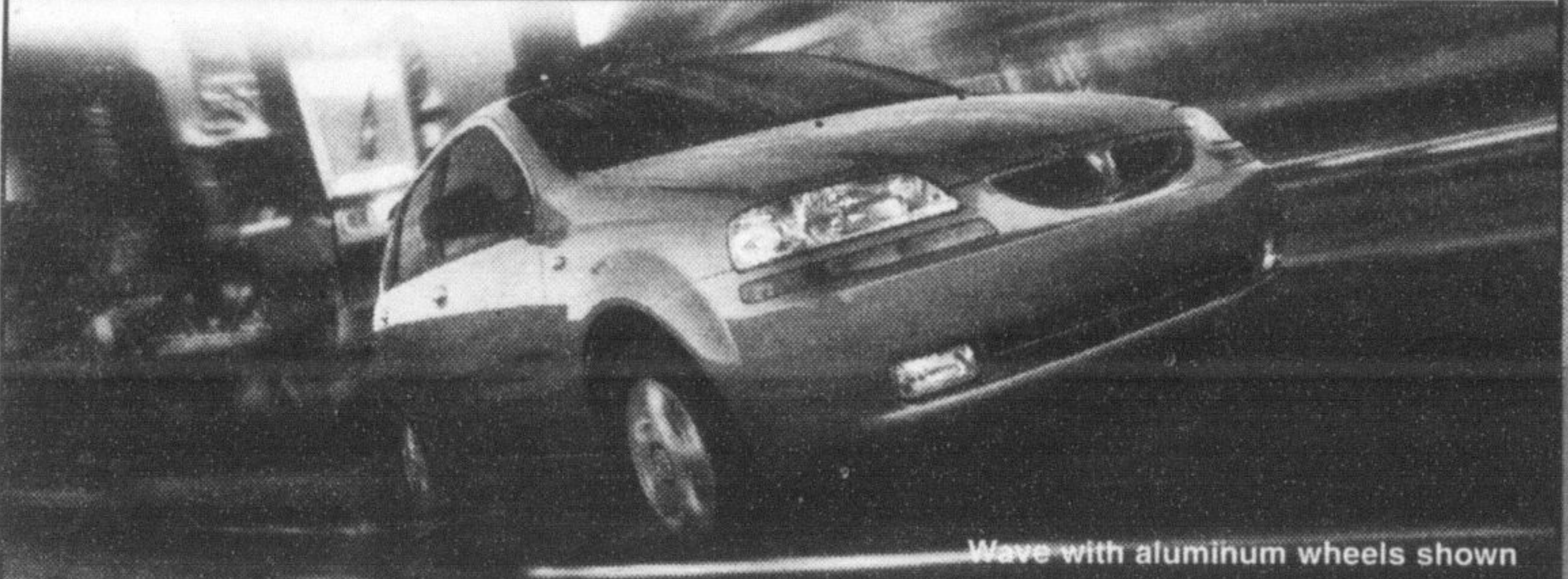
Wave with aluminum wheels shown

SMARTLEASE $188* PER MONTH $2,445 DOWN PAYMENT $0 SECURITY DEPOSIT