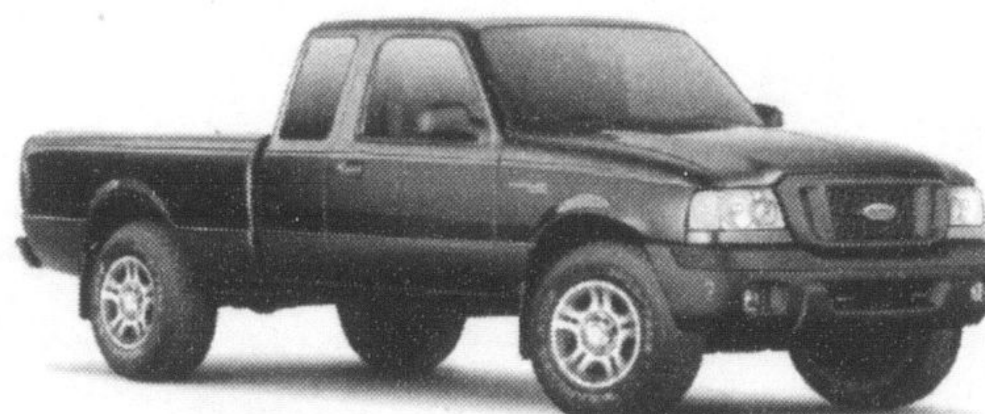
2005 FORD RANGER EDGE SUPERCAB 4x2

Lease for: $199 per month/36 months with $2,995 down or EQUIVALENT TRADE. Freight $995, $0 Security with the purchase of WearCare.†