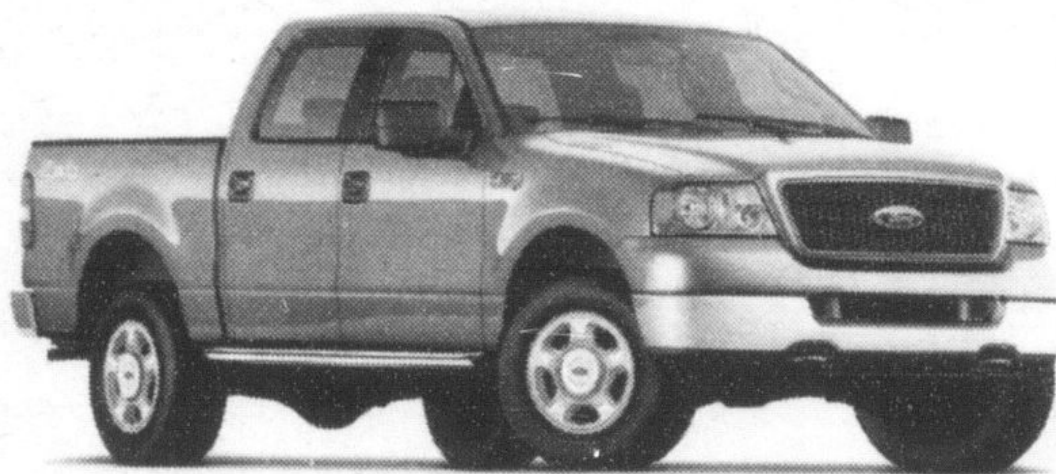
2005 F-150 XLT SUPERCREW 4x4 -OR- SUPERCAB 4x4

FORD F-SERIES IS CANADA'S BEST-SELLING LINE OF PICKUPS 39 YEARS RUNNING.**