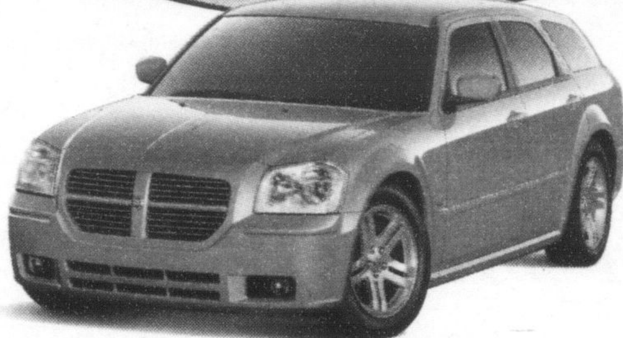
2005 Dodge MAGNUM SE