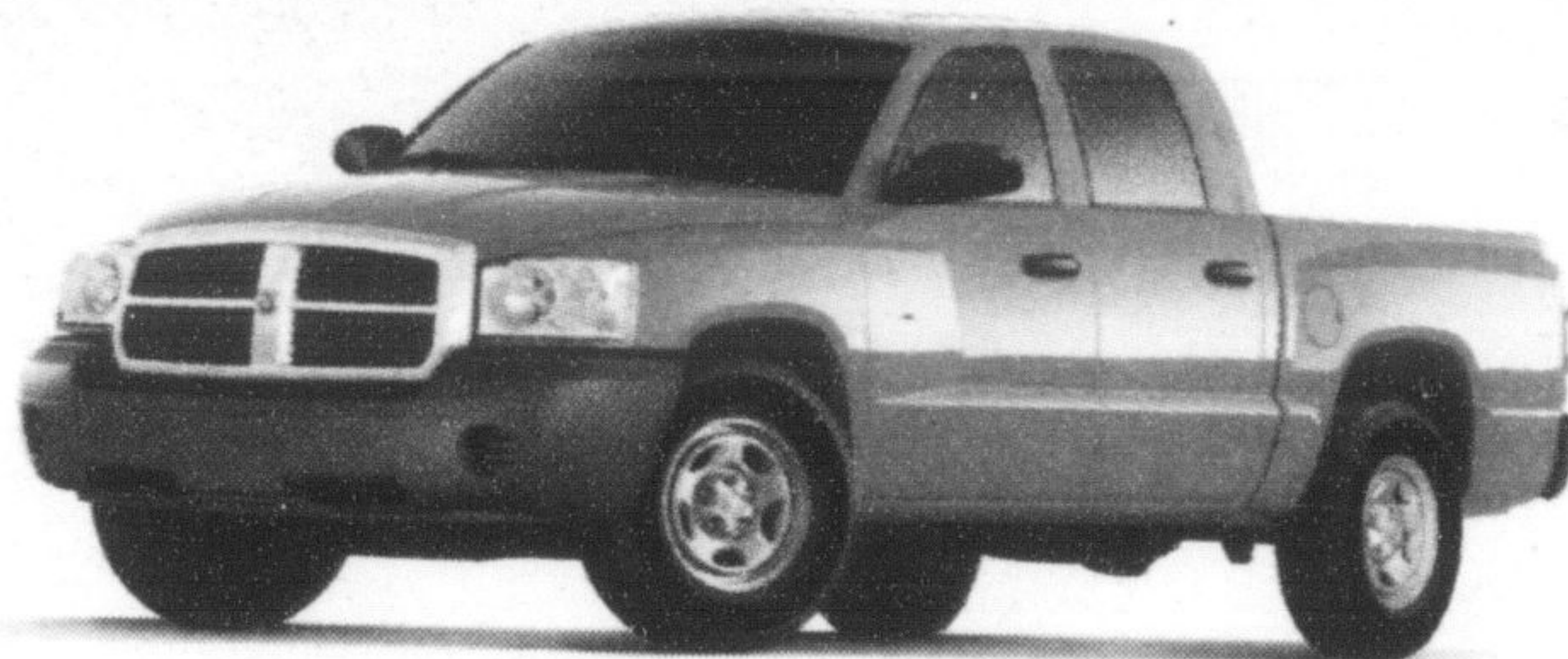
2005 Dodge DAKOTA CLUB CAB ST 4X2

OR LEASE FOR $388 PER MONTH FOR 48 MONTHS WITH $0 DOWN PAYMENT