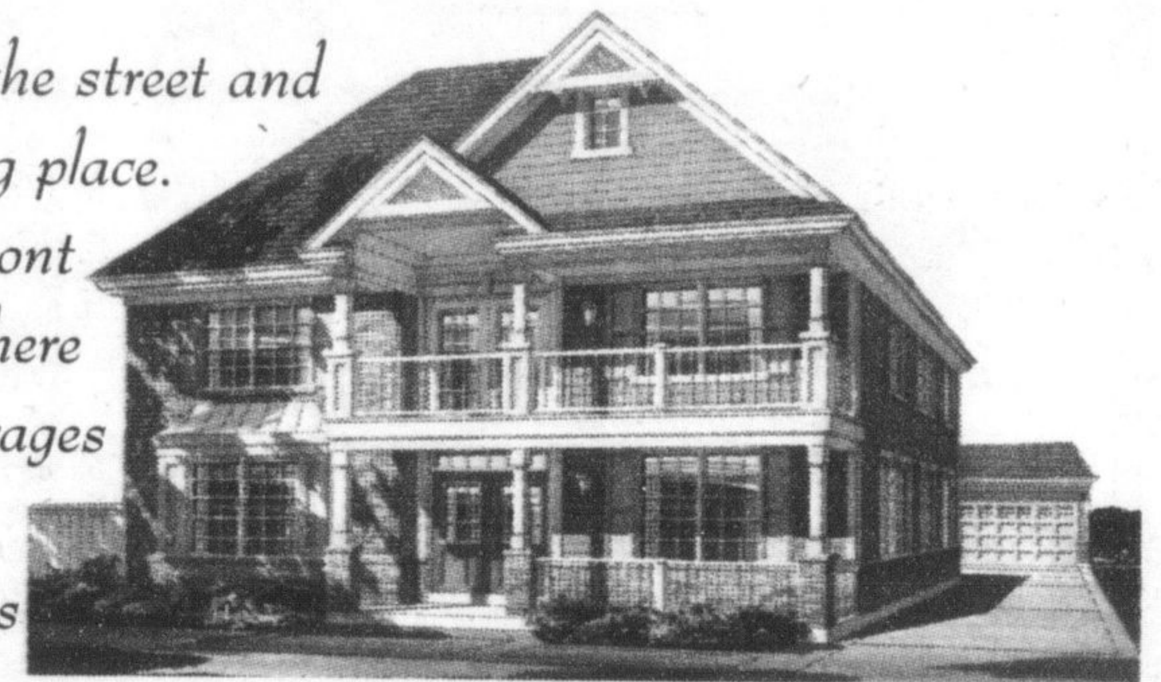
50' Home, The Napier 'A', 3,093 sq.ft. $401,990

In Hawthorne Village, the homes present a wide profile to the street and most offer front porches, which is a great family gathering place. Neighbours greet each other warmly and some stop out front for a while just to chat. Street traffic is lighter because there are fewer homes and the streets wind gently which encourages cars to drive slowly. Parkettes dot the community and serve as places where kids play. Biking and walking paths are also scattered throughout the community. Come and visit Canada's largest WideLot™ community, and see why its a place called home by more than 3,000 families.