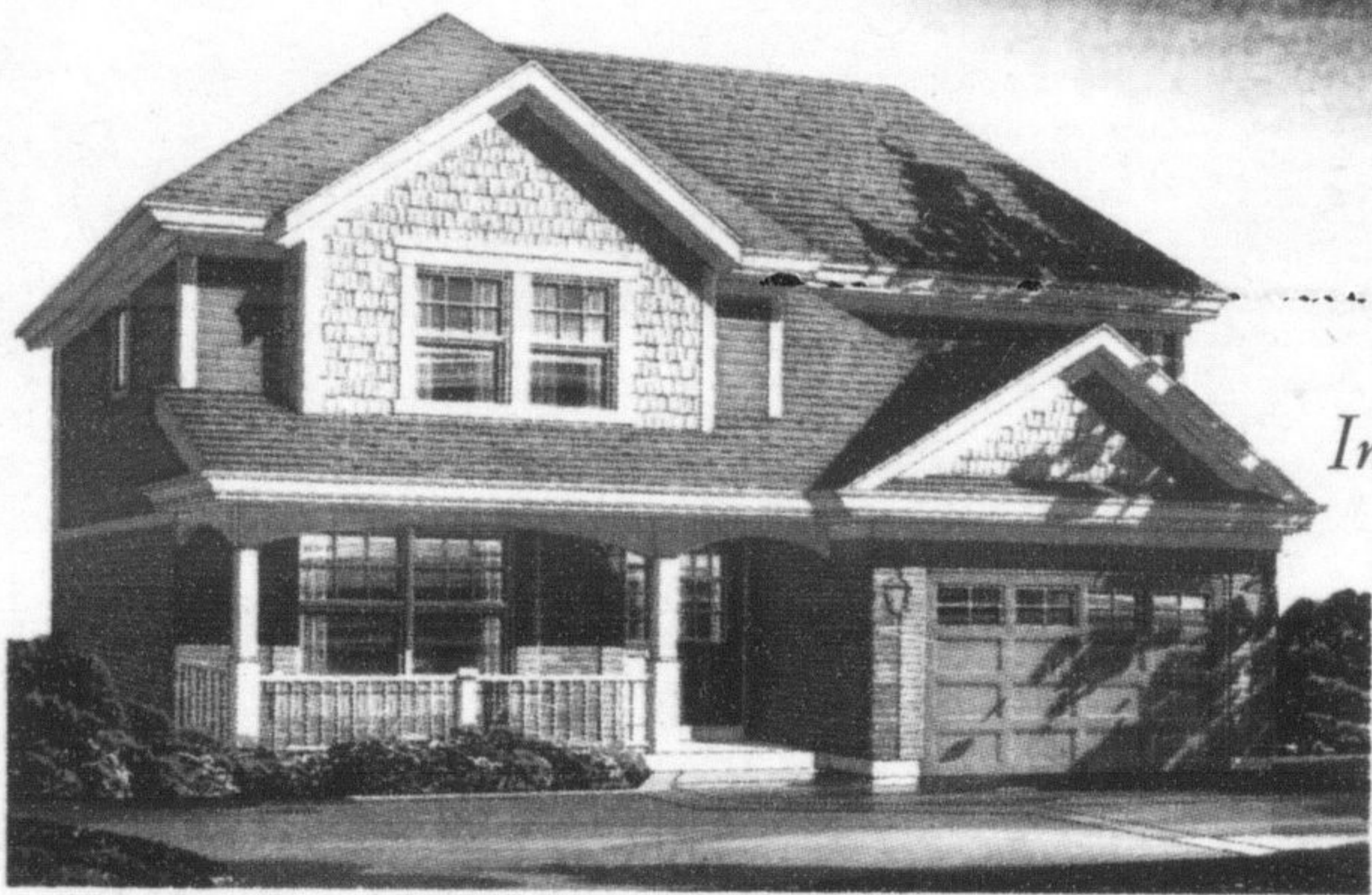
36' WideLot™, The Fox Grove 'A', 1,382sq.ft. $266,990

In Hawthorne Village, the homes present a wide profile to the street and most offer front porches, which is a great family gathering place. Neighbours greet each other warmly and some stop out front for a while just to chat. Street traffic is lighter because there are fewer homes and the streets wind gently which encourages cars to drive slowly. Parkettes dot the community and serve as places where kids play. Biking and walking paths are also scattered throughout the community. Come and visit Canada's largest WideLot™ community, and see why its a place called home by more than 3,000 families.