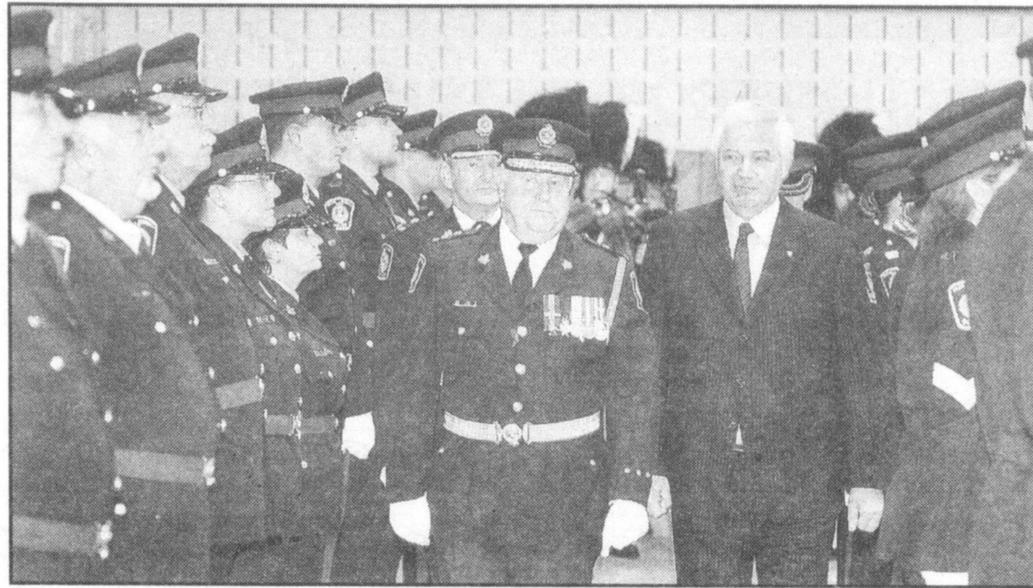
Ontario Lieutenant Governor James Bartleman is escorted into a special presentation last Friday, honouring Halton Regional Police with the coveted Queen's Colour award.