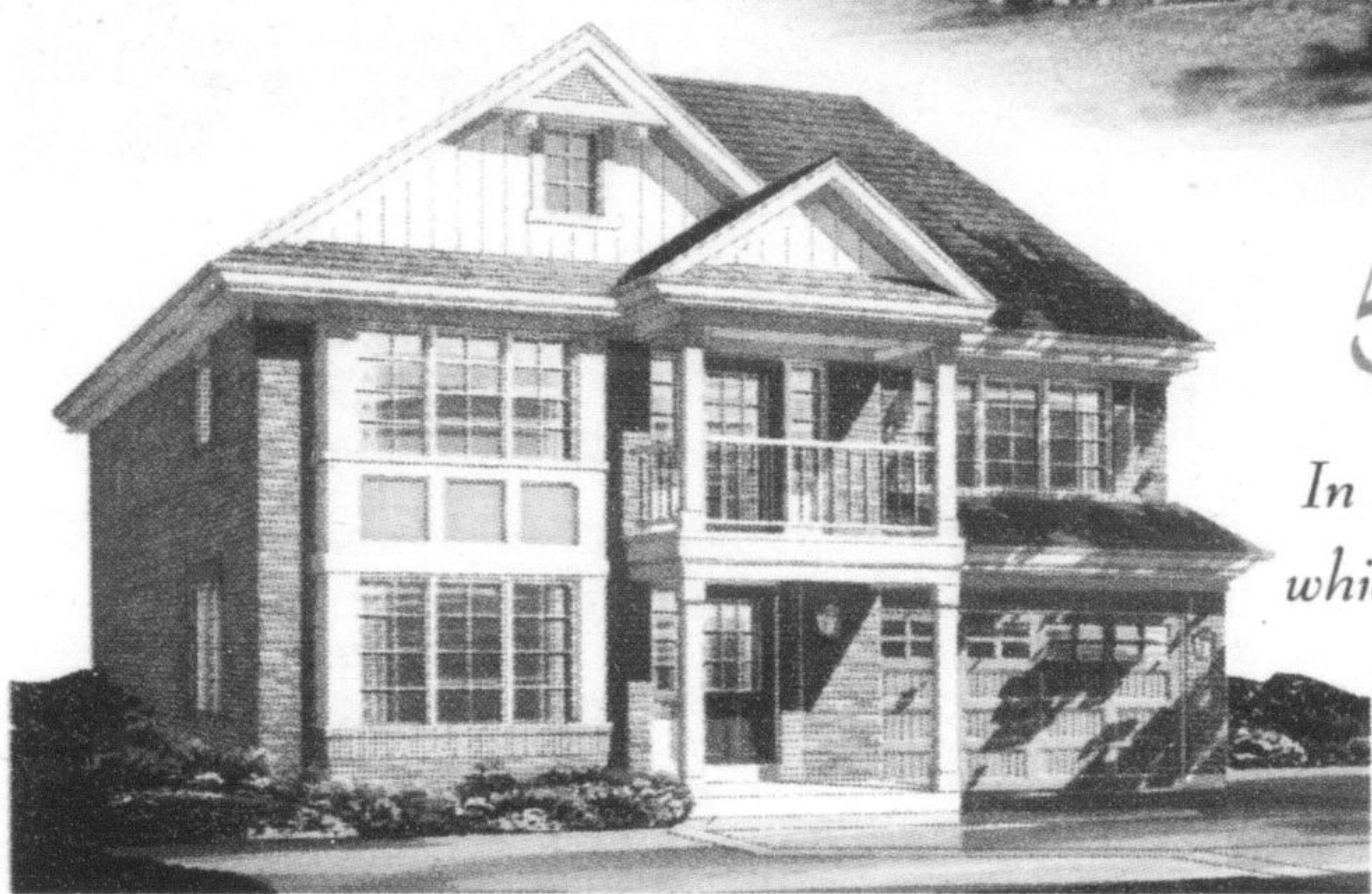
36' WideLot™, The Norriston 'E', 1,858 sq.ft. $290,990

In Hawthorne Village, the homes present a wide profile to the street and most offer front porches, which is a great family gathering place. Neighbours greet each other warmly and some stop out front for a while just to chat. Street traffic is lighter because there are fewer homes and the streets wind gently which encourages cars to drive slowly. Parkettes dot the community and serve as places where kids play. Biking and walking paths are also scattered throughout the community. Come and visit Canada's largest WideLot™ community, and see why its a place called home by more than 3,000 families.