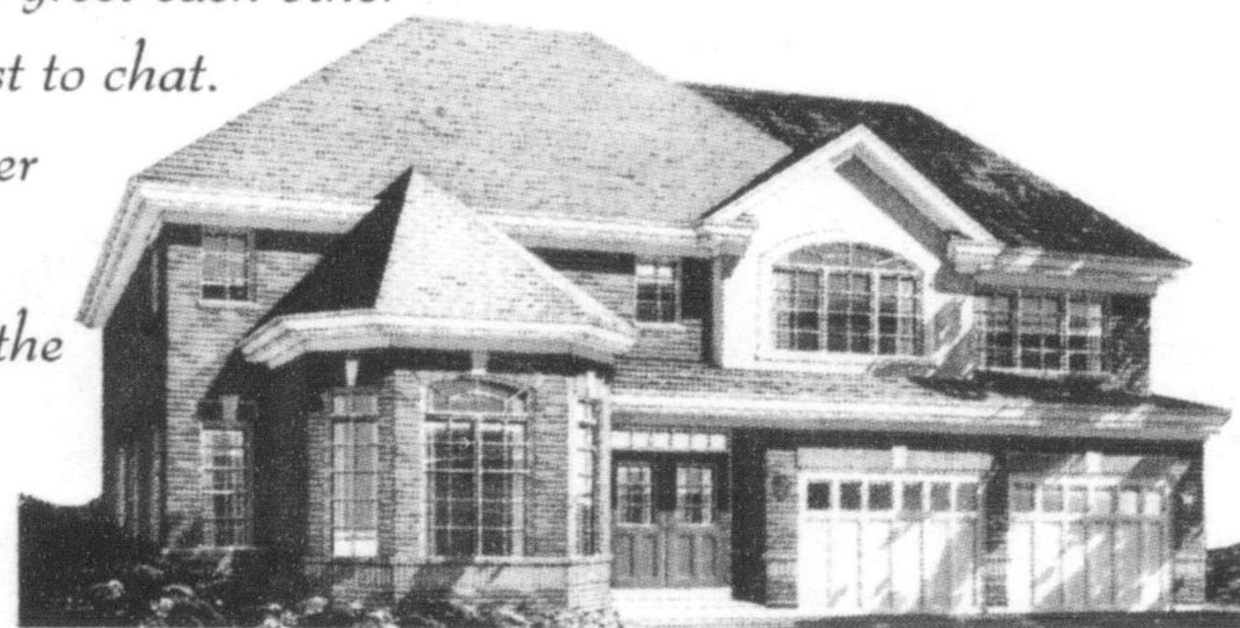
50' Home, The Coleridge 'B', 3,050 sq.ft. $399,990

Street traffic is lighter because there are fewer homes and the streets wind gently which encourages cars to drive slowly. Parkettes dot the