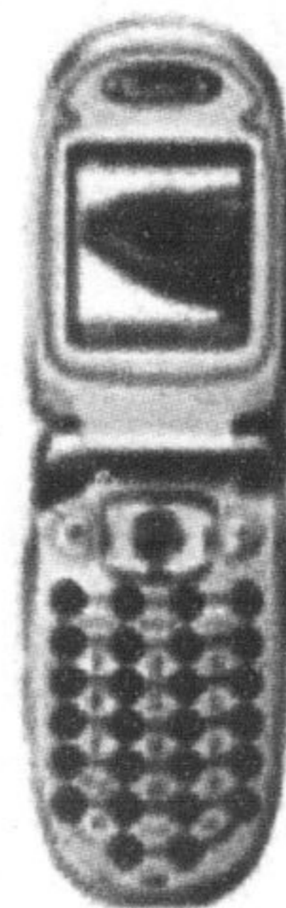
LG 6190 Fastap™