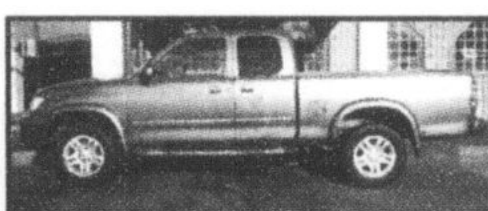
Toyota 2003 Tundra Ltd. 4x4 Xcab 43,644 km $33,995