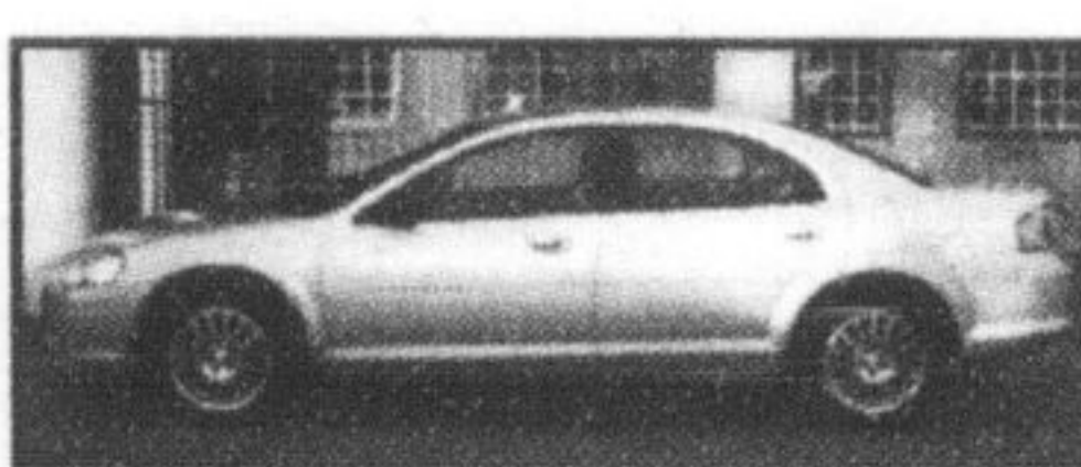
Chrysler 2004 Sebring Touring 33,451 km $14,864