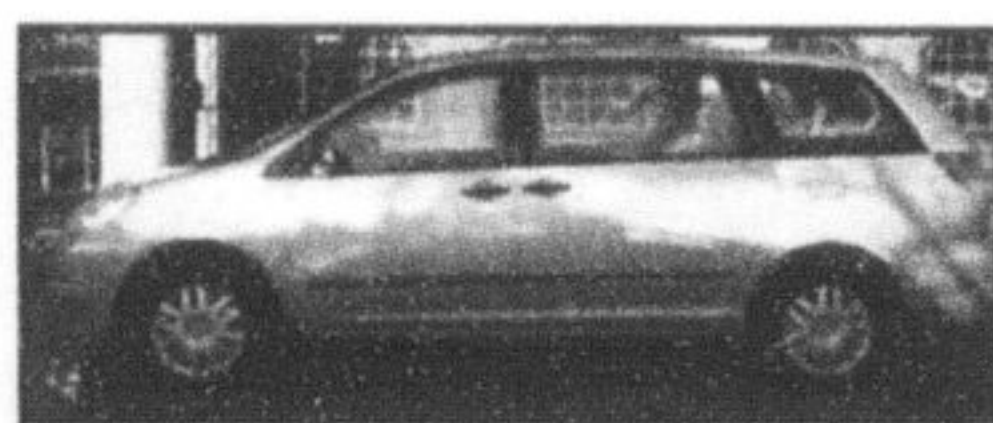
Toyota 2004 Sienna CE 36,314 km $26,522

Here's just a sample of over 250 vehicles we have in stock.