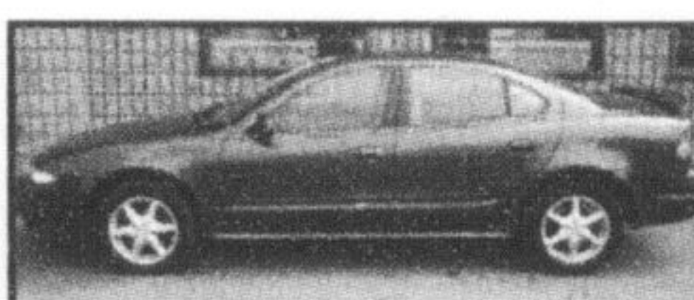
Olds 2002 Alero GL 57,602 km $12,690