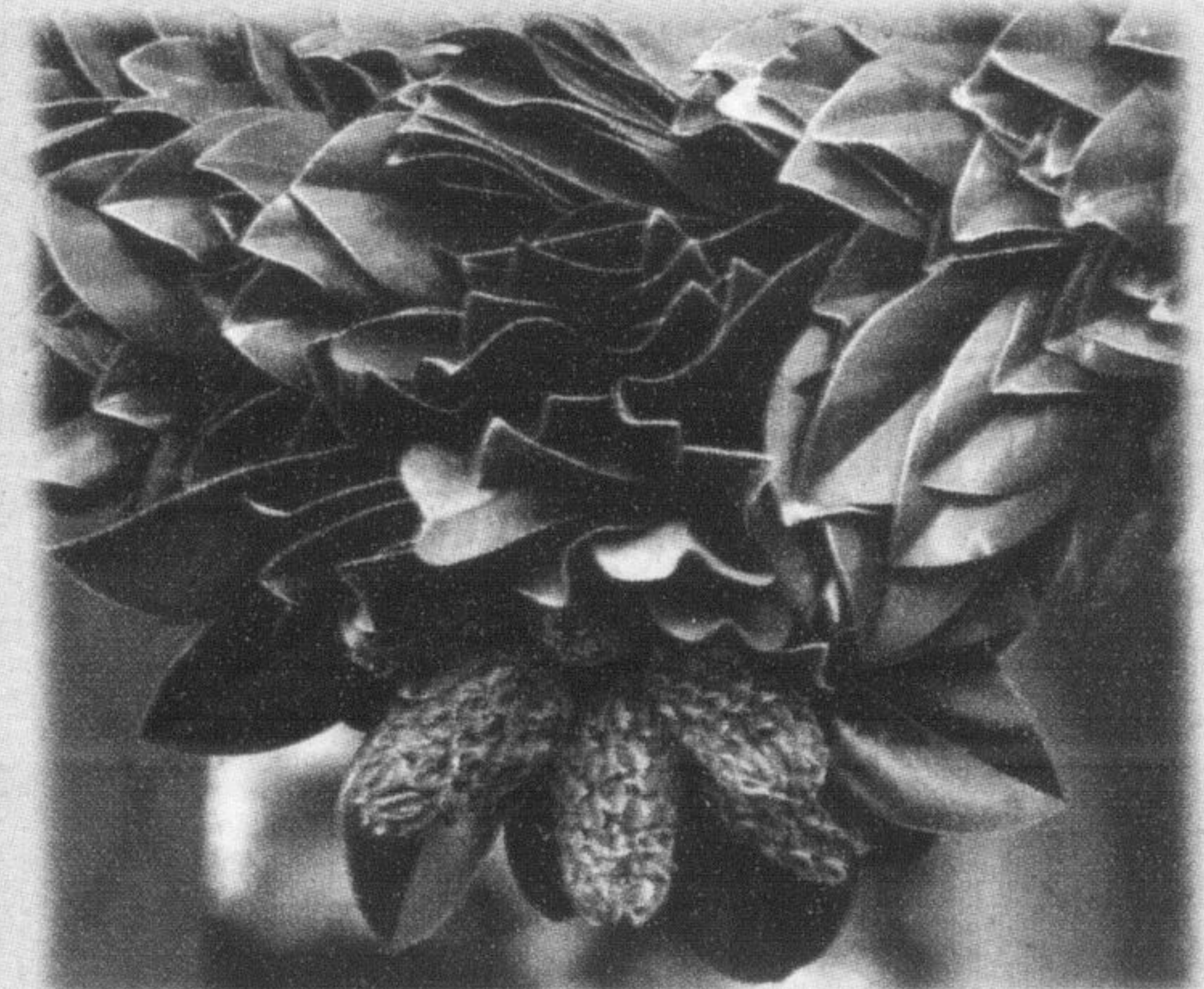
Southern Magnolia This year's hottest festive look