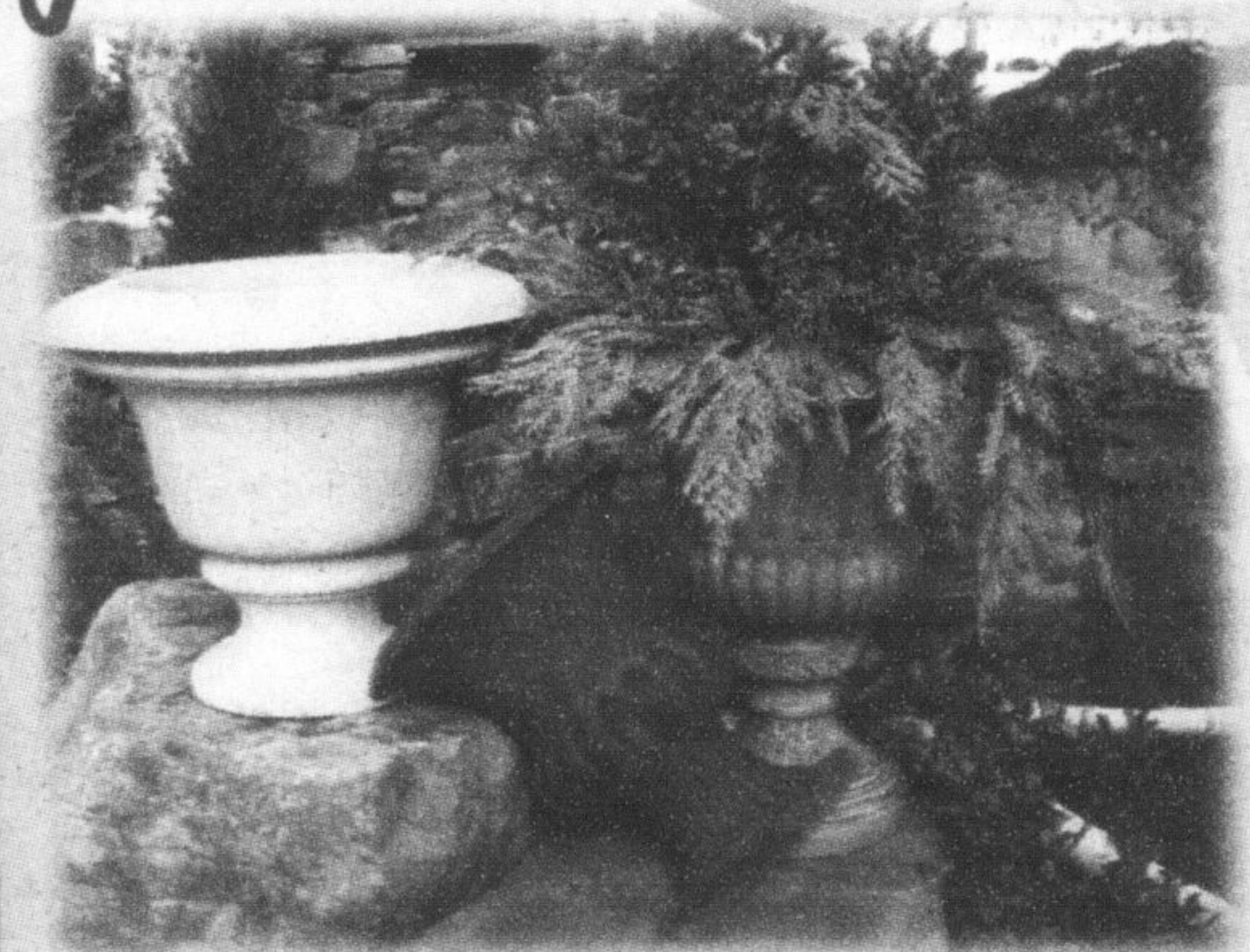
Festive Frost Resistant Urns Indoor or outdoor. Over 25 styles & sizes