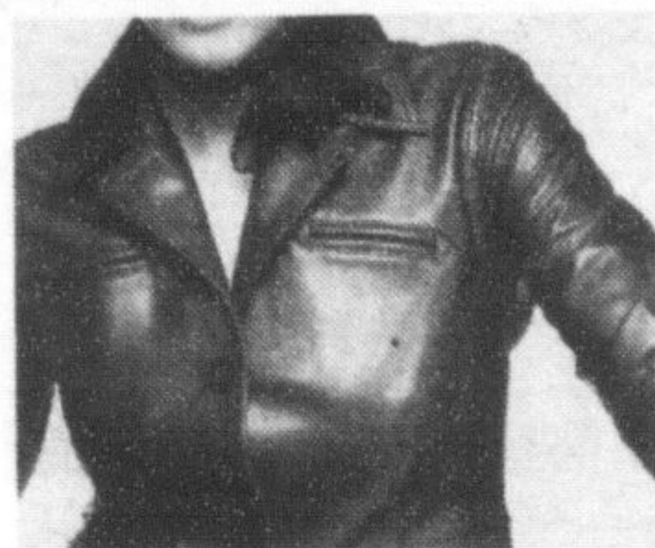
WOMEN'S LEATHER COATS

FOR EVERY 50TH PERSON IN THE DOOR - ALL DAY! EVERY DAY!