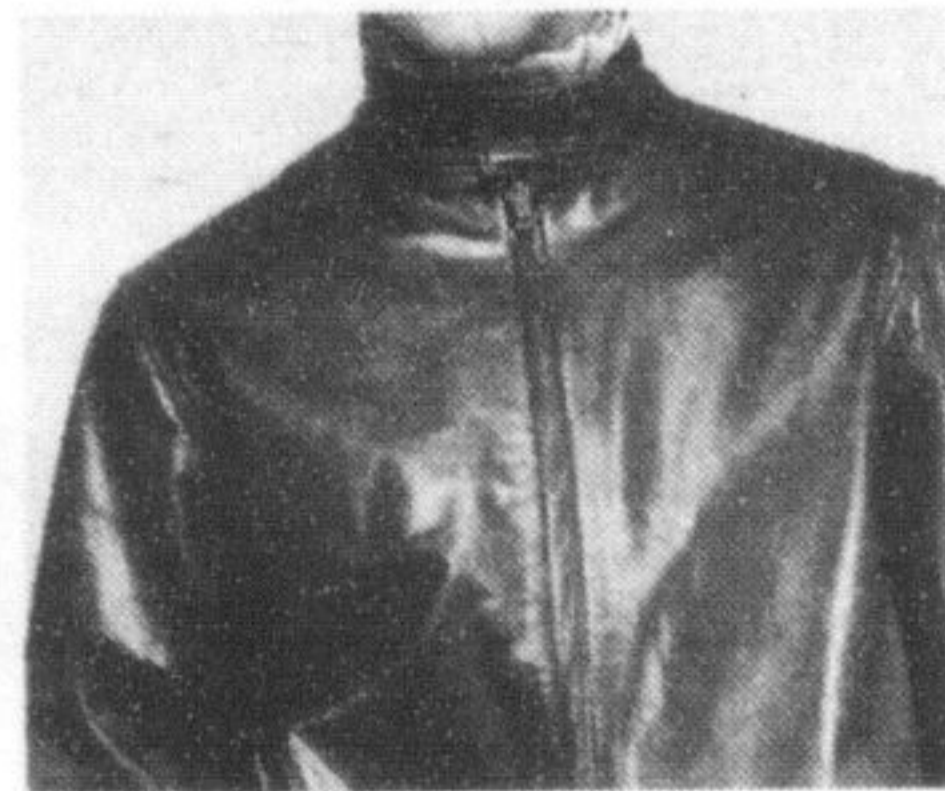
MEN'S LEATHER COATS