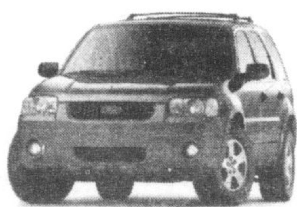
2005 ESCAPE XLT 4X4

BEST-SELLING COMPACT TRUCK IN NORTH AMERICA*