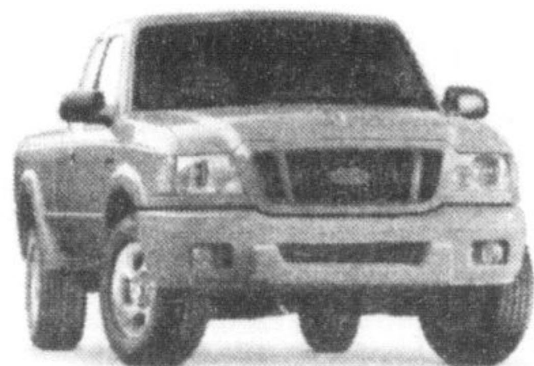
2005 RANGER EDGE SUPERCAB 4X4

$359* PER MONTH/24 MONTHS $0 SECURITY DEPOSIT