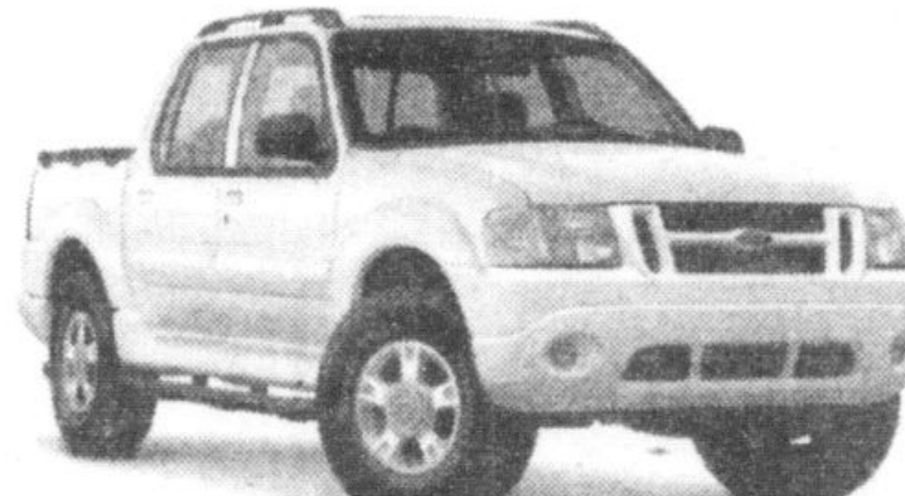
2005 EXPLORER SPORT TRAC 4X4 XLT COMFORT

24 MONTH LEASE ADVANTAGE $369* PER MONTH/24 MONTHS $0 SECURITY DEPOSIT