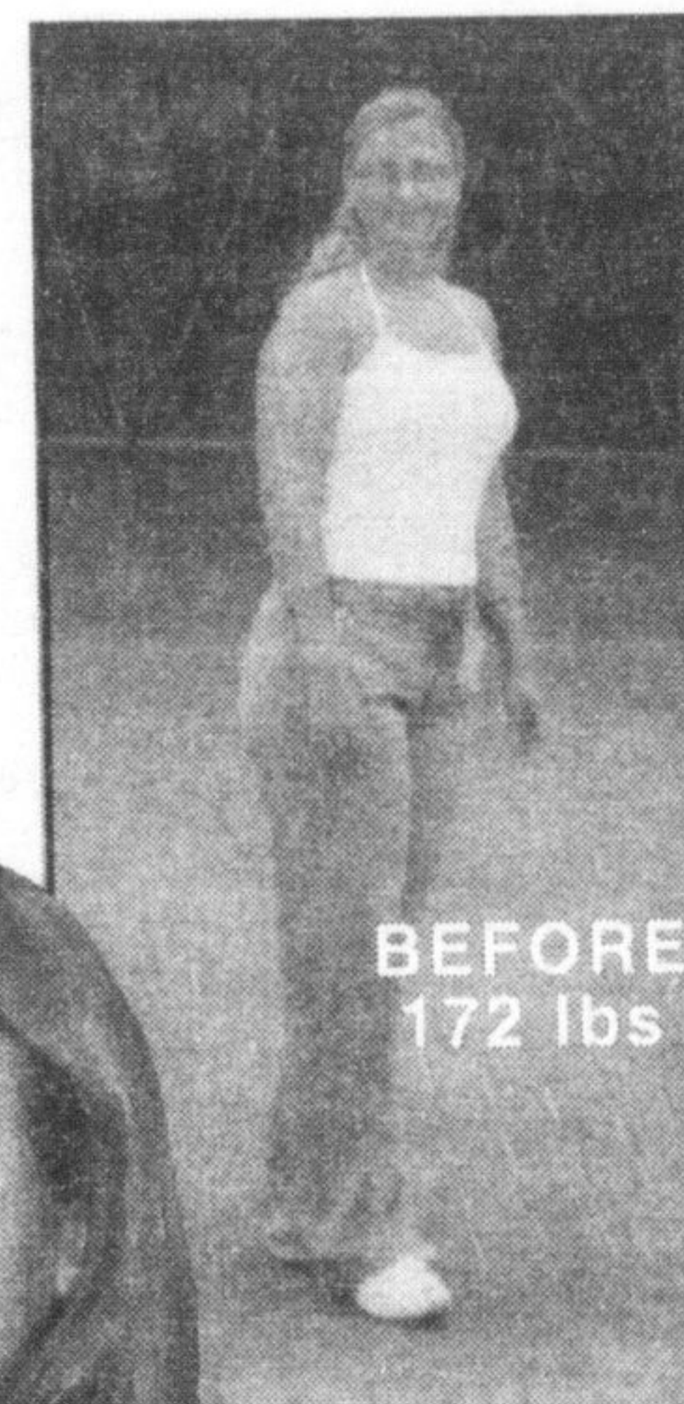
BEFORE 172 lbs