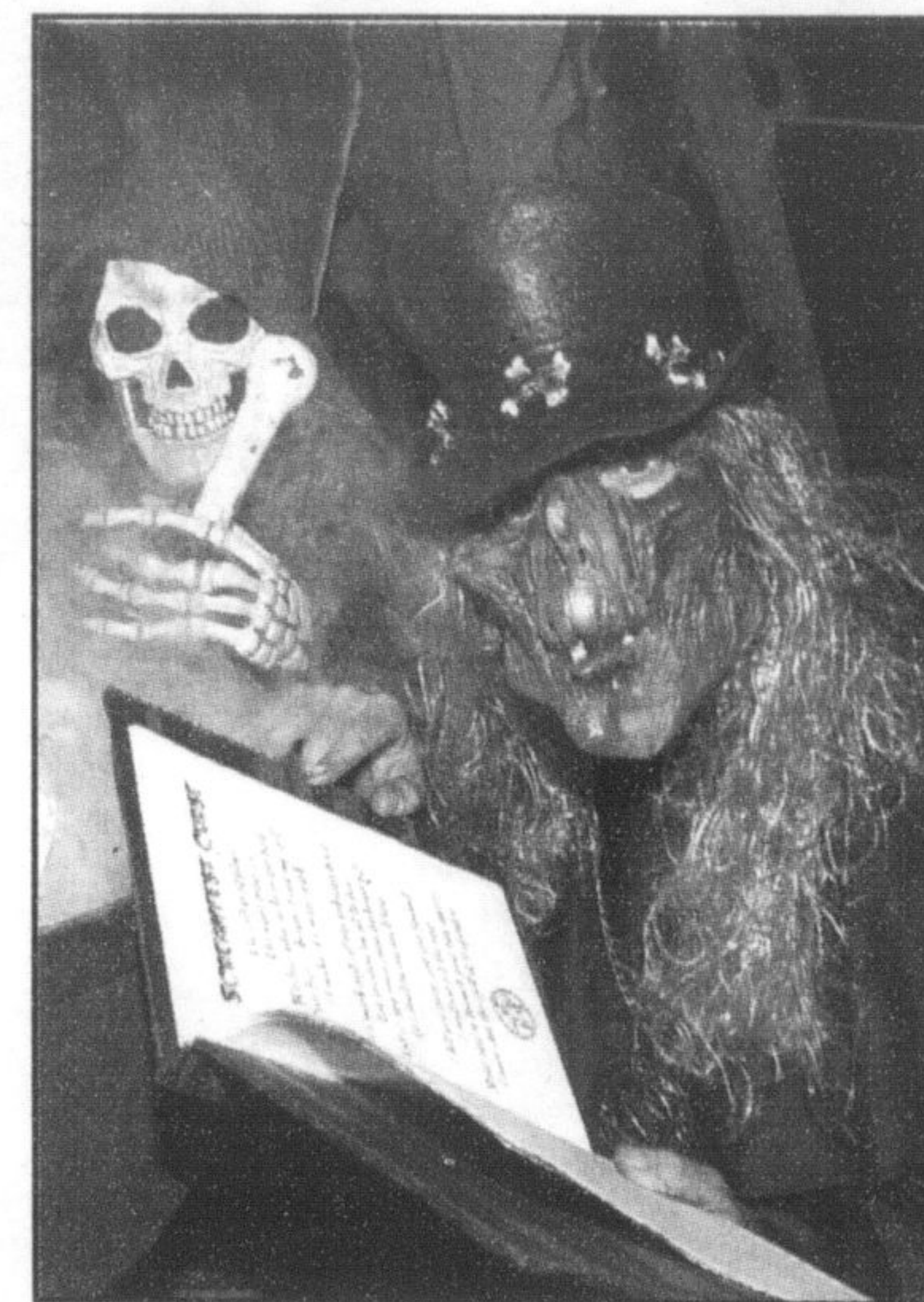
Scremfest 2004 is guaranteed to scare.