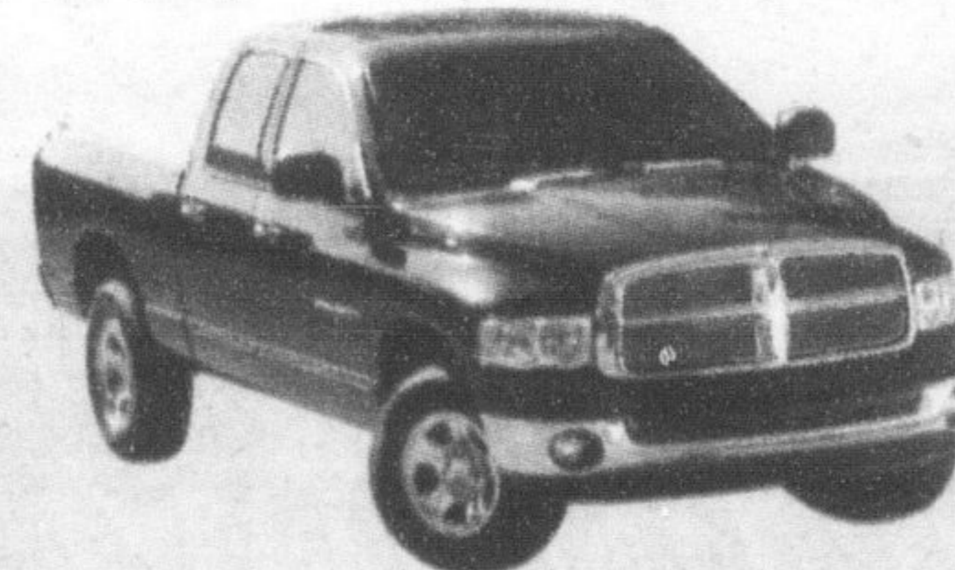
DODGE RAM 1500