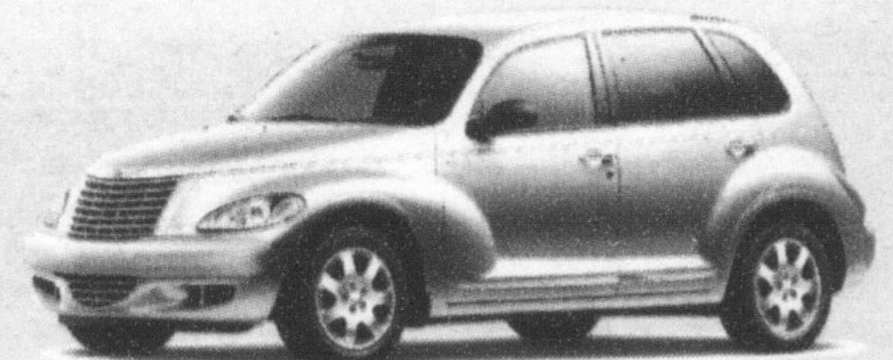
CHRYSLER PT CRUISER