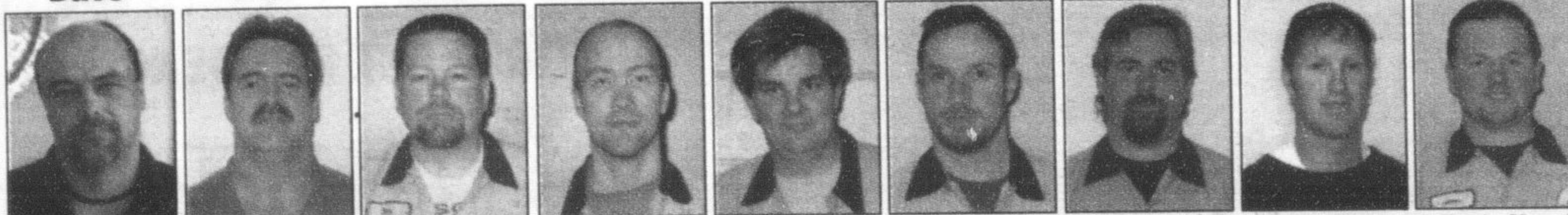
Service Manager Service Advisor Transmission Specialist (Italian) Technician Technician Technician Technician Detailer Detailer