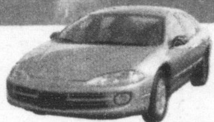
2004 Chrysler Intrepid