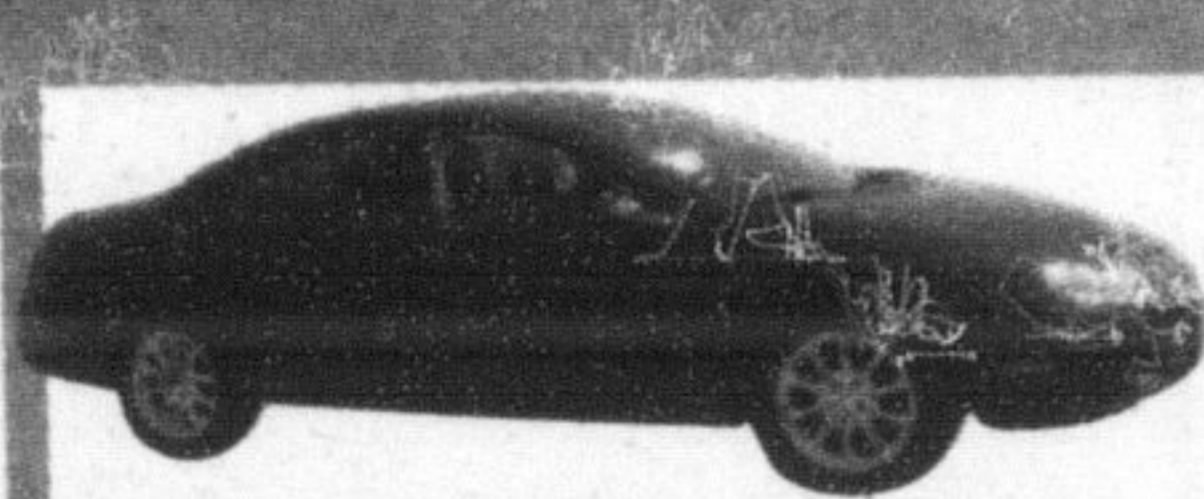
2004 Chrysler Concorde