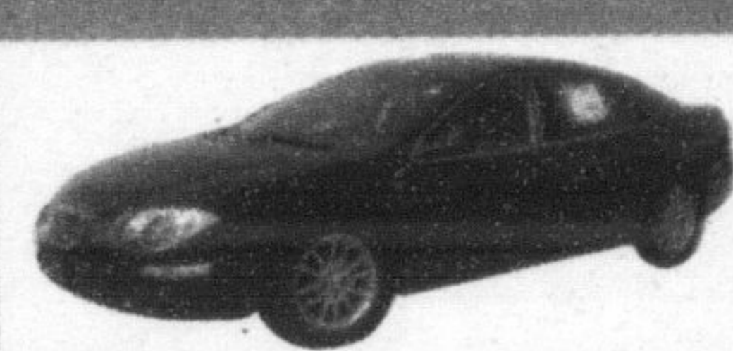
2004 Chrysler 300 M