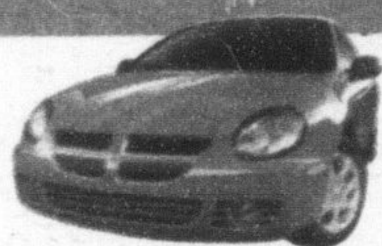
2004 Dodge SX 2.0