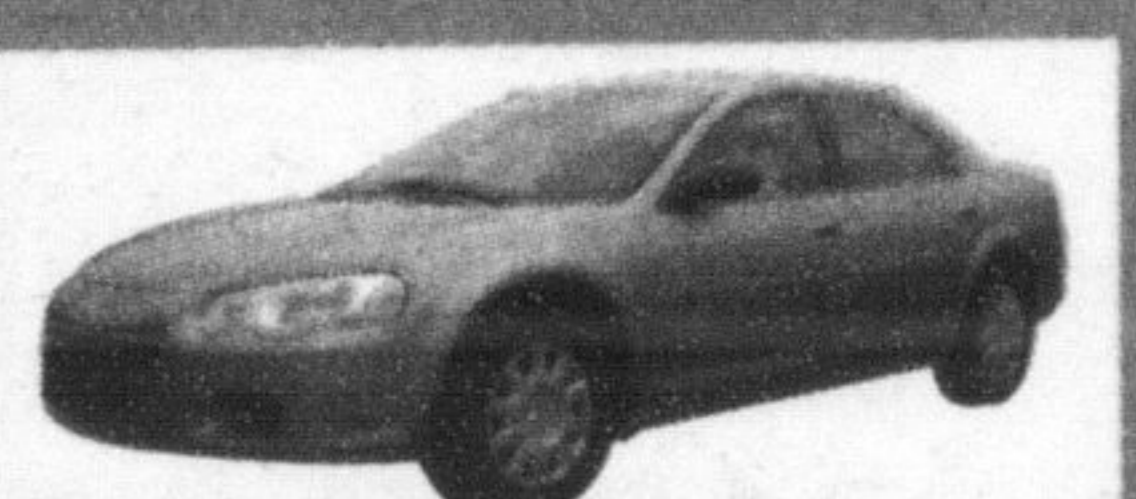
2004 Chrysler Sebring

Get a no charge DVD system when you purchase or lease any 2005 Dodge Caravan or Grand Caravan.