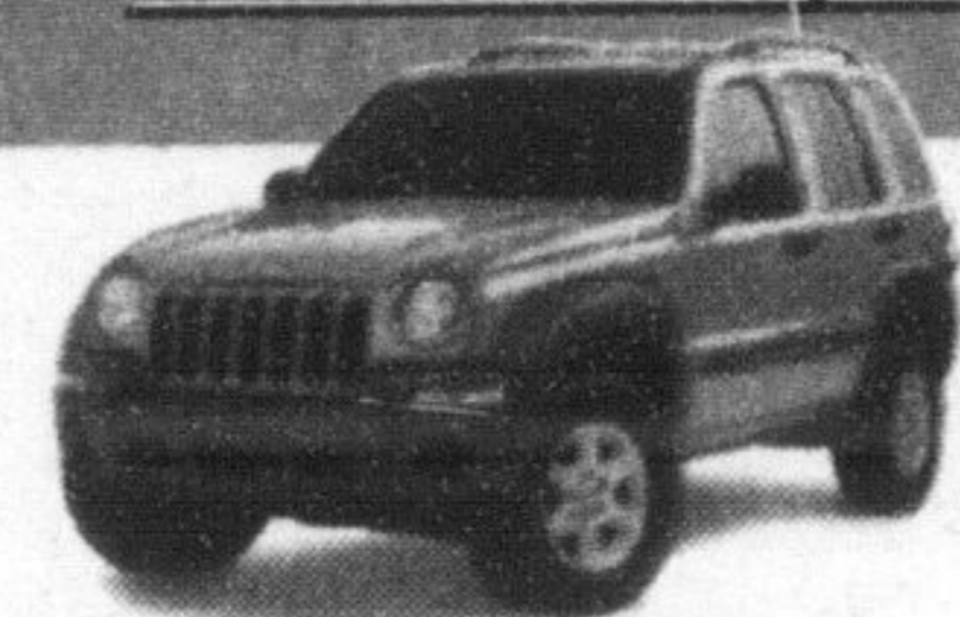
2004 Jeep Liberty