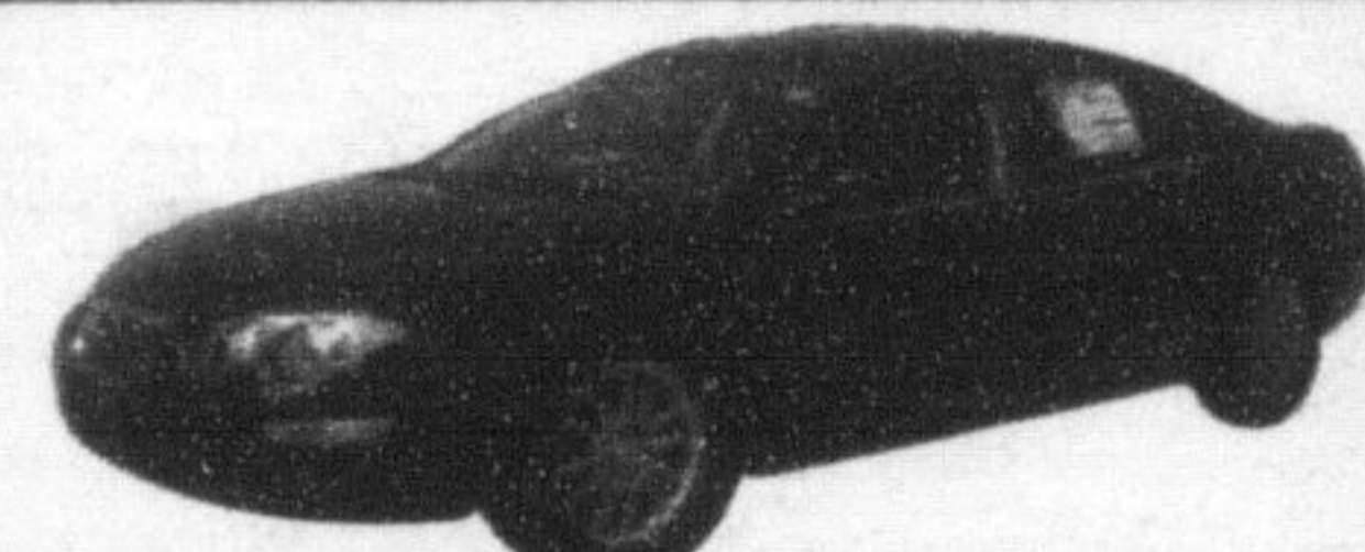
2004 Chrysler 300 M