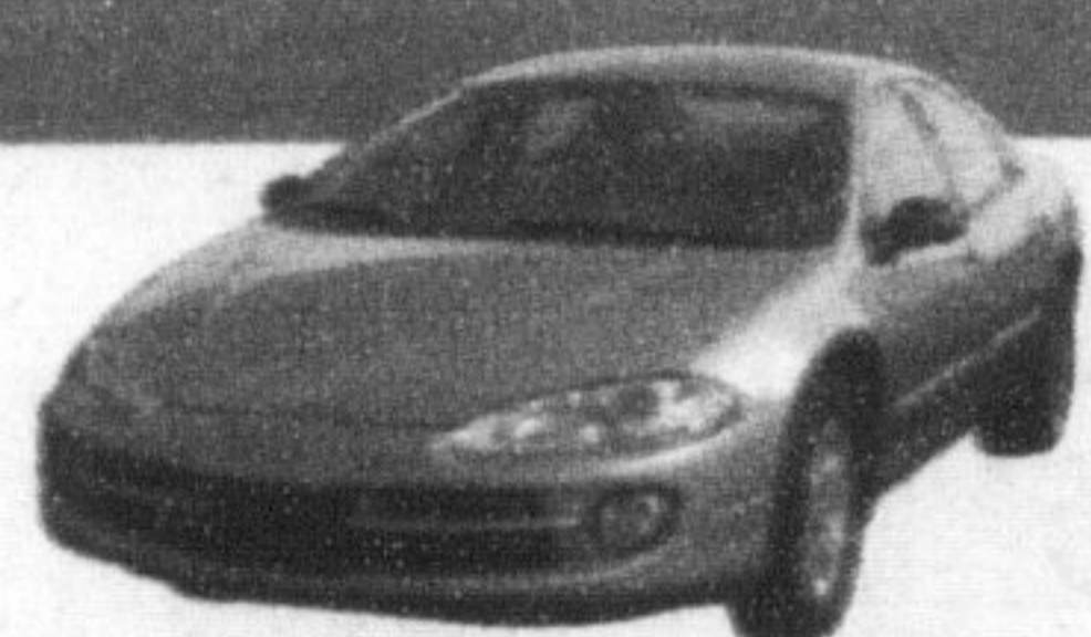
2004 Chrysler Intrepid