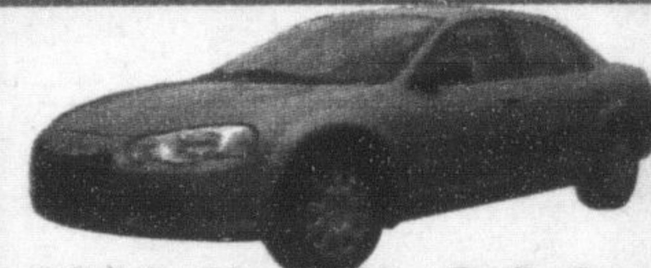
2004 Chrysler Sebring

0% PURCHASE FINANCING PLUS $2,000 CASH BACK ON MOST 2004 CHRYSLER, JEEP & DODGE MODELS ON 2004 JEEP GRAND CHEROKEE AND CHRYSLER PACIFICA MODELS