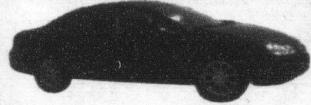
2004 Chrysler Concorde