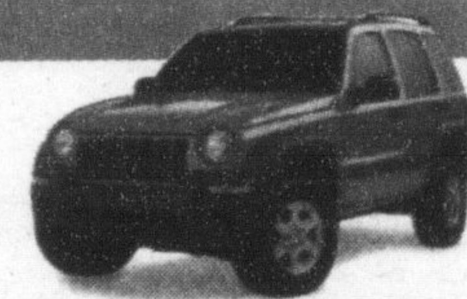
2004 Jeep Liberty