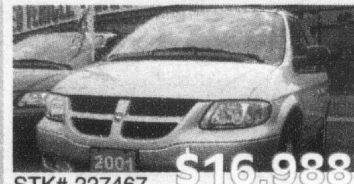
01 CARAVAN SPORT