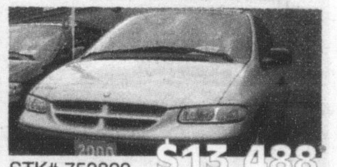
00 GR. CARAVAN