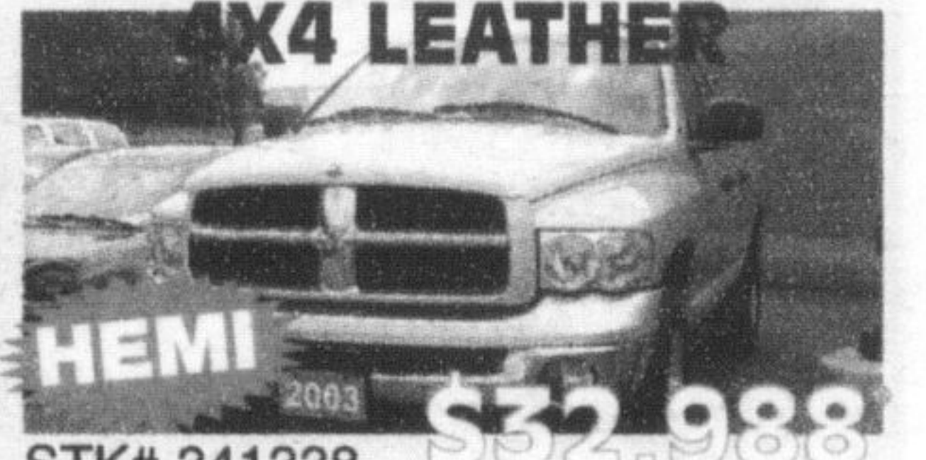
03 RAM QUAD CAB 4X4 LEATHER