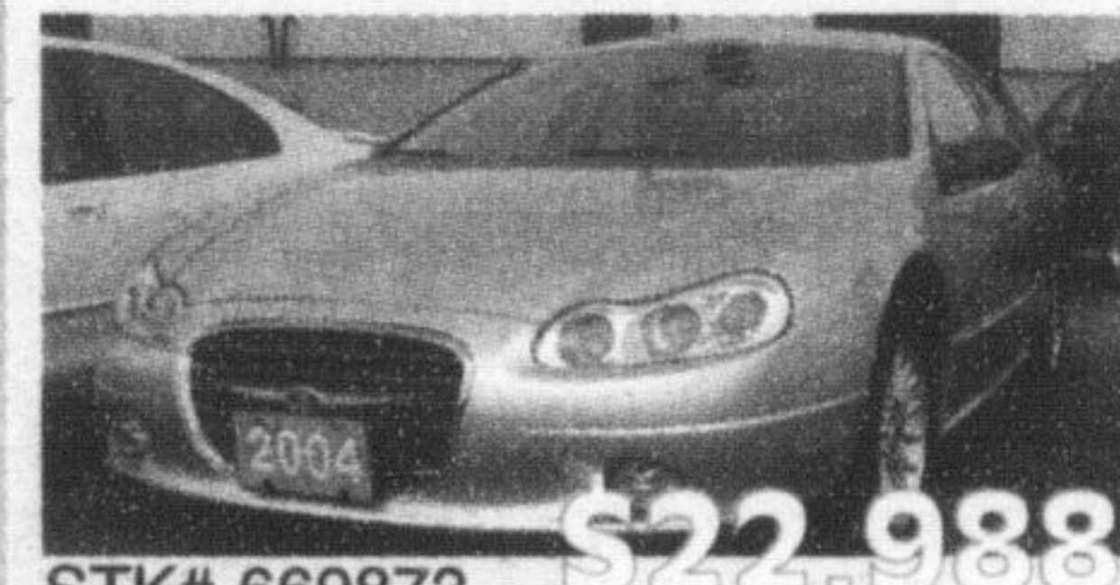
04 CONCORDE LXI