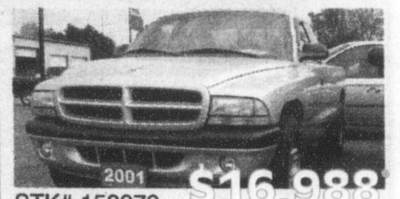
01 DAKOTA CLUB CAB