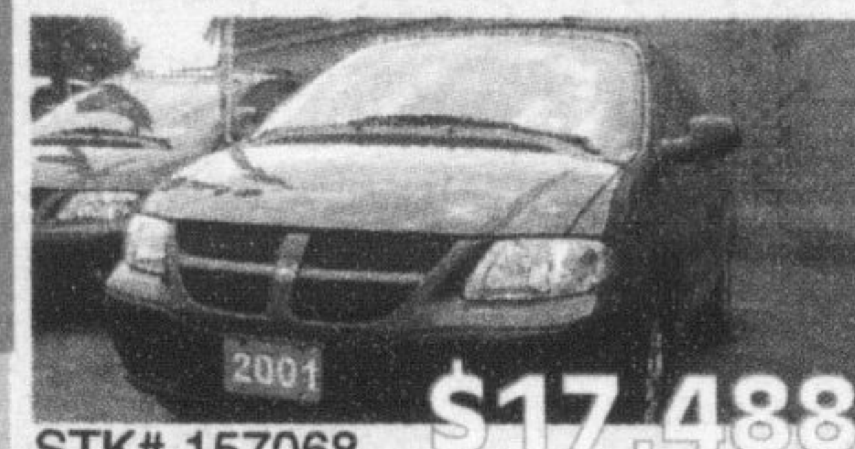
01 GR. CARAVAN SPORT