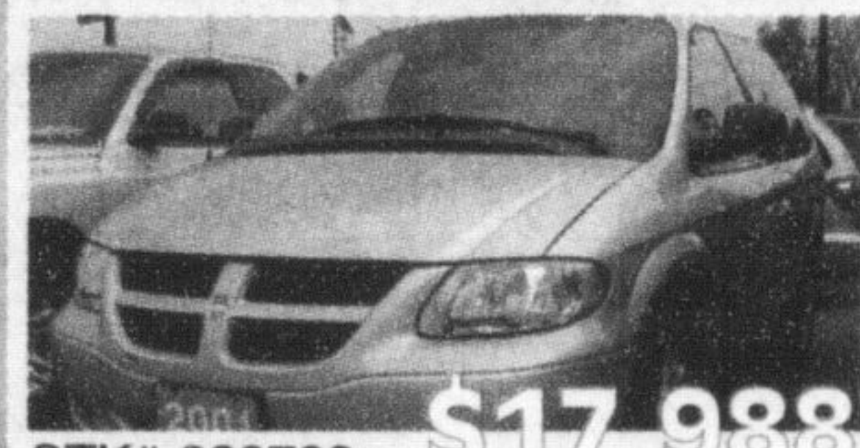
01 GR. CARAVAN SPORT