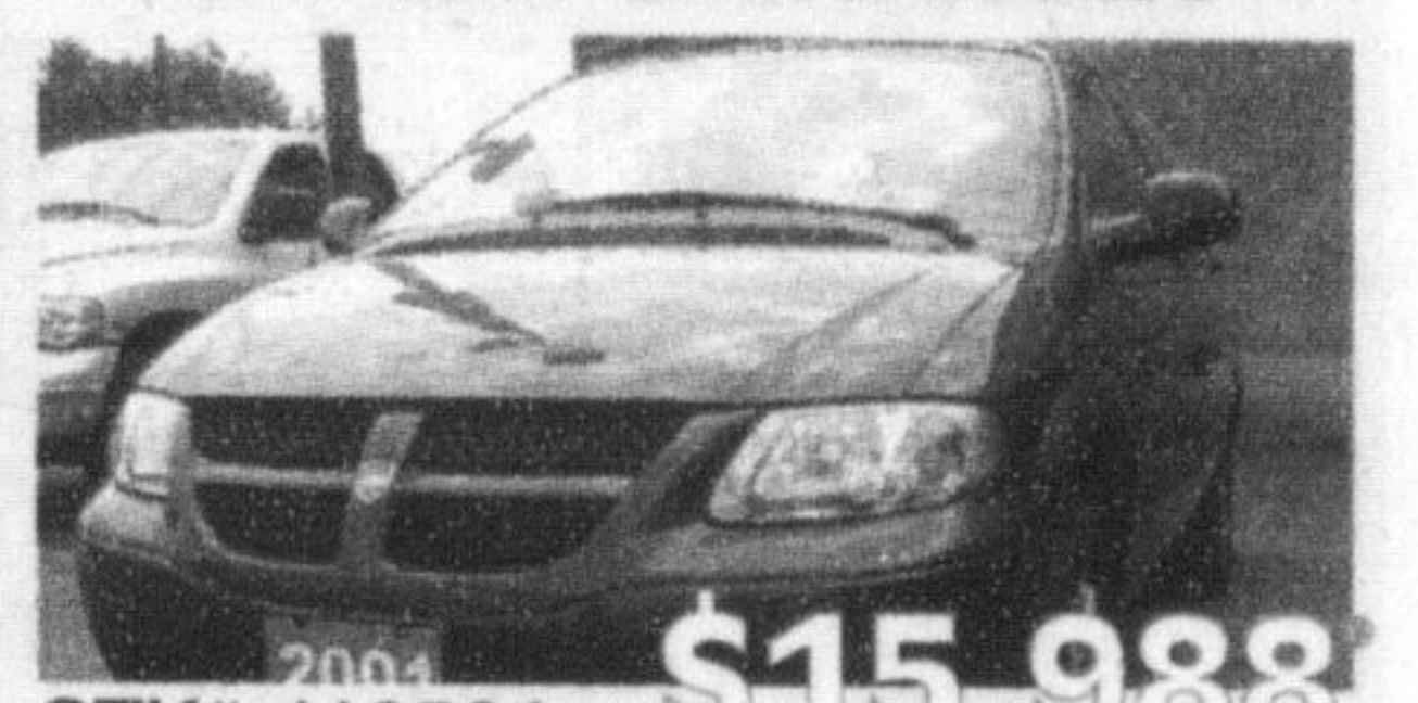
01 GR. CARAVAN