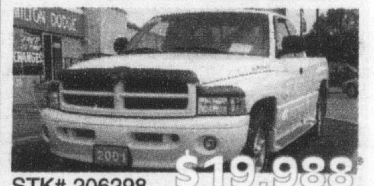
01 RAM CLUB CAB