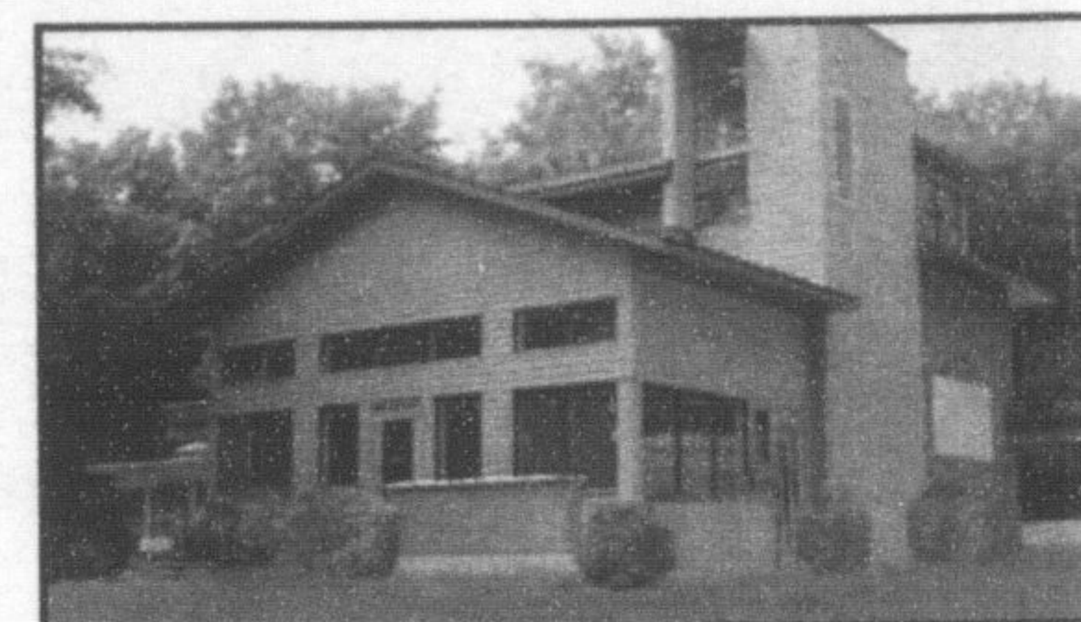
The facility is now complete.

Tours of the No. 15 Sideroad facility for chronically ill children will take place September 24 and 25 from 10 a.m. to 3 p.m. With phase one of the centre set to begin taking youngsters sometime next month, Rose Cherry's Home will serve up to six children at any one time — four in the respite unit and two more in the palliative care wing.