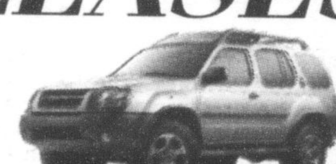
2004 NISSAN X-TERRA