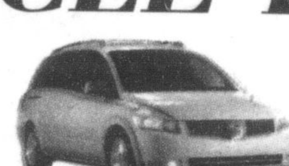
2004 NISSAN QUEST