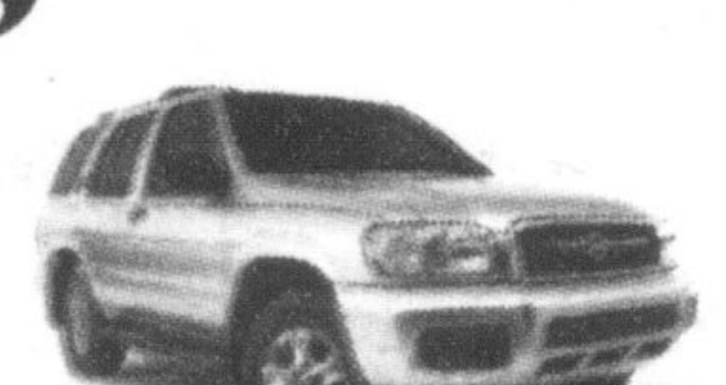
2004 NISSAN PATHFINDER