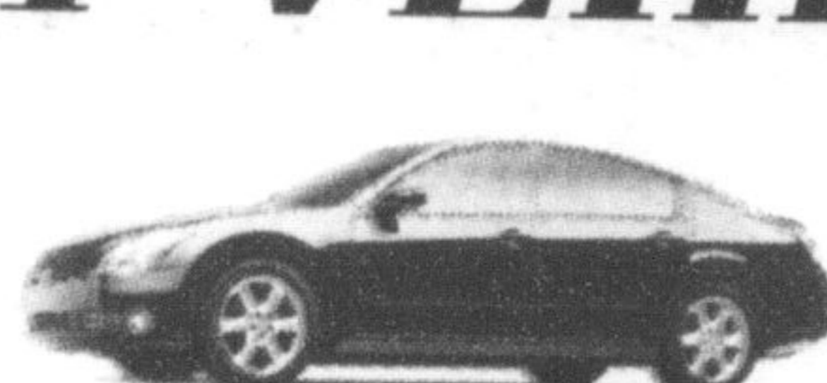
2004 NISSAN MAXIMA SE