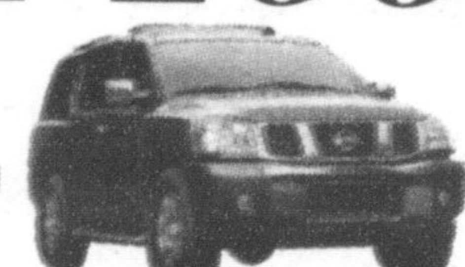
2004 NISSAN ARMADA