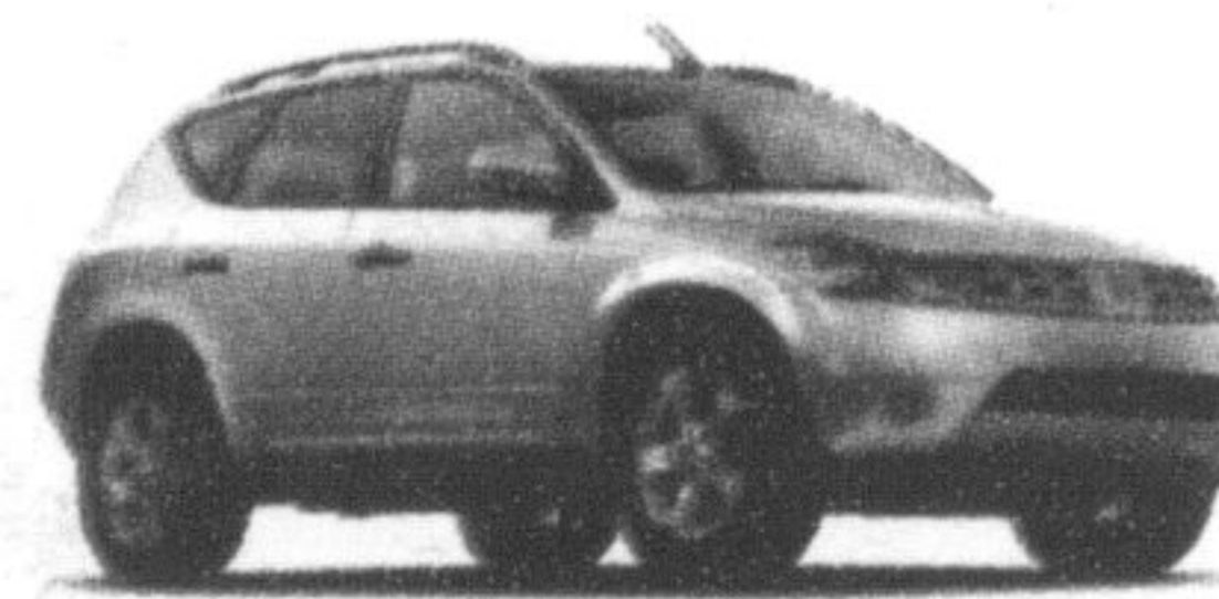
2004 NISSAN MURANO SE