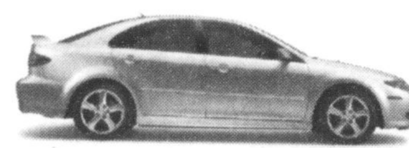
GT-I4 model shown 2004 MAZDA6 SPORT HATCHBACK GS-I4 AUTOMATIC TRANSMISSION

"THE FIVE-DOOR PRESENTS AN ENTIRELY DIFFERENT VEHICLE COMBINING THE LOOKS, HANDLING AND SIZE OF A SEDAN WITH THE ABILITY TO SWALLOW HUGE LOADS ON OCCASION." - Richard Russell, Halifax Chronicle-Herald*