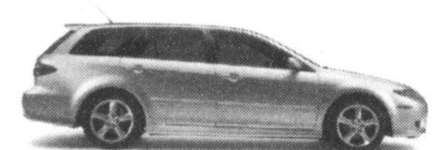
GS-V6 GFX model shown 2004 MAZDA6 SPORT WAGON GS-V6 AUTOMATIC TRANSMISSION STANDARD 3.0L DOHC 24-VALVE V6 ENGINE