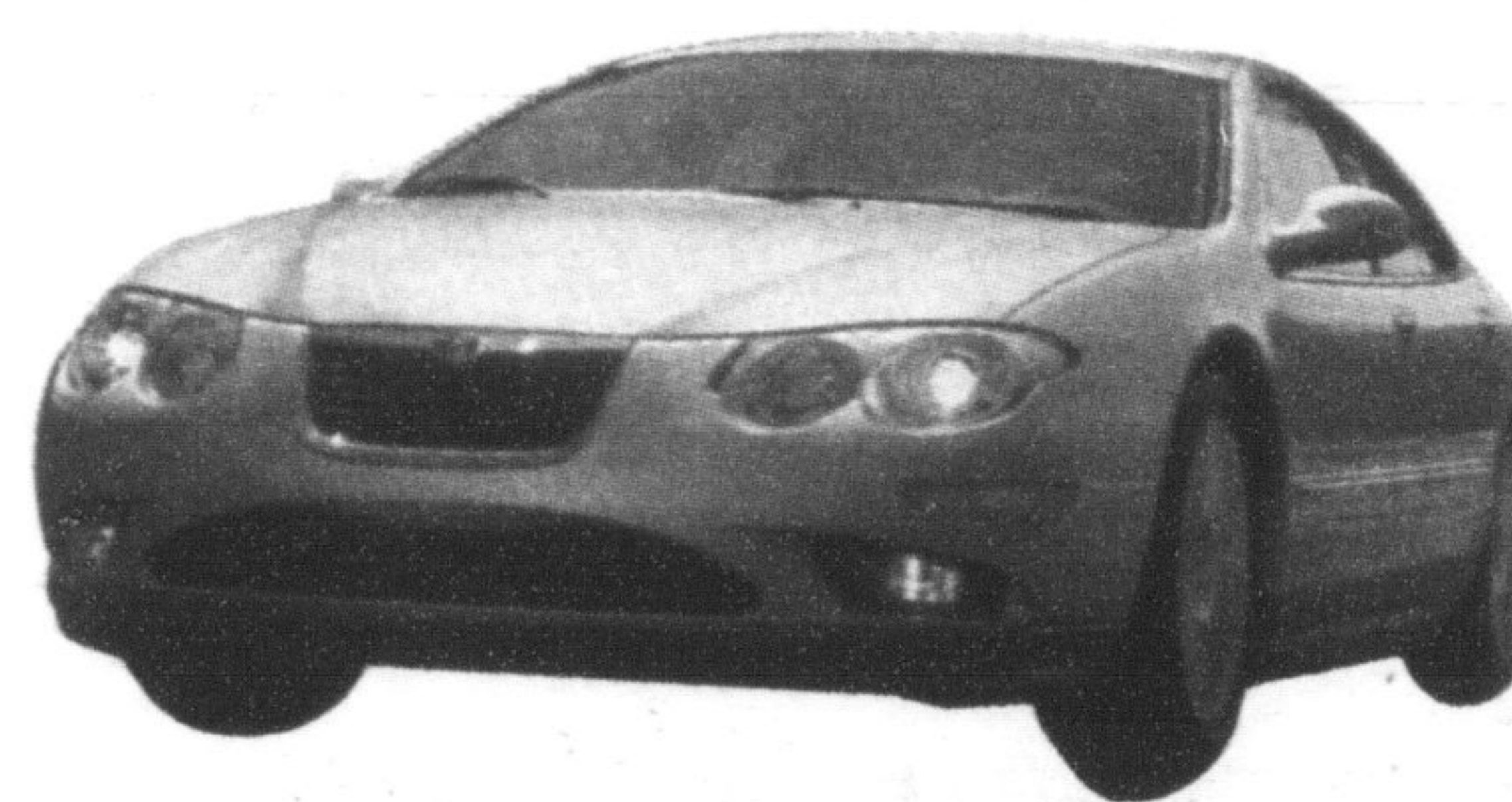
2004 300M SELL OFF!