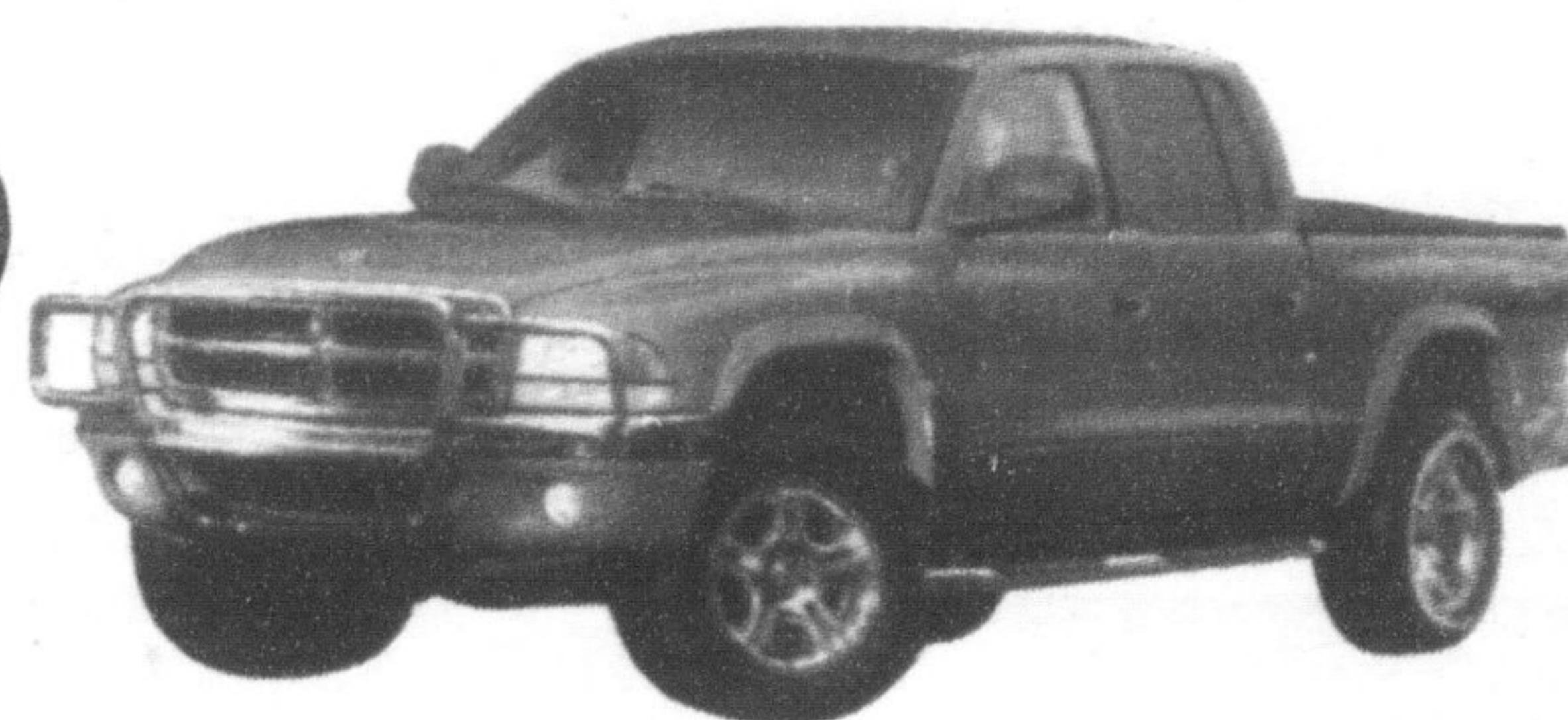
2004 DAKOTA SELL OFF!