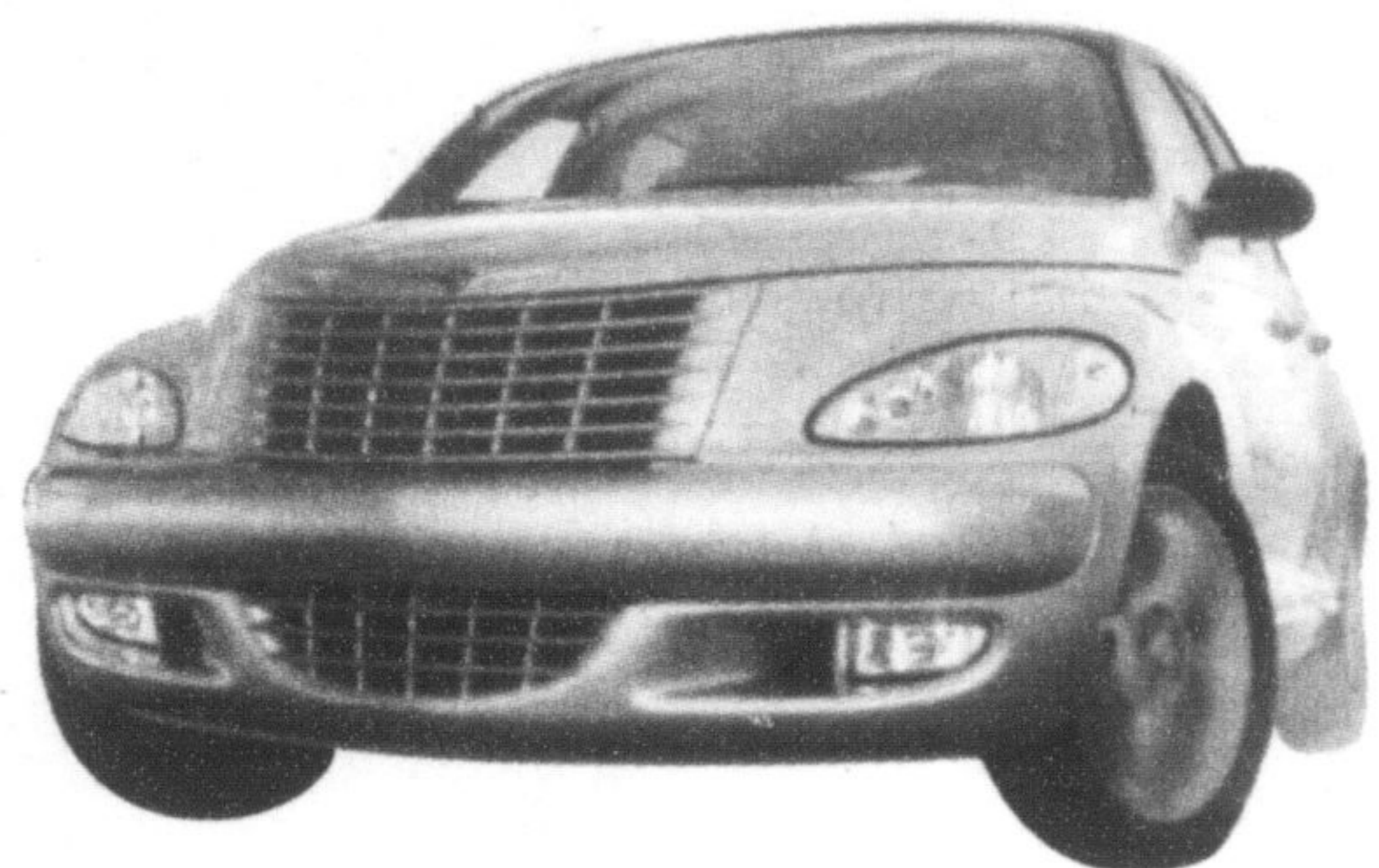
2004 PT CRUISER SELL OFF!