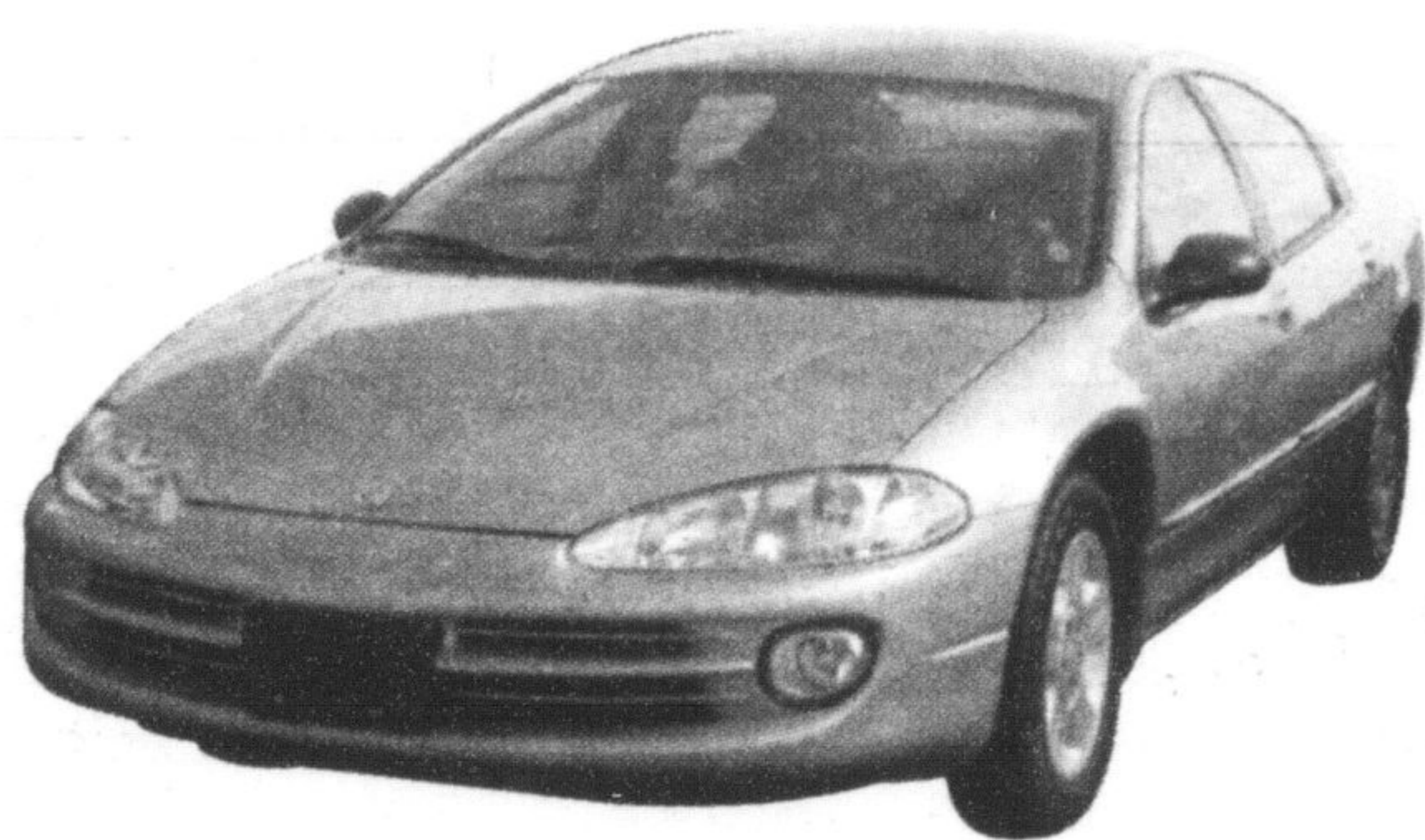
2004 INTREPID SELL OFF!