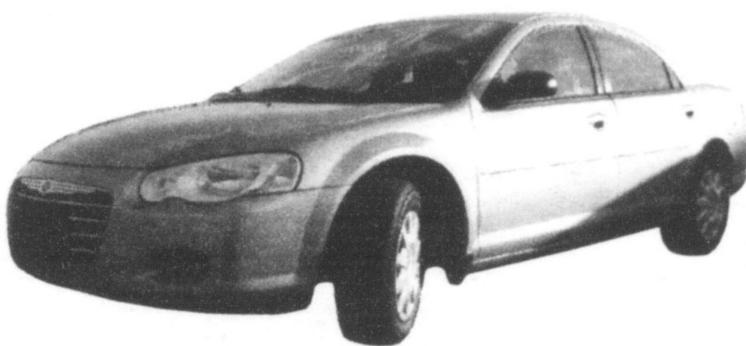
2004 SEBRING SELL OFF!