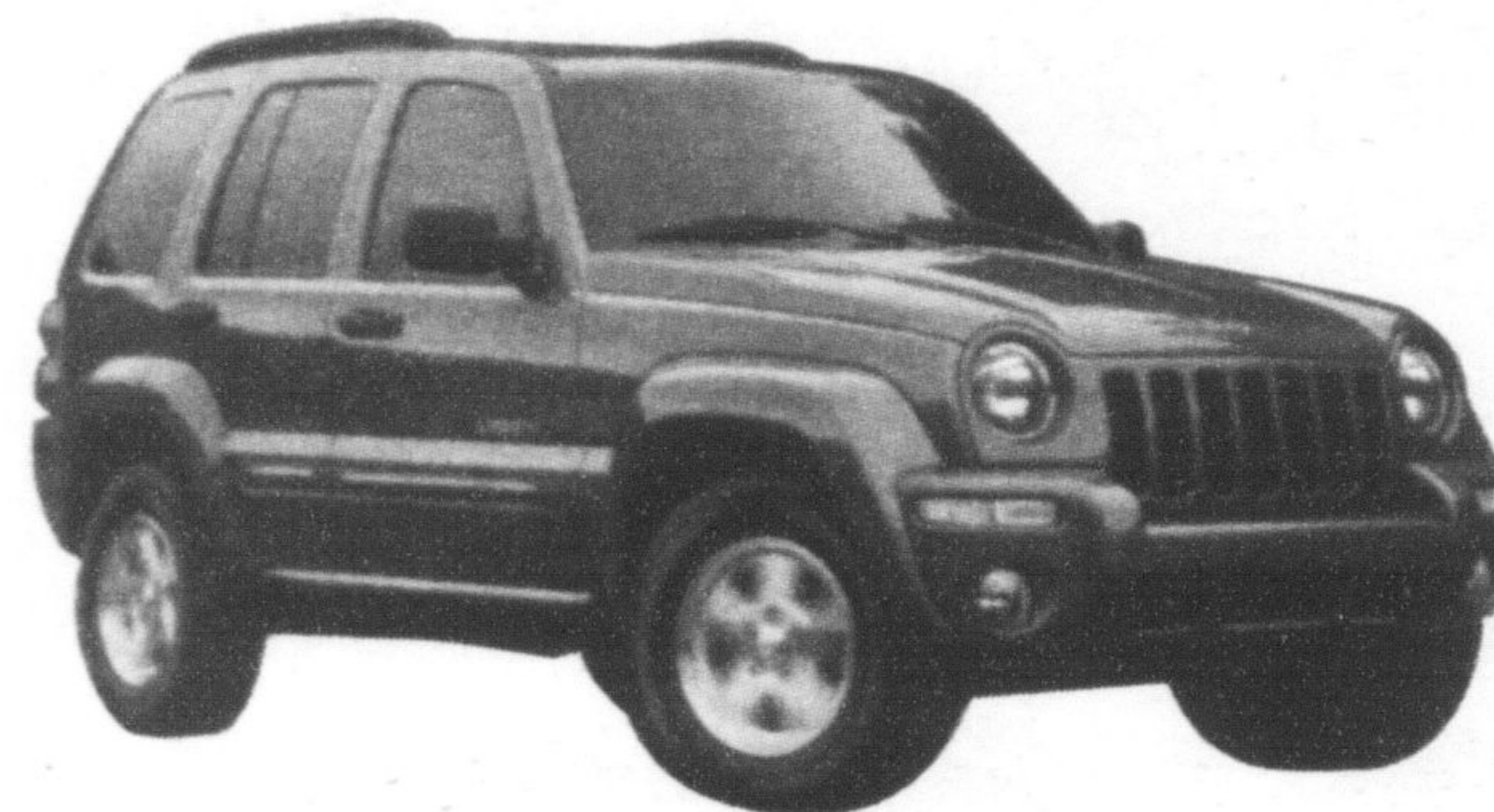
2004 LIBERTY SELL OFF!