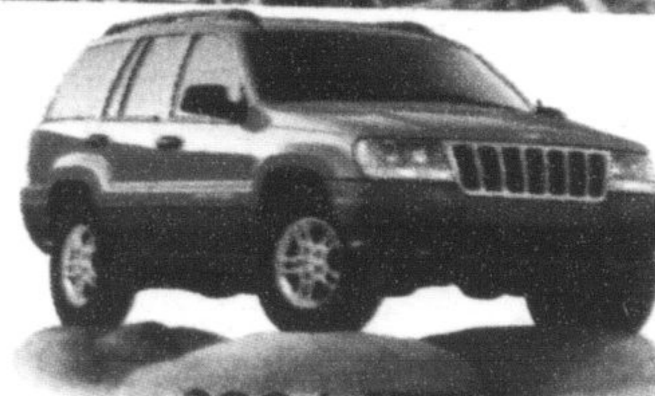
2004 JEEP GRAND CHEROKEE