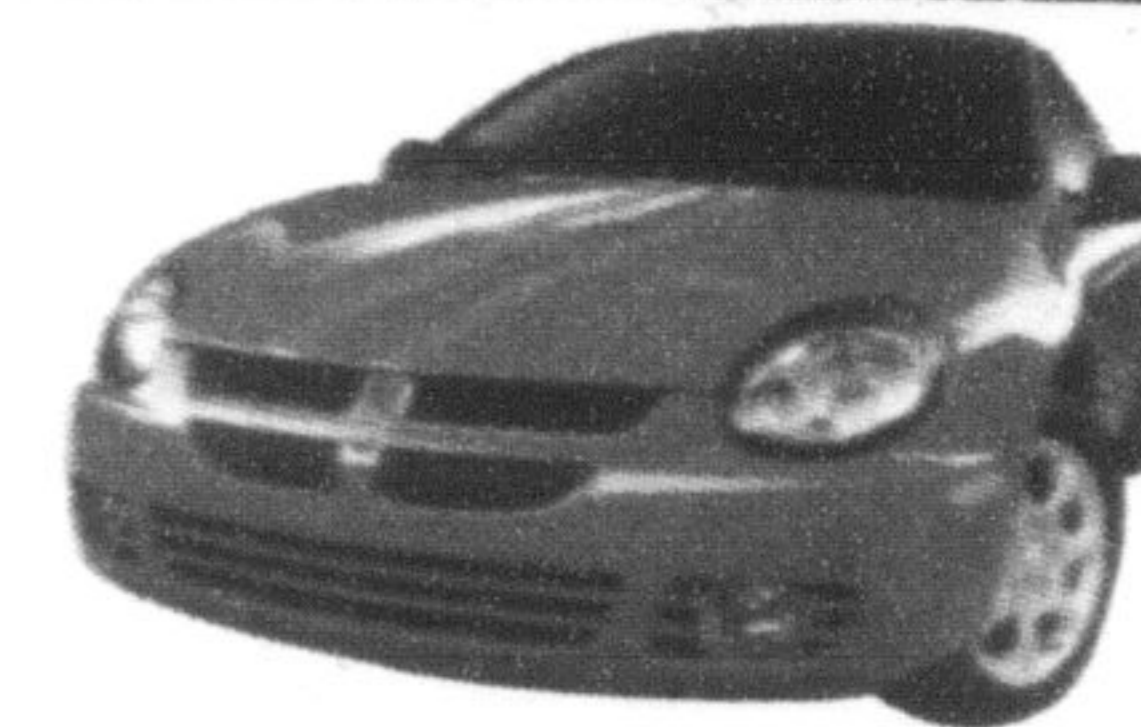
2004 DODGE SX 2.0