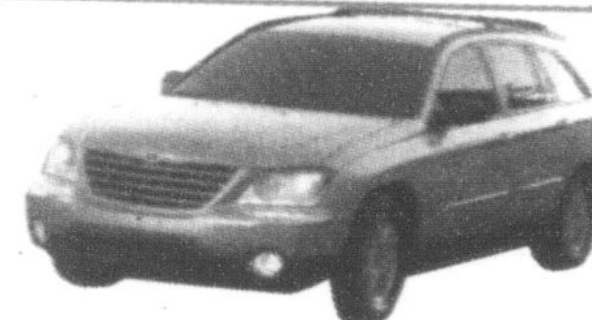
2004 CHRYSLER PACIFICA