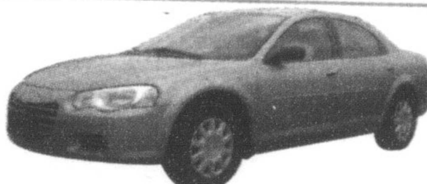
2004 CHRYSLER SEBRING SEDAN