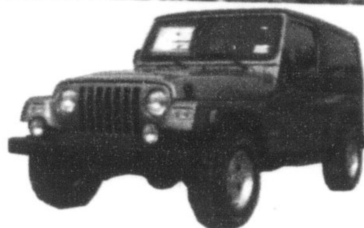
2004 JEEP TJ