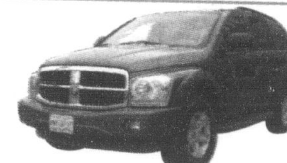
2004 DODGE DURANGO

EVERYTHING IS ON SALE - PLUS FREE LIFETIME OIL CHANGES!**