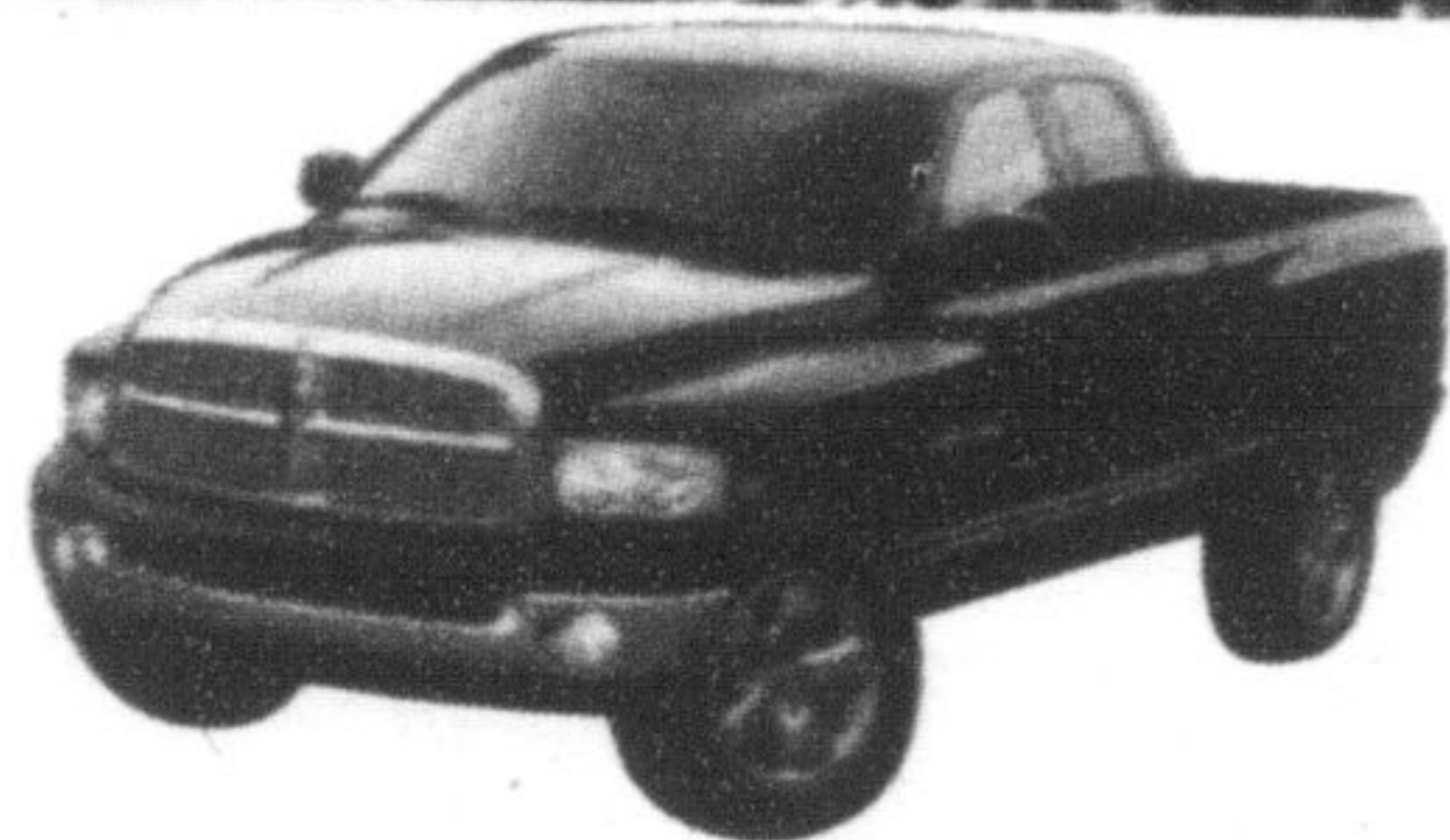
2004 DODGE RAM