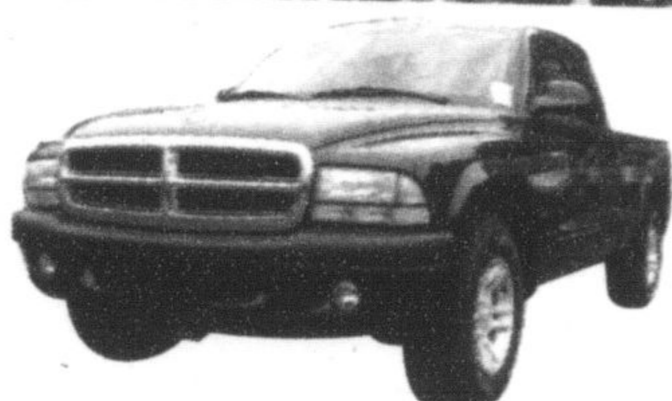
2004 DODGE DAKOTA