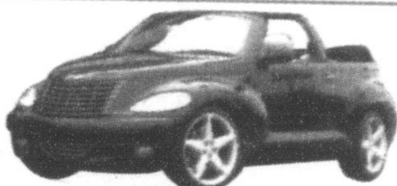
2004 CHRYSLER PT CRUISER CONVERTIBLE