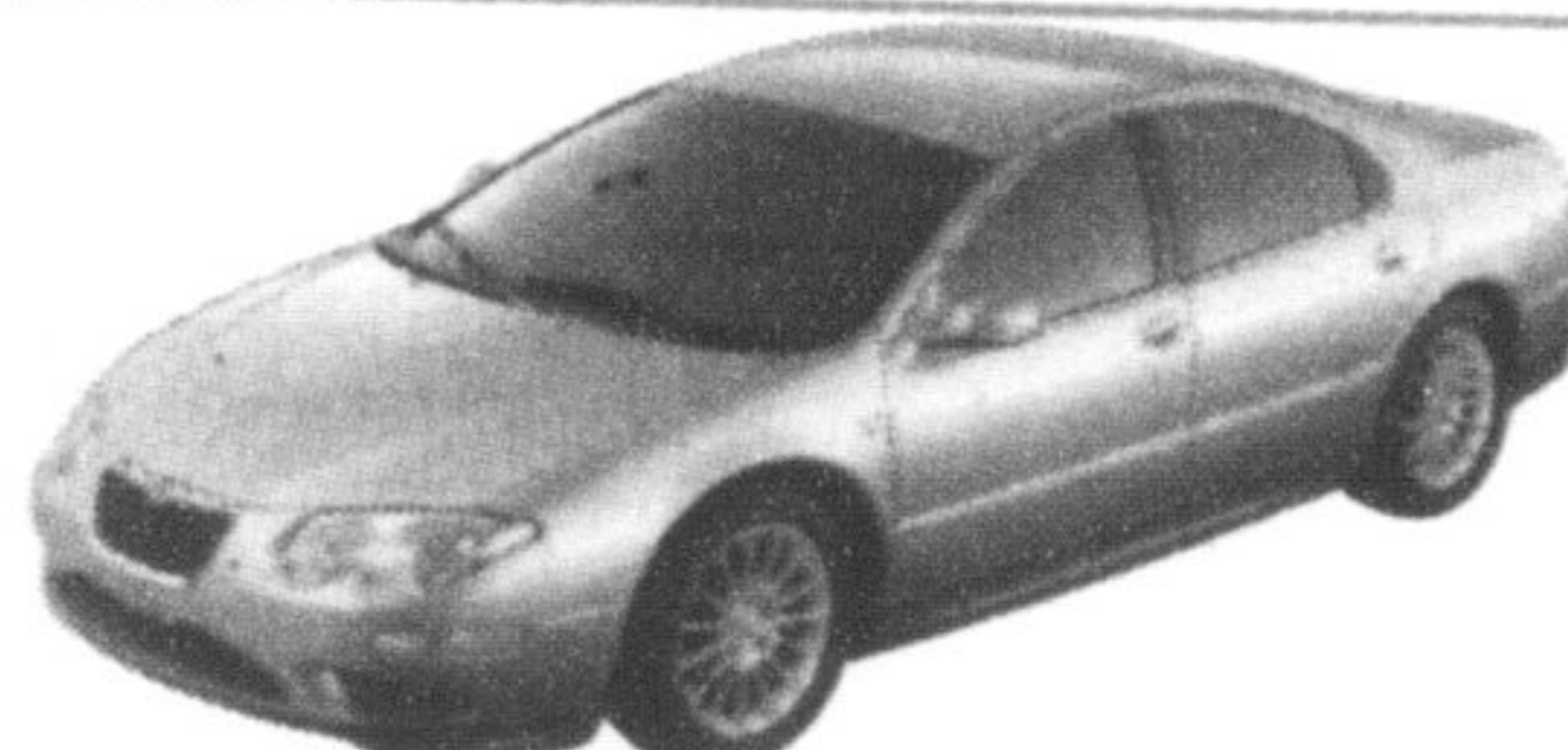
2004 CHRYSLER 300M