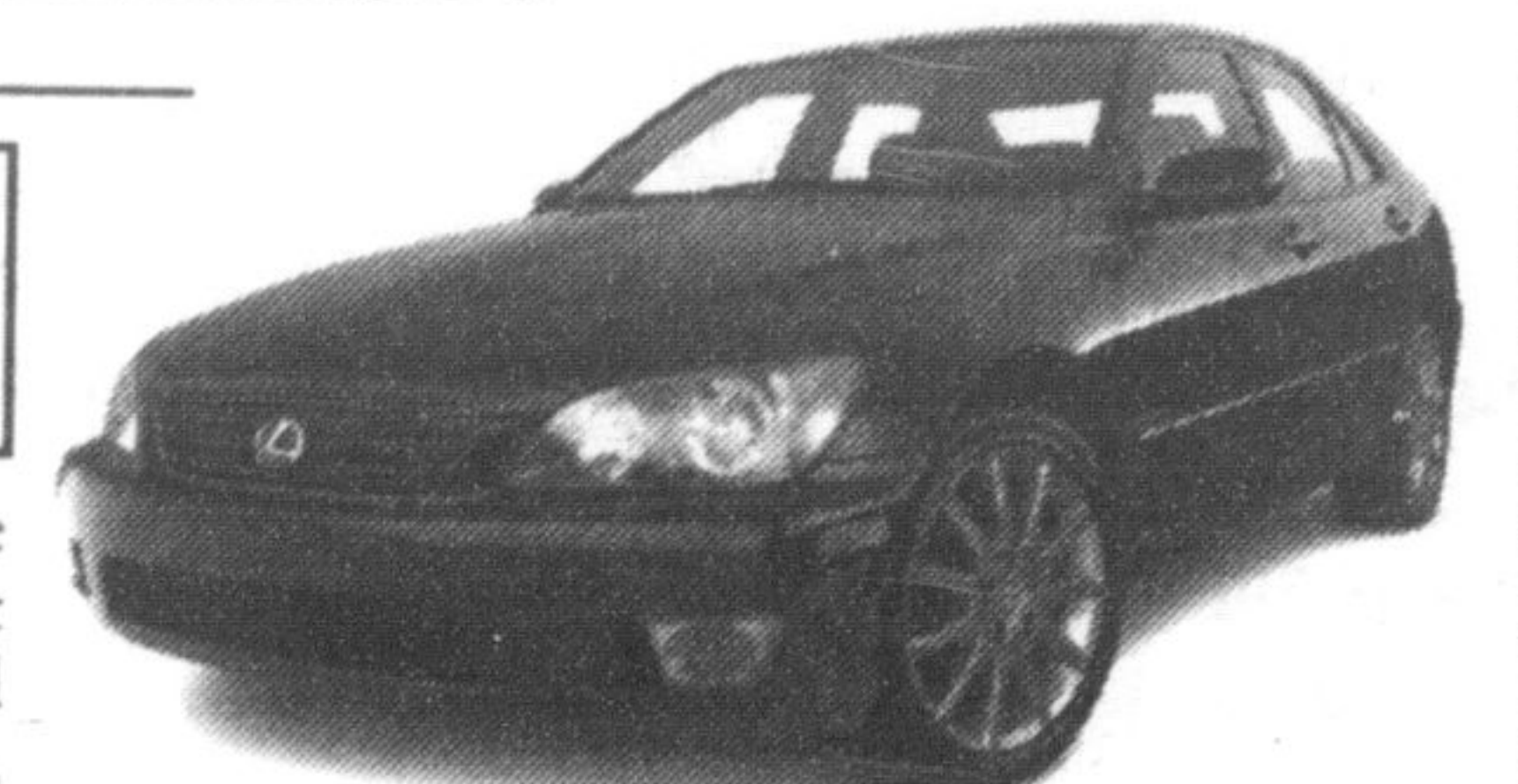
IS 300 SPORTDESIGN II**

Welcome aboard the Lexus IS300. The brainchild of Chief Engineer (and former race car driver) Nobu Katayama. For take off, simply step on the drilled-aluminum foot pedal, engage the polished chrome gearshift, and let the inline-six 215hp engine and rear-wheel drive propel you from 0-60 in a mere 7.1 seconds. To book your test flight, please visit Lexus of Oakville or www.lexusofoakville.ca .