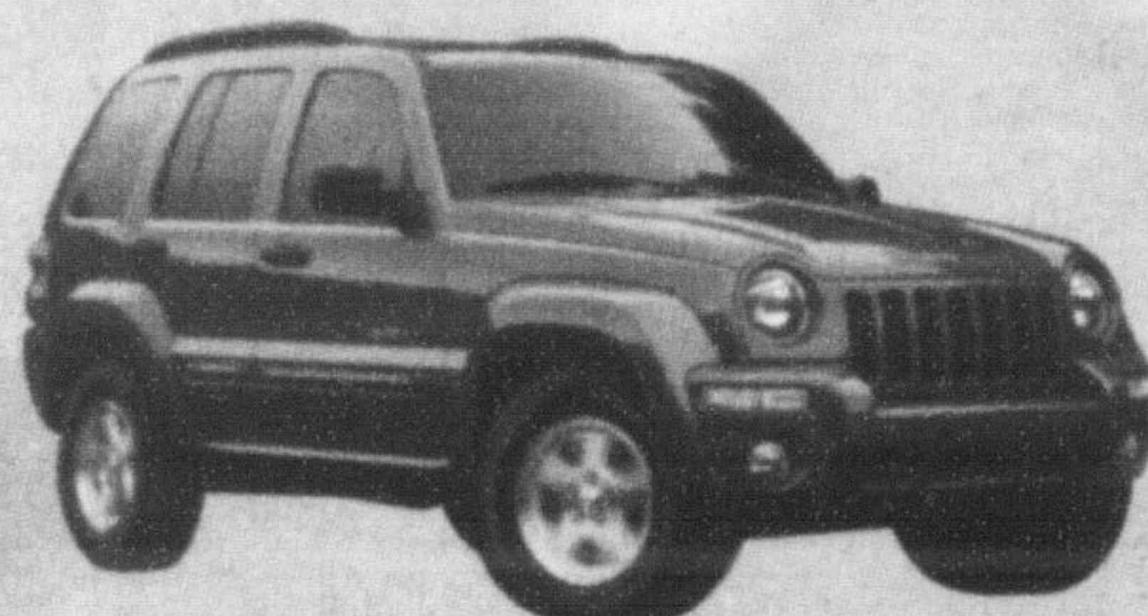
'04 Jeep Liberty