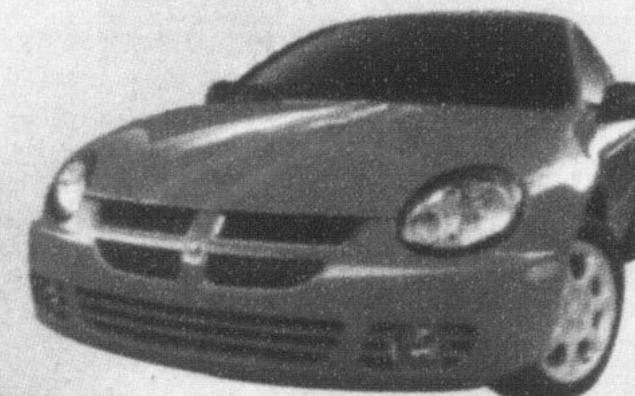
'04 Dodge SX 2.0