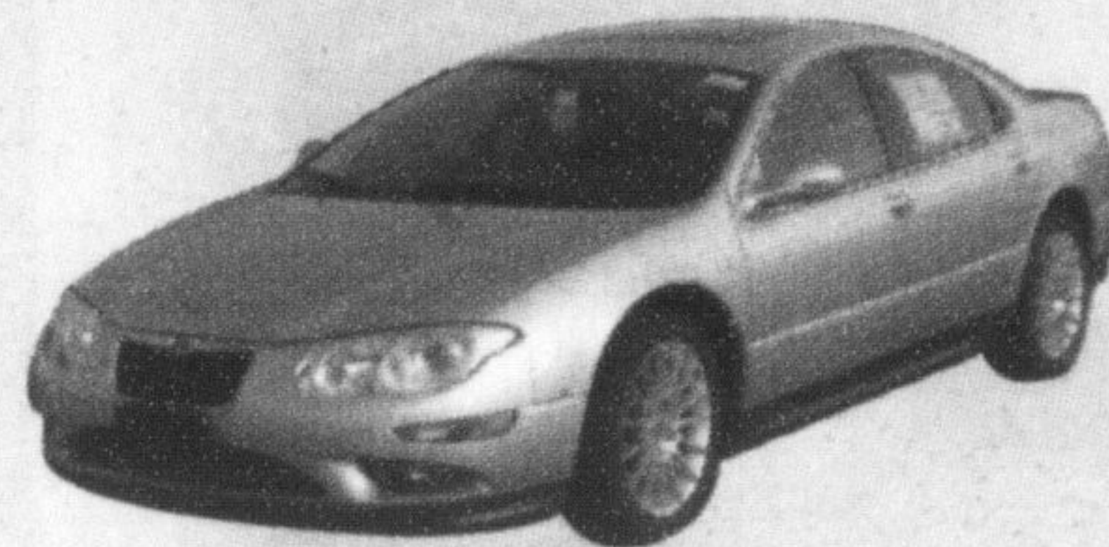
'04 Chrysler 300M