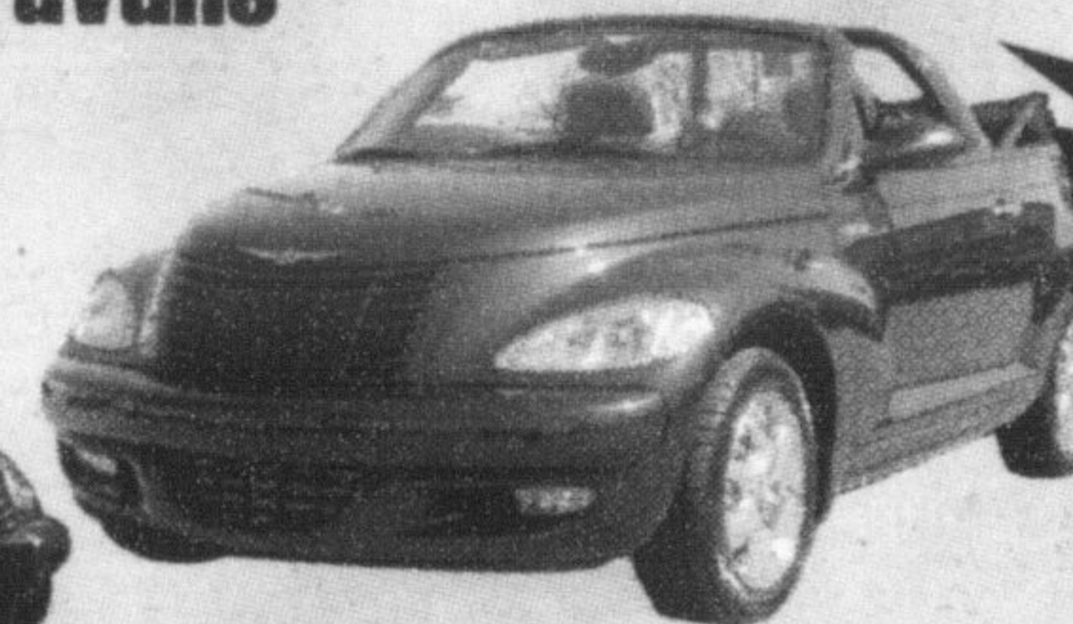
'05 PT Cruiser Convertible