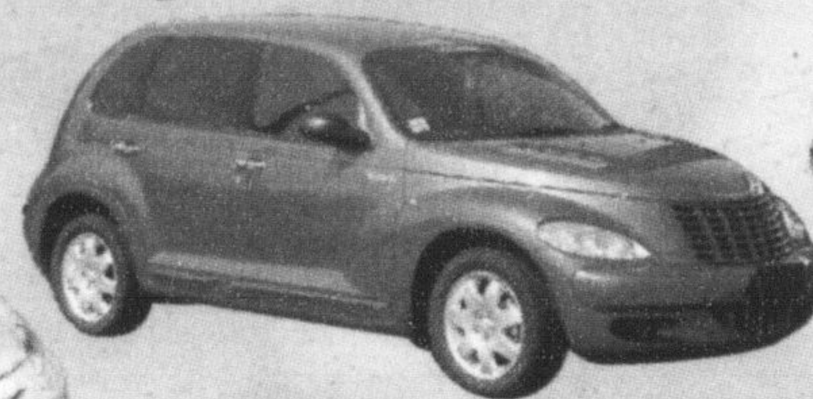
'04 PT Cruiser