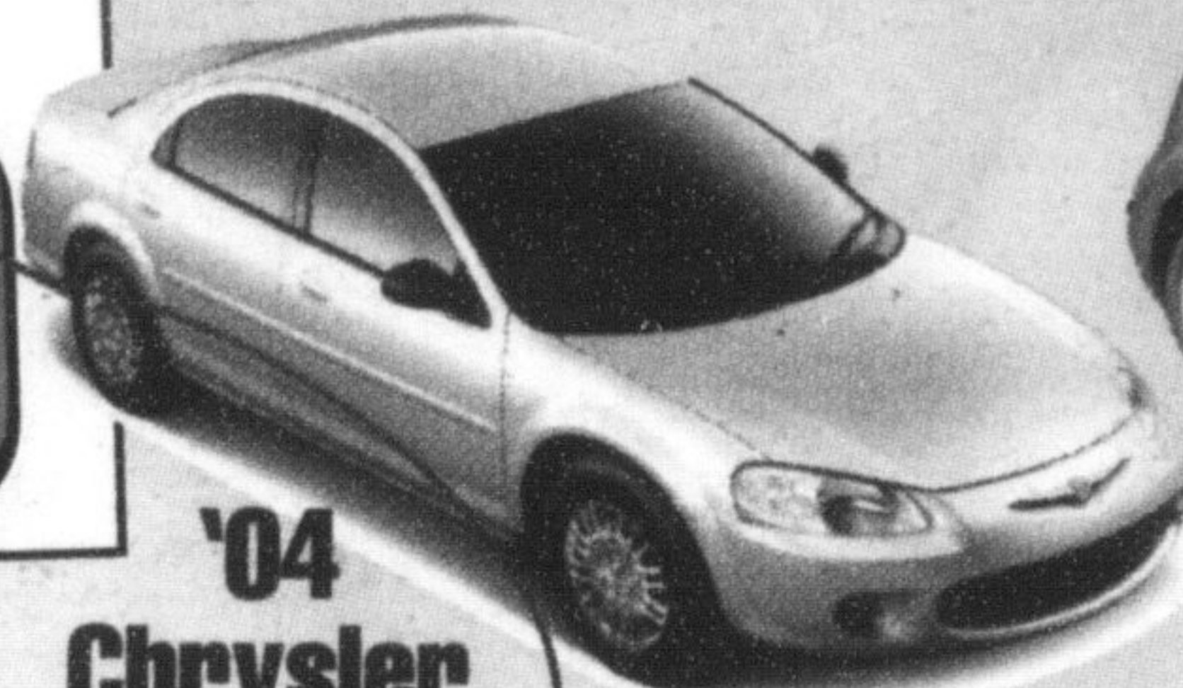
'04 Chrysler Sebring