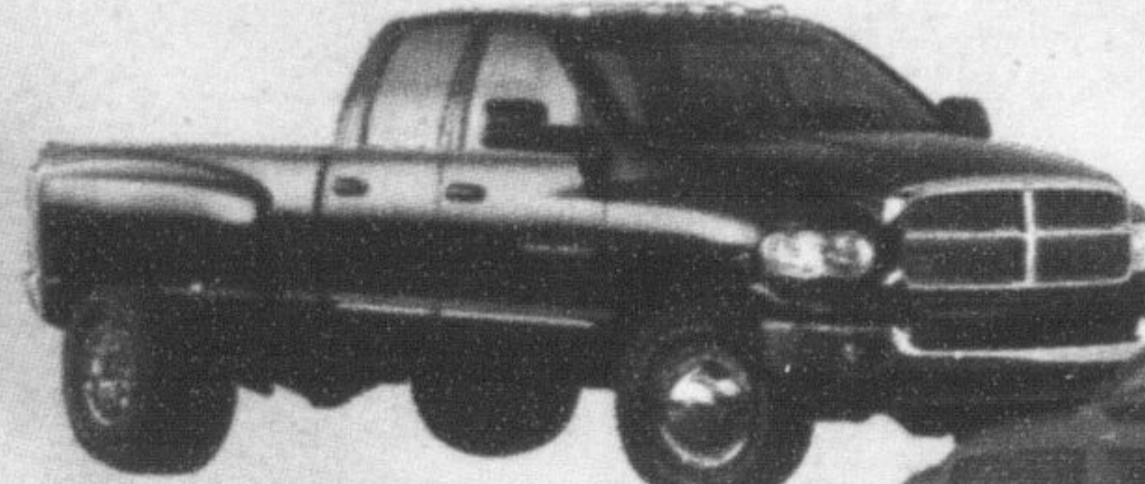
'03 & '04 Dodge Ram Pick-Up's