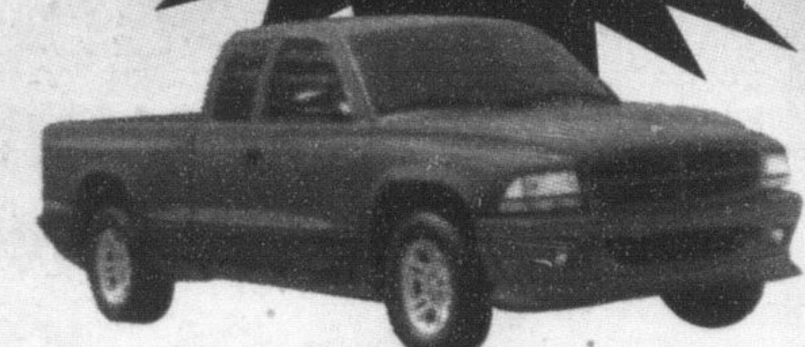
'04 Dodge Dakota