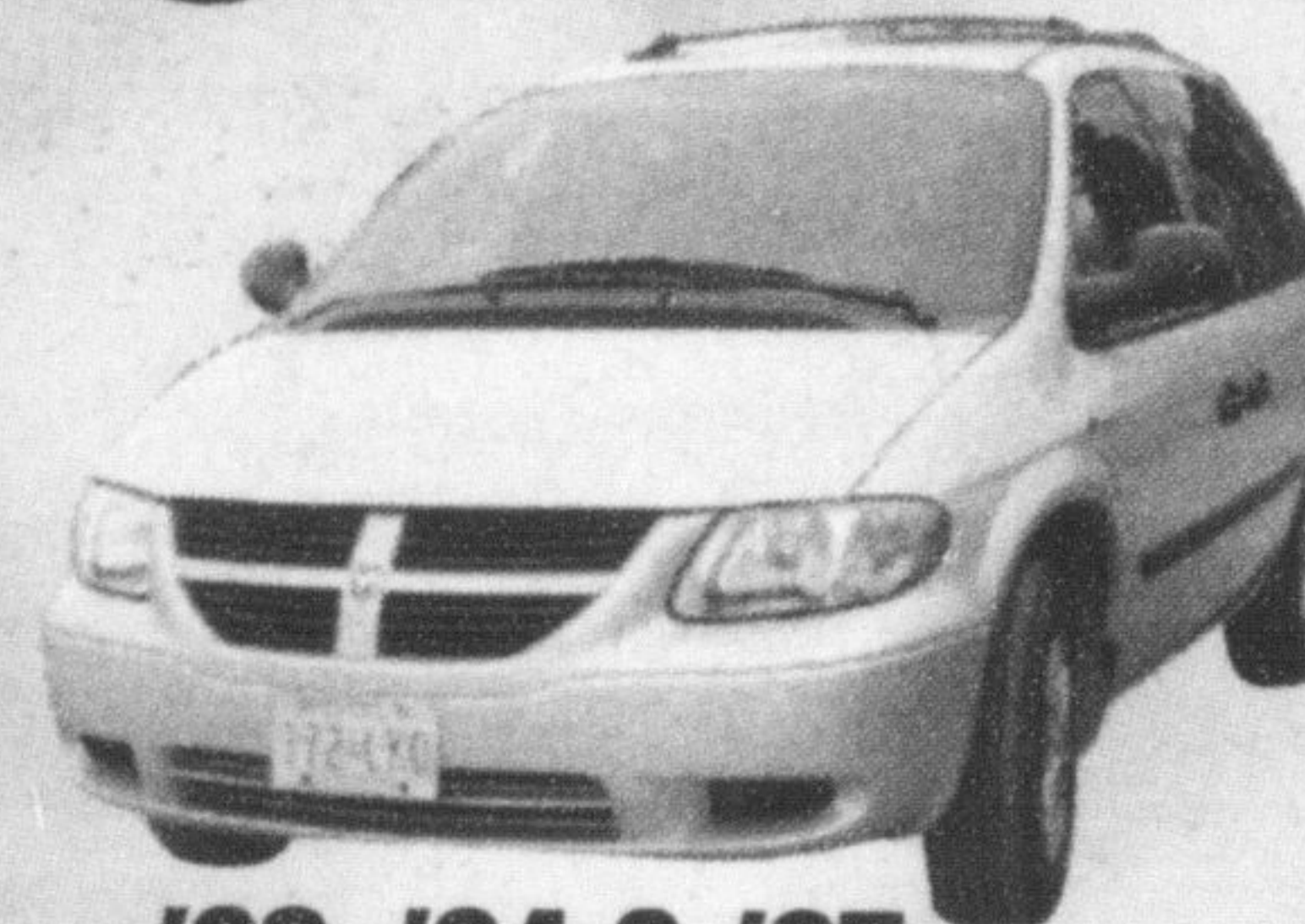
'03, '04 & '05 Dodge Caravans