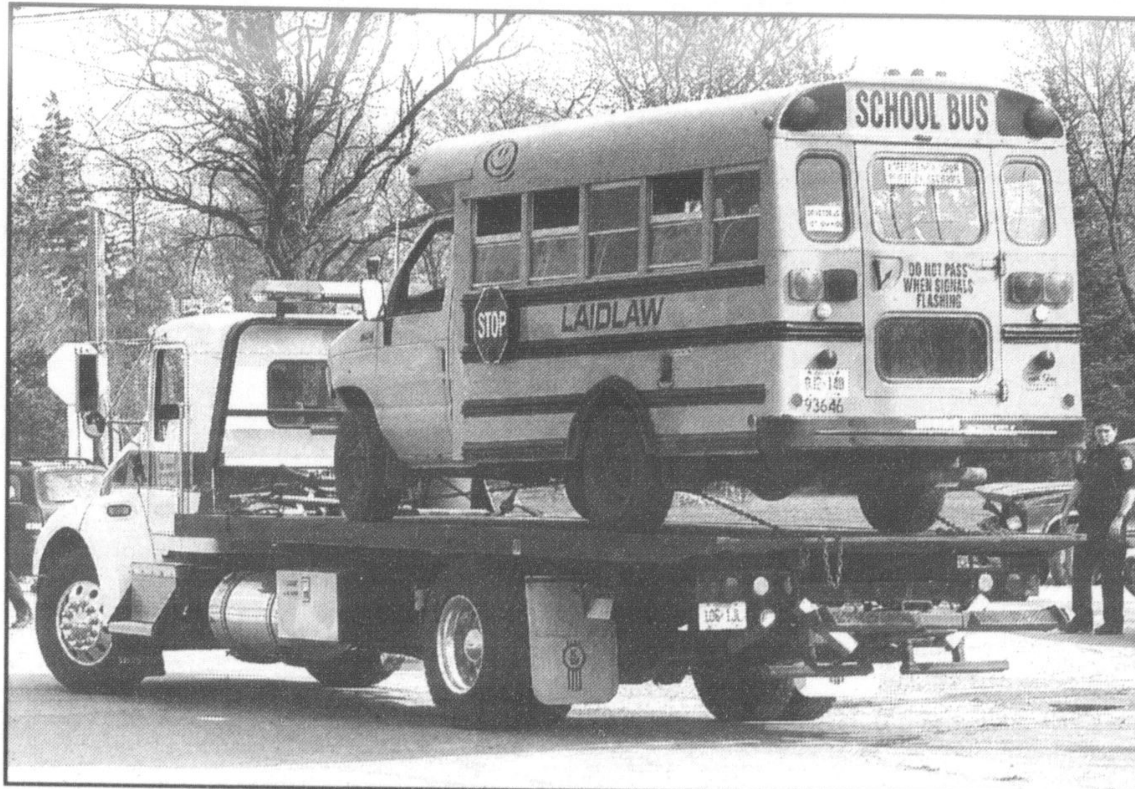
A school bus that ended up in a ditch is taken away from the scene.

The driver of the Trailblazer was charged with failing to yield.