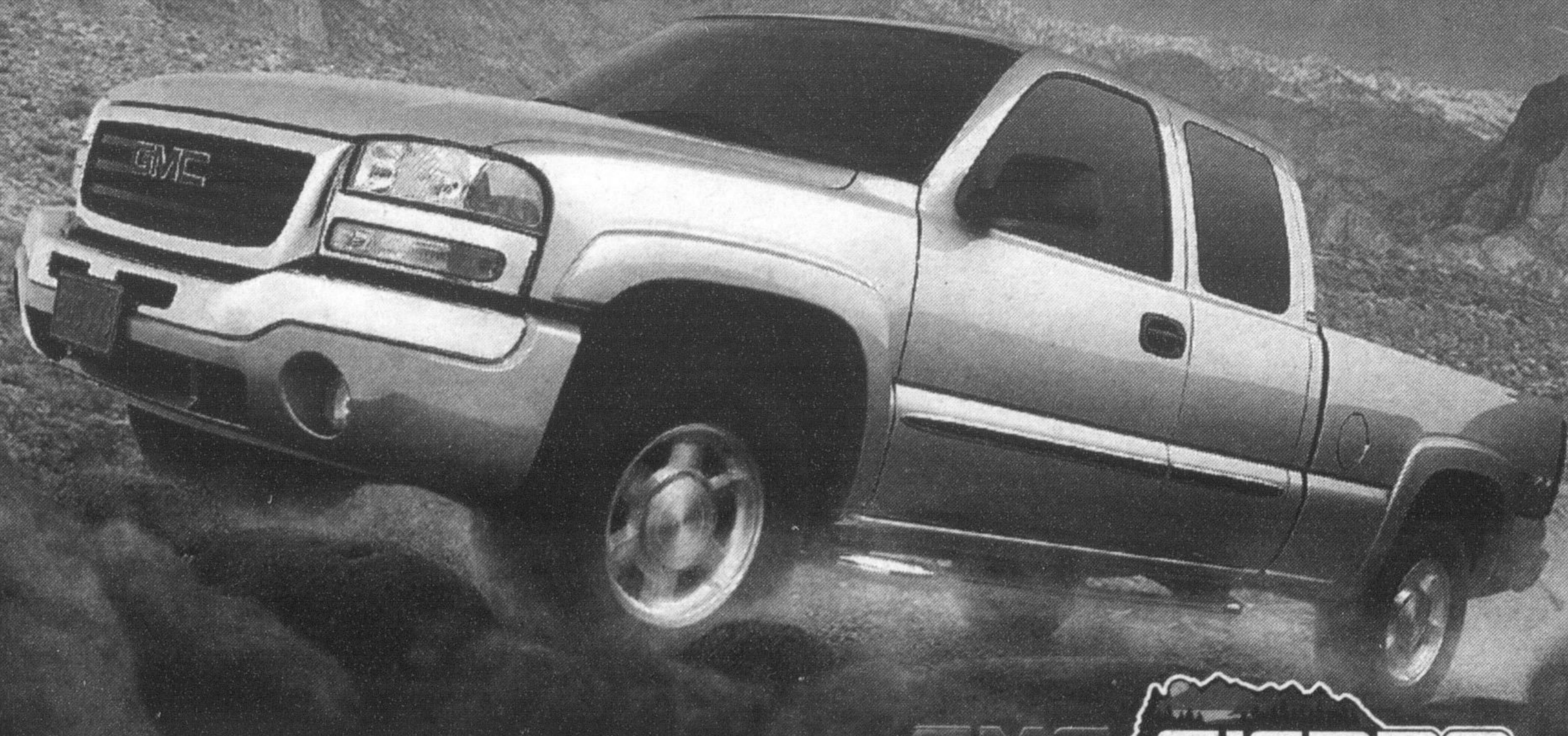
Sierra SLE 4x4 model shown