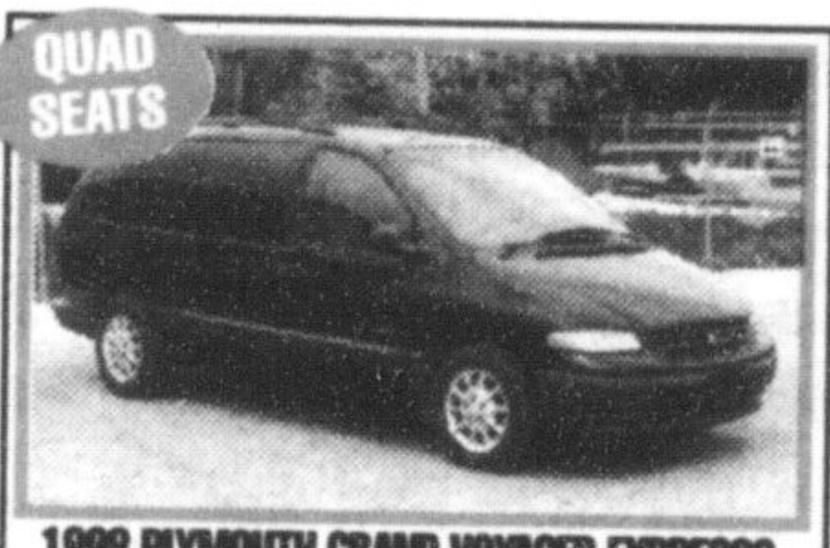
1998 PLYMOUTH GRAND VOYAGER EXPRESS 4 dr, auto, pw, pdl, tilt, cruise, CD, A/C, ABS, keyless entry, loaded, Super clean! 104,000kms. ONLY $8,998