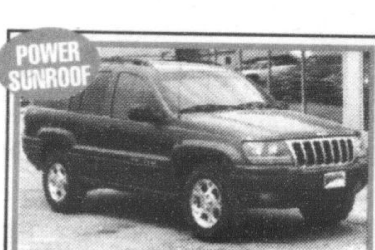
2001 JEEP GRAND CHEROKEE LAREDO 4 dr, auto, 6 cyl, steel blue/grey cloth, excellent condition, pw, pdl, CD, keyless entry, alloy wheels, boxliner, a/c & more. Don't delay, 141,000kms. ONLY $15,998