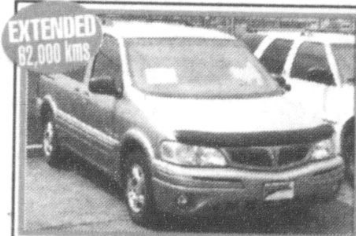
2001 PONTIAC MONTANA EXTENDED Auto, 4 dr, 3.4L, 6 cyl, taupe/beige, fog lights, roof rack, bucket seat, air, CD, pw, pl, cruise, tilt, keyless entry, ABS. ONLY $15,998