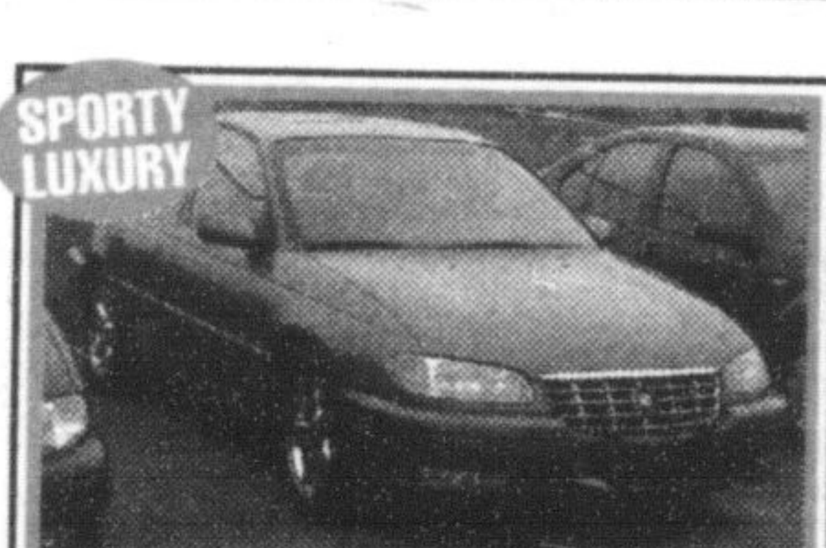
1998 CADILLAC CATERA 4 dr, auto, absolutely loaded, Bose CD, p/heated seats, leather, traction control, ABS, p/sunroof, alarm. Loaded, 115,000 kms. ONLY $10,998