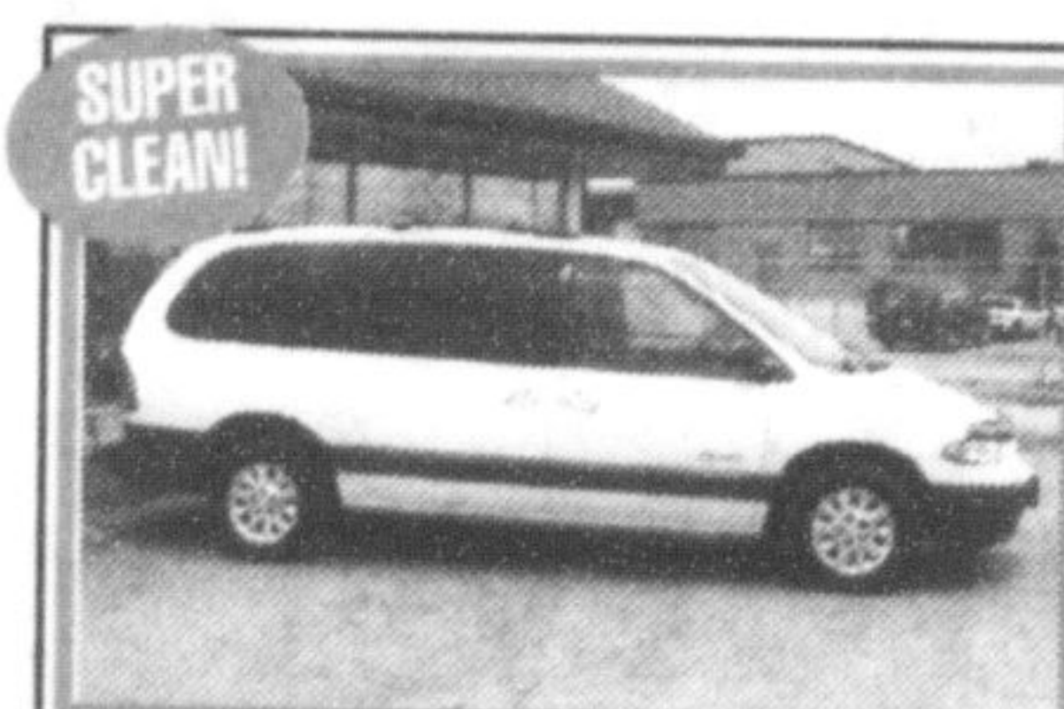
1999 PLYMOUTH GRAND VOYAGER SE 4dr, Auto, 3.3L, V6, white-grey cloth, pw, pdl, tilt, cruise, A/C, ABS, Alloy Wheels, 104,000km ONLY $8,998