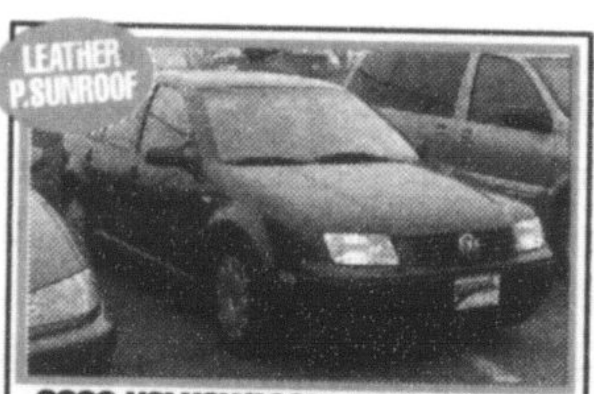
2000 VOLKSWAGON JETTA TDI GLS 4 dr, auto, fuel miser, Loaded, 86,400 kms. ONLY $16,998