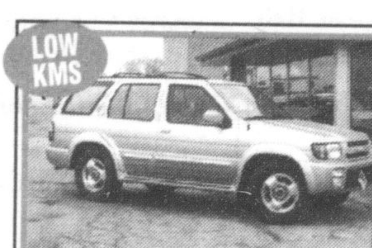
1999 INFINITI QX4 4x4 Auto, 3.3L, V6, 4x4, gold ext., tan int., alloy, running boards, sunroof, leather bucket seats, p/seat, heated seats, a/c, cd, pl, pm, cruise, keyless entry, compass, 72,238kms. ONLY $19,998