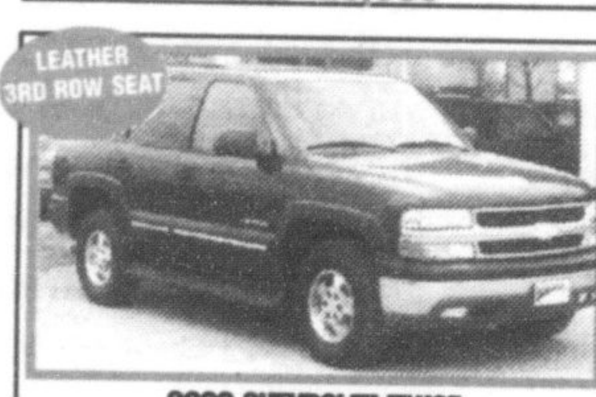
2003 CHEVROLET TAHOE 4dr, auto, 5.3L, V8, dark blue/grey leather, Bose CD, rear a/c, p/seat, running boards, reminder of factory warranty, 7 passenger, loaded, 44,000km ONLY $34,998