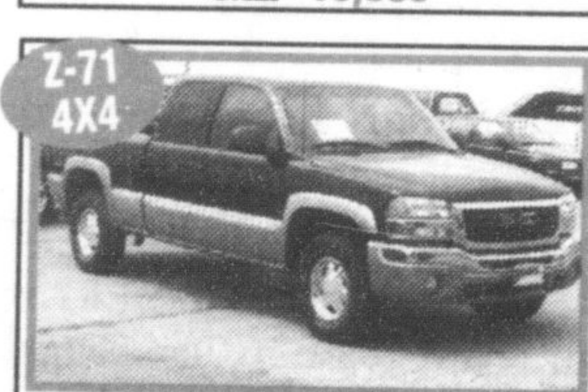
2003 GMC SIERRA SLE EXT 4x4 2-71 4dr, auto, 5.3L, V8, black & pewter two-tone, black cloth bucket seats, p/seat, chrome, polished alloy wheels, centre console, CD, boxliner, dual zone climate, 58,421kms. ONLY $28,998