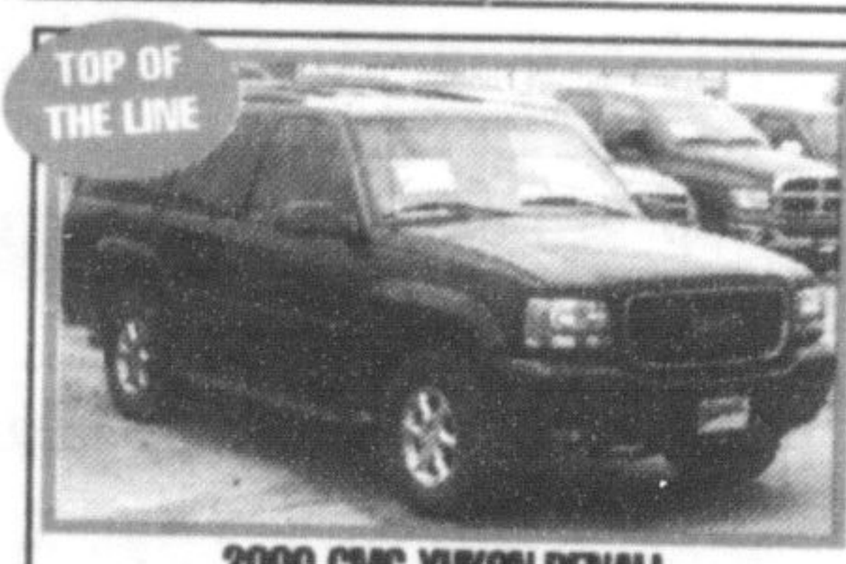
2000 GMC YUKON DENALI 4 dr, auto, V8, Diamond black, beige leather, super clean! 4x4, heated p/seat, OnStar, keyless entry, chrome wheels, rear A/C, Bose CD w/ass, trailer tow pkg, loaded, 120,000km. ONLY $22,998