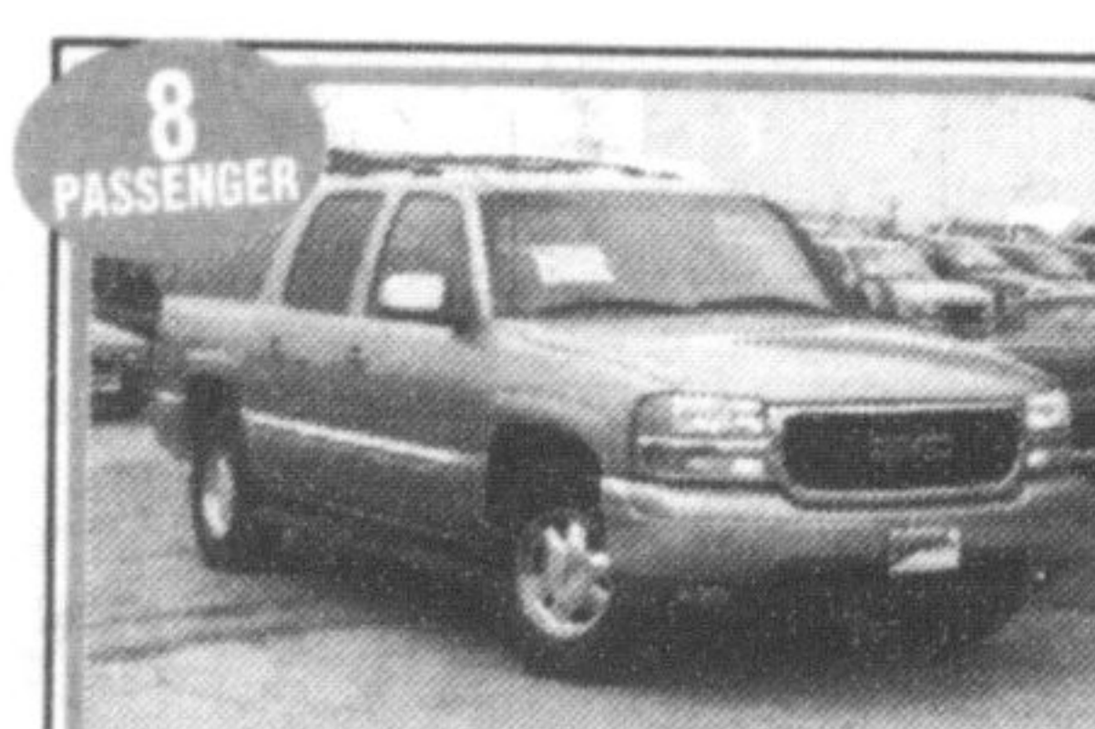
2000 GMC YUKON XL 4dr, auto, 5.3L, V8, pewter/ivory leather, 4x4, heated seats, rear A/C & heat, CD, keyless entry, super clean! OnStar, 92,000km ONLY $25,998