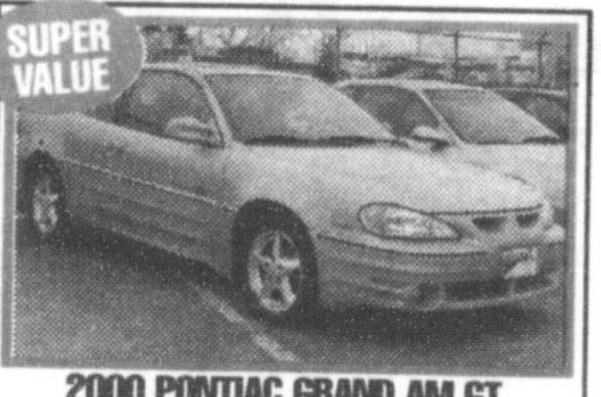
2000 PONTIAC GRAND AM GT 2 dr, auto, 3.4L, V6, silver/charcoal cloth, pw, pl, tilt, cruise, AC, CD, traction control. Loaded, 100,000 km. ONLY $10,998