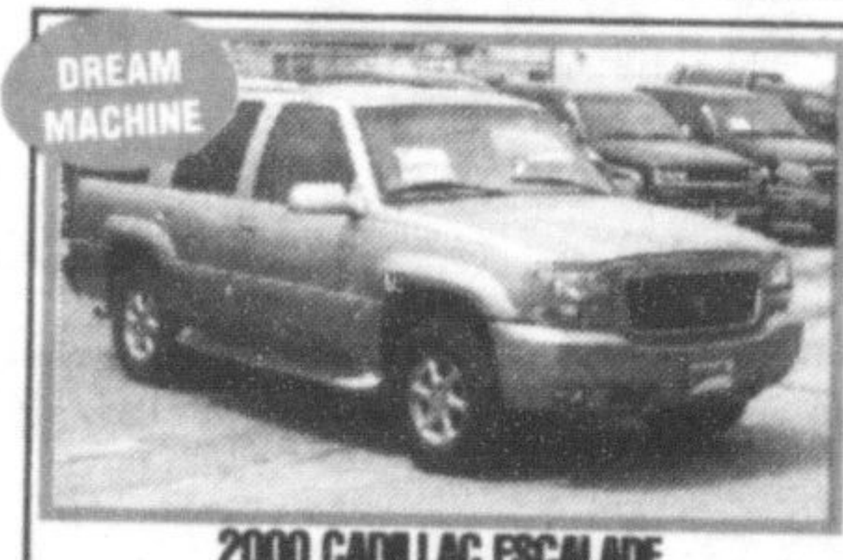
2000 CADILLAC ESCALADE 4 dr, auto, V8, pewter/ivory leather, must see condition! 4x4, heated p/seat, OnStar, keyless entry, chrome wheels, rear A/C, Bose CD w/ass, trailer tow pkg, loaded, 109,000km. ONLY $24,998