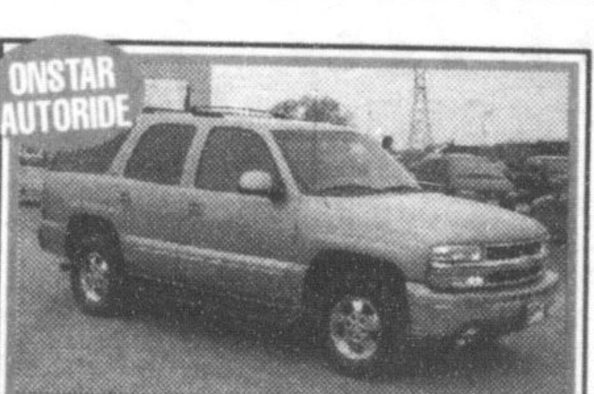
2001 CHEV TAHOE LT 4 dr, auto, 5.3L V8, pewter, ivory leather. Loaded. ONLY $25,998