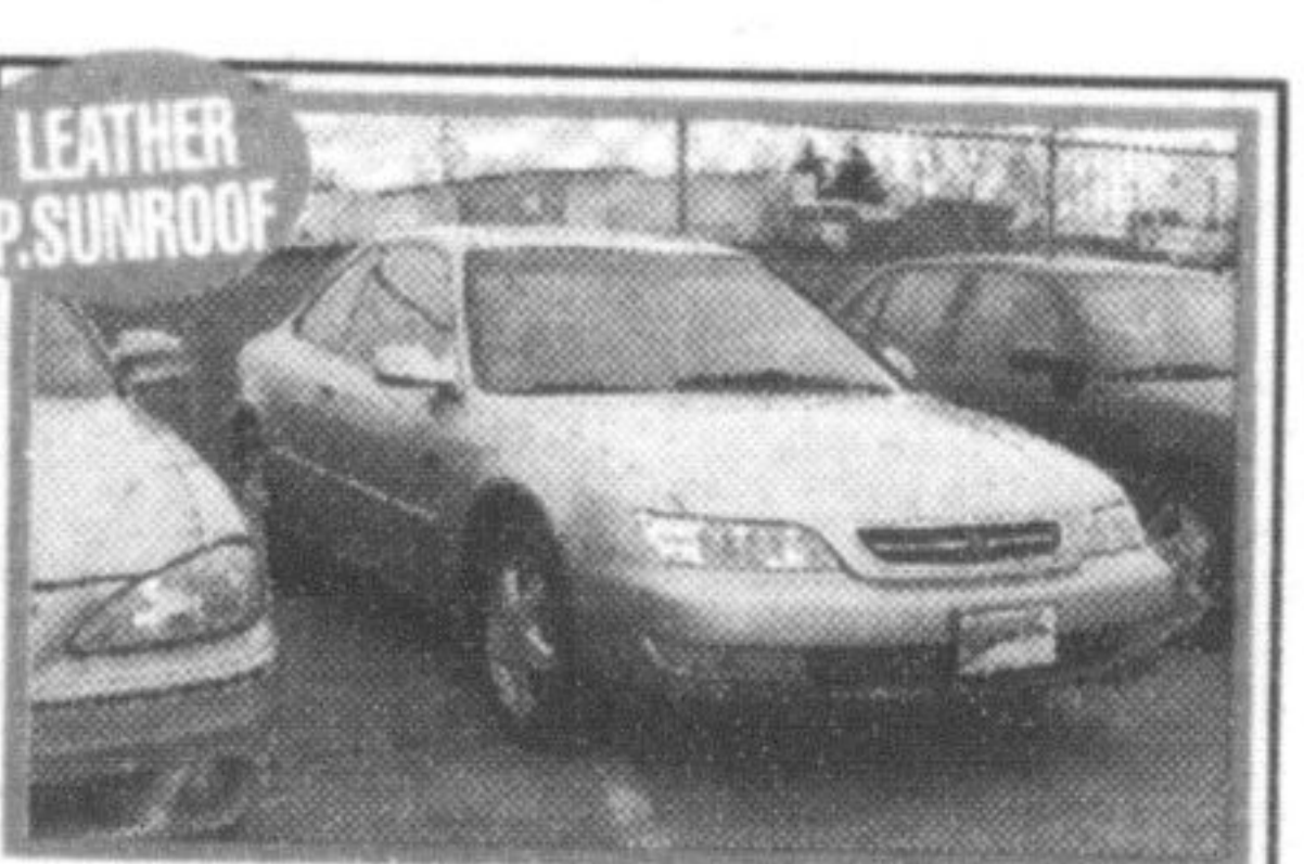
1997 ACURA 3.0 CL PREMIUM 2dr, auto, leather, p/sunroof, CD, loaded, 114,000 kms. ONLY $11,998