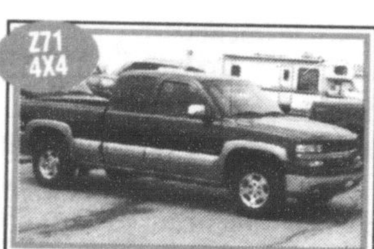
2001 CHEVROLET SILVERADO LS, EXT 4x4 Z71 4 dr, auto, 5.3L, V8, two tone paint, excellent cond., pw, pdl, tilt, cruise, CD, keyless entry, alloy wheels, boxliner, a/c & more, 72,000kms. ONLY $23,998