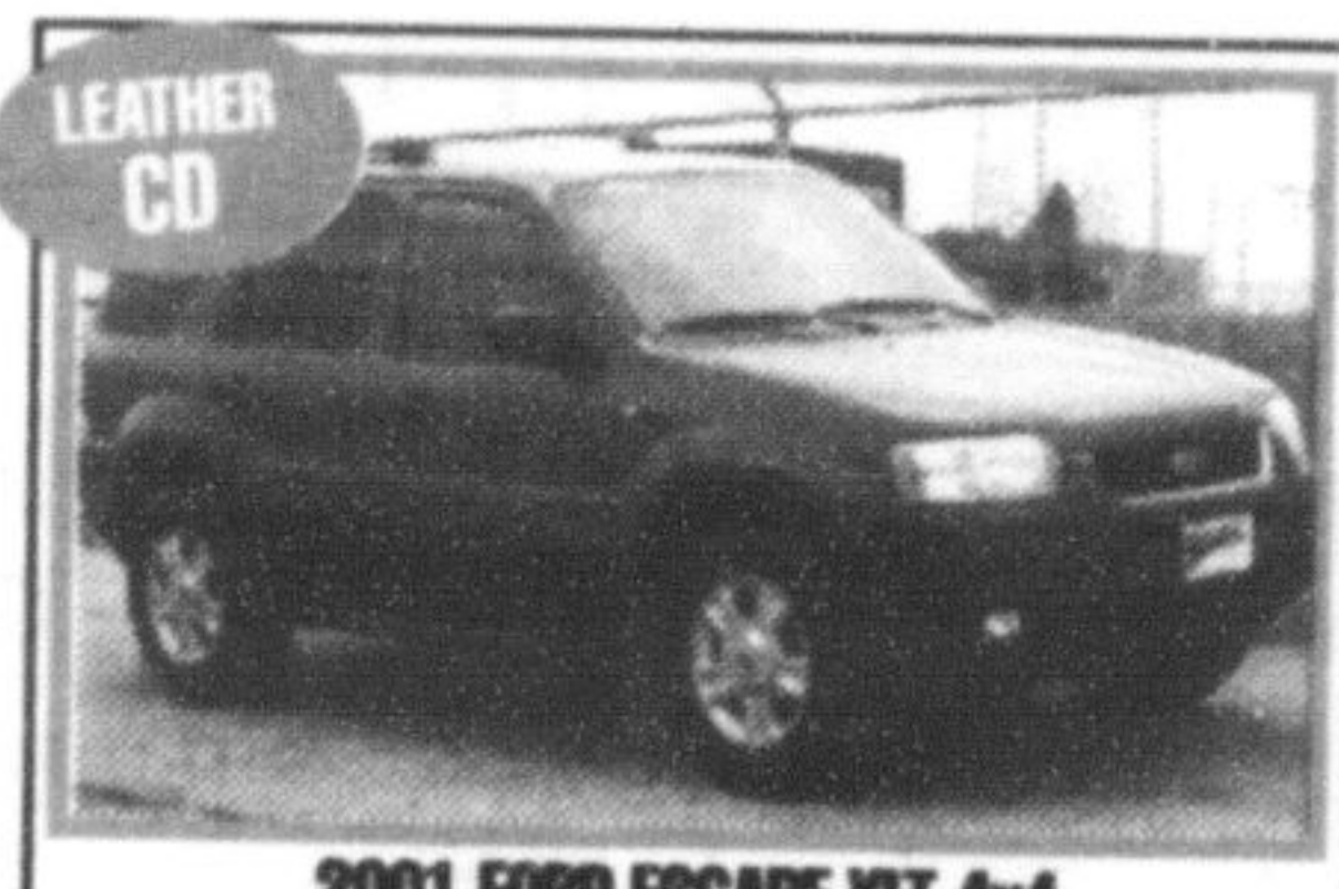
2001 FORD ESCAPE XLT 4x4 4 dr, auto, 6 cyl, red, grey two tone, grey leather, very sharp, Tubular step rails, 6 disc CD, p/seat, keyless entry & alloy wheels, loaded, 65,000kms. ONLY $18,998