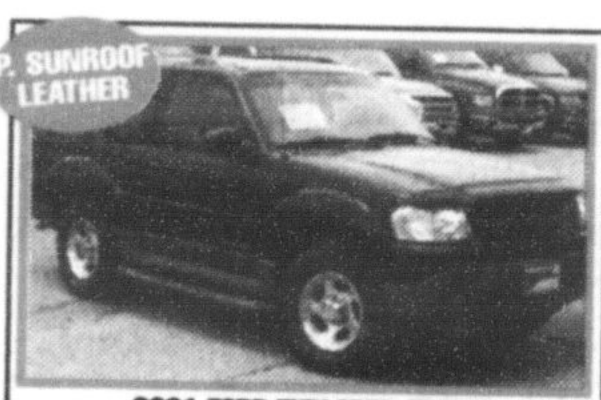
2001 FORD EXPLORER SPORT 2 dr, auto, V6, dark blue, grey leather, 4x4, in-dash 6 pk CD changer, p/seat, new tires, keyless entry, loaded, 80,900kms. ONLY $15,998