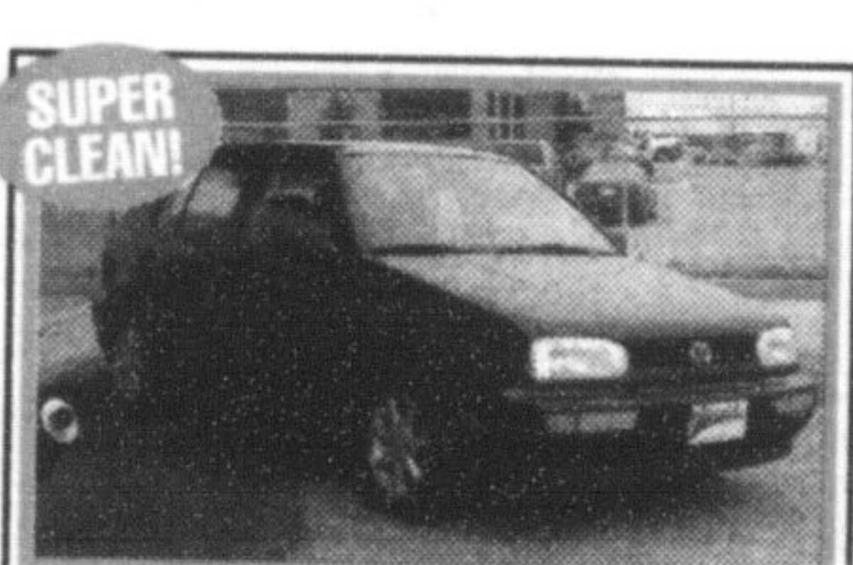
1997 VOLKSWAGON GOLF GL 4 dr, auto, diamond blk/blk velour, ps, pb, AC, alloy wheels, 84,000 kms. Don't delay! ONLY $8,998