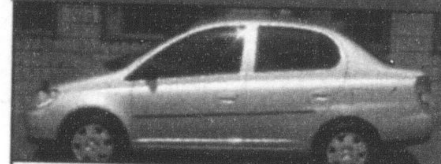
2002 Toyota Echo - 4dr - Only 57,000 km!! automatic, tilt, delay wipers. Balance of Toyota 3 yr/60,000 km total warranty & 5 yr/100,000 km powertrain warranty with Roadside Assistance. Stk#236637 $10,995