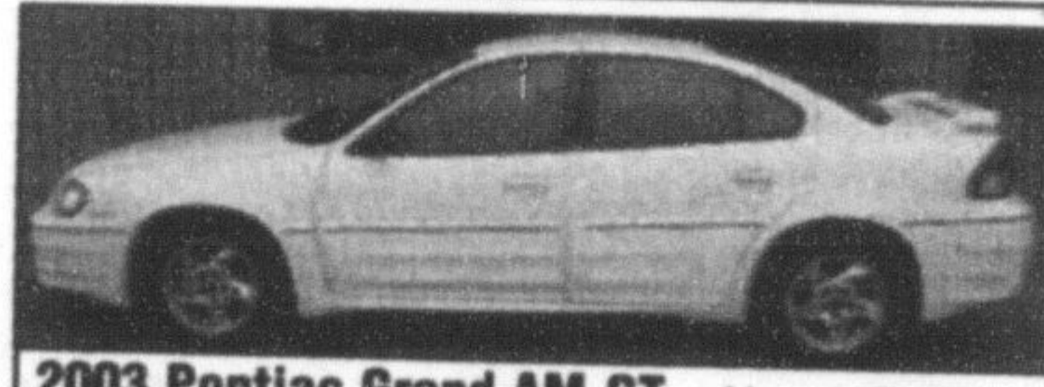
2003 Pontiac Grand AM GT - 4dr., only 35,000 km!! V6, auto, air, pw & pl & more! Balance of GM 3 yr/60,000 km total warranty with Roadside Assistance. Stk#307705 $15,995