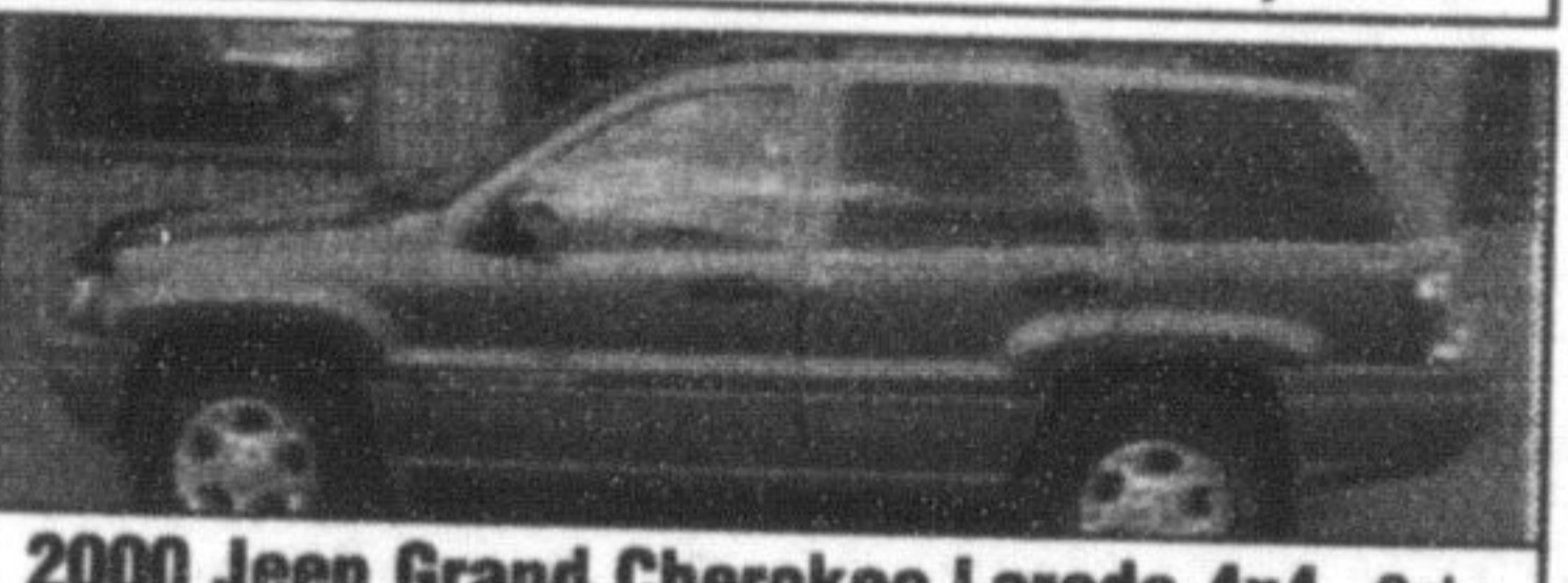
2000 Jeep Grand Cherokee Laredo 4x4 - Only 97,000 km!! absolutely showroom condition! Price includes 6 month/10,000 km powertrain warranty & 30 day 100% mechanical warranty. Stk#252182 $17,995