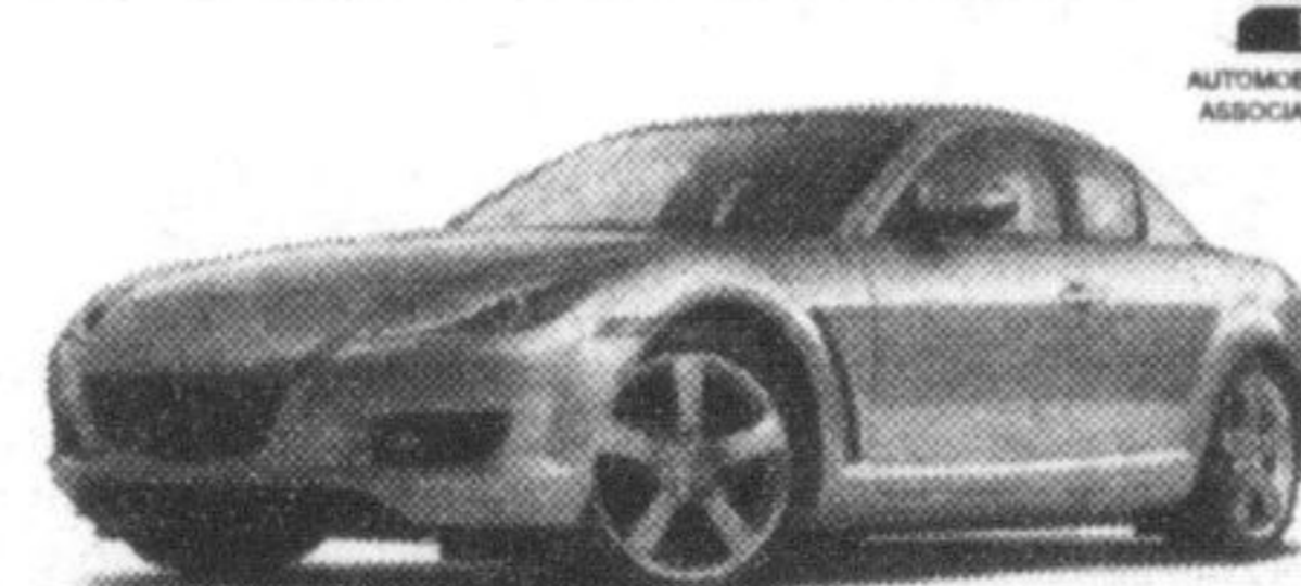
GT-I4 model shown