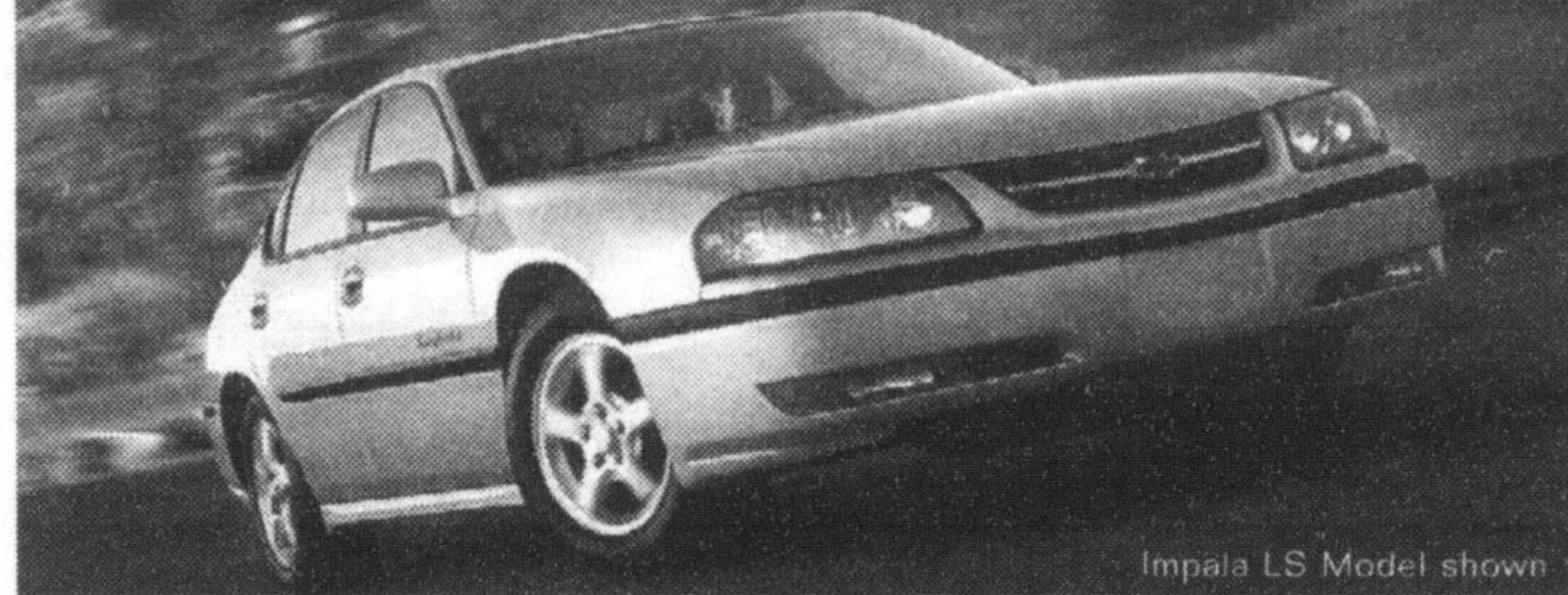
Impala LS Model shown

BUILT AT THE OSHAWA PLANT THAT RECEIVED THE GOLD PLANT QUALITY AWARD – J.D. POWER AND ASSOCIATES