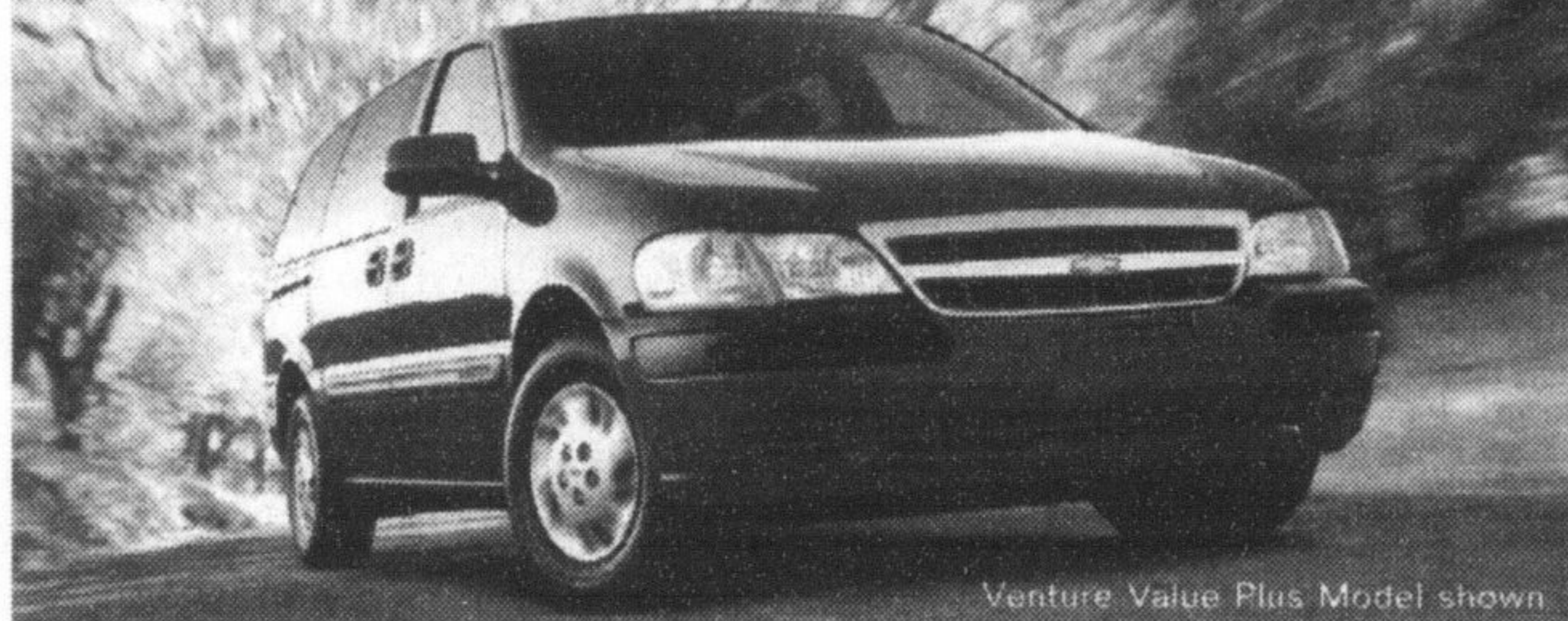
Venture Value Plus Model shown

FIVE STAR SAFETY AND THE BEST FUEL EFFICIENCY IN ITS CLASS.