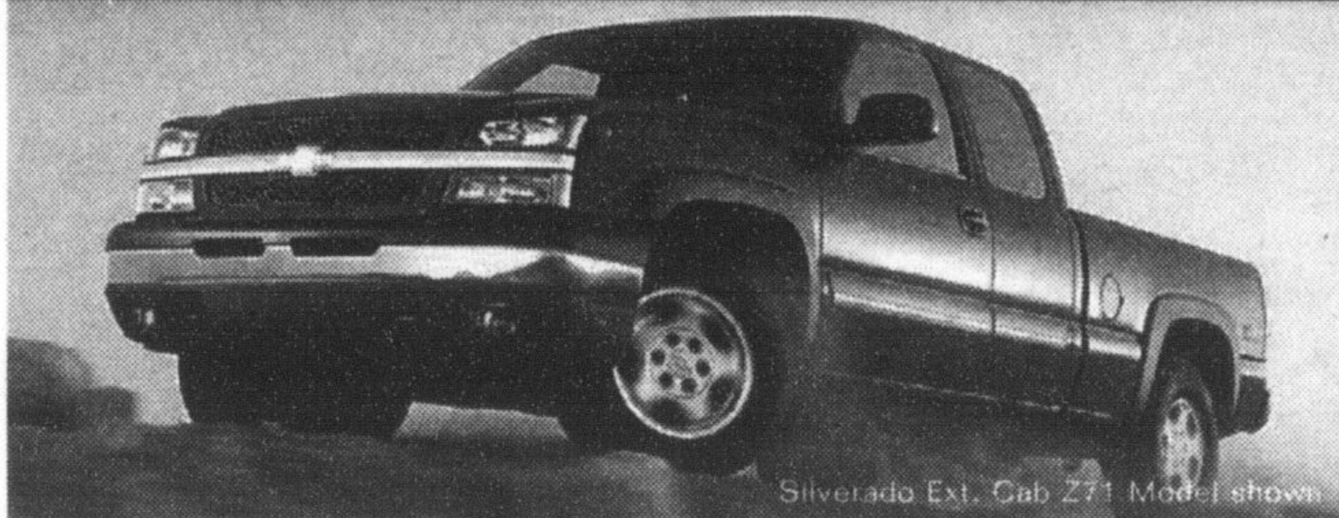
Silverado Ext. Cab Z71 Model shown

CHEVY TRUCKS. THE MOST DEPENDABLE, LONGEST LASTING TRUCKS ON THE ROAD. ‡