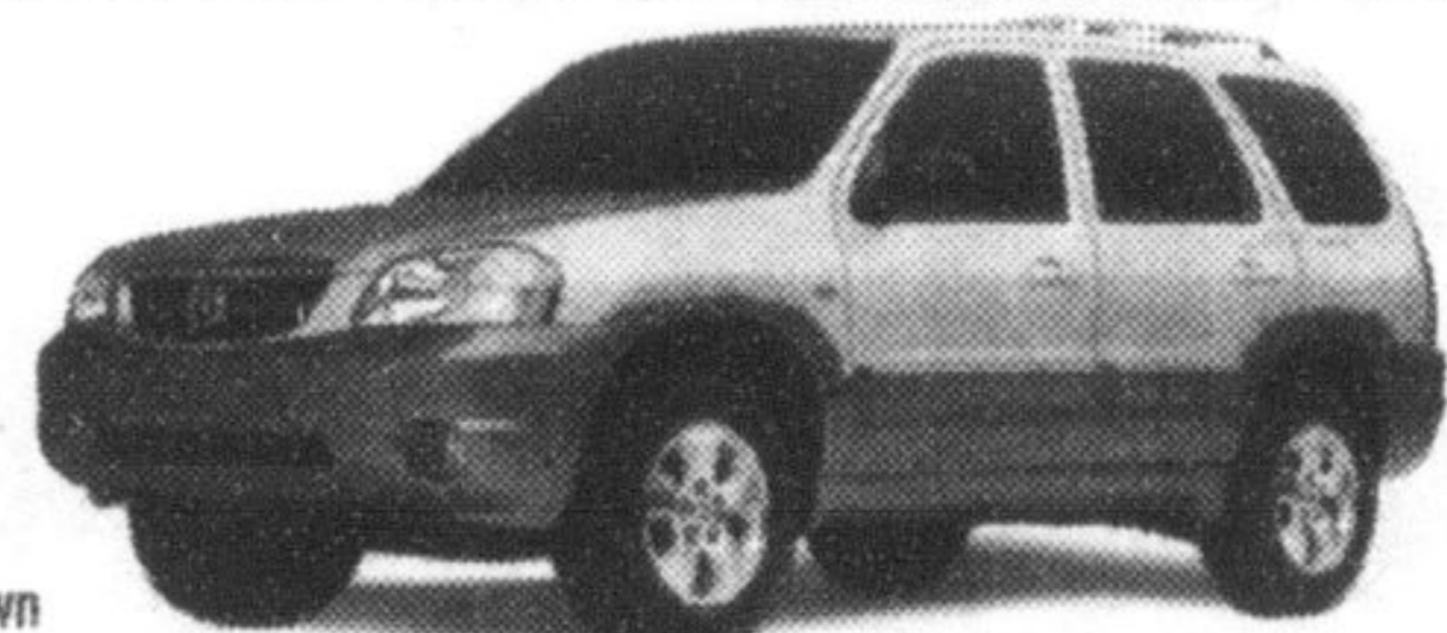
ES-V6 model shown

"... ALL THE VERSATILITY AND UTILITY DEMANDED OF AN SUV, BUT WITH THE HEART AND SOUL OF A SPORTS CAR." - National Post**