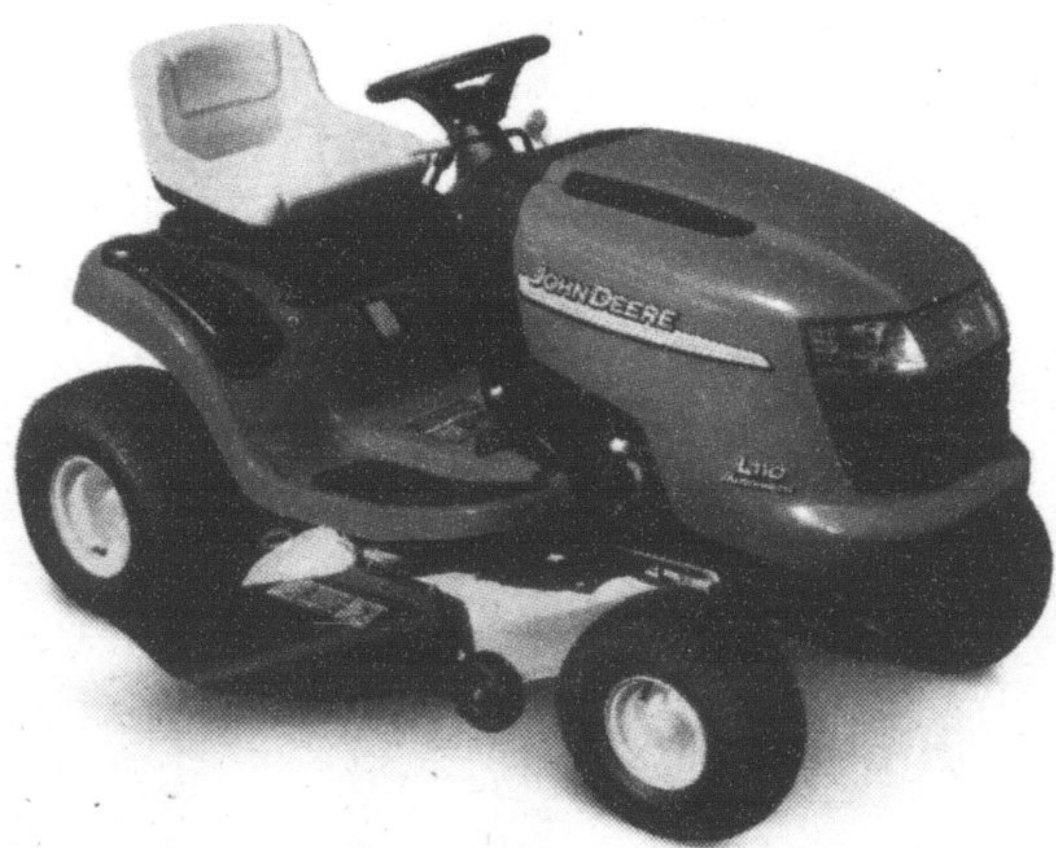
L110 Tractor Series starting from $2,149*

WE STILL ACCEPT CASH. WE JUST DON'T EXPECT IT.