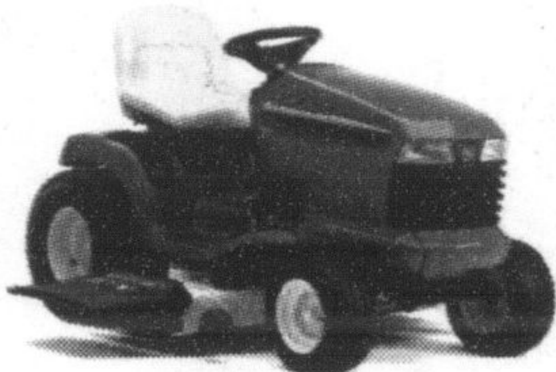
LT Tractor Series starting from $3,431*