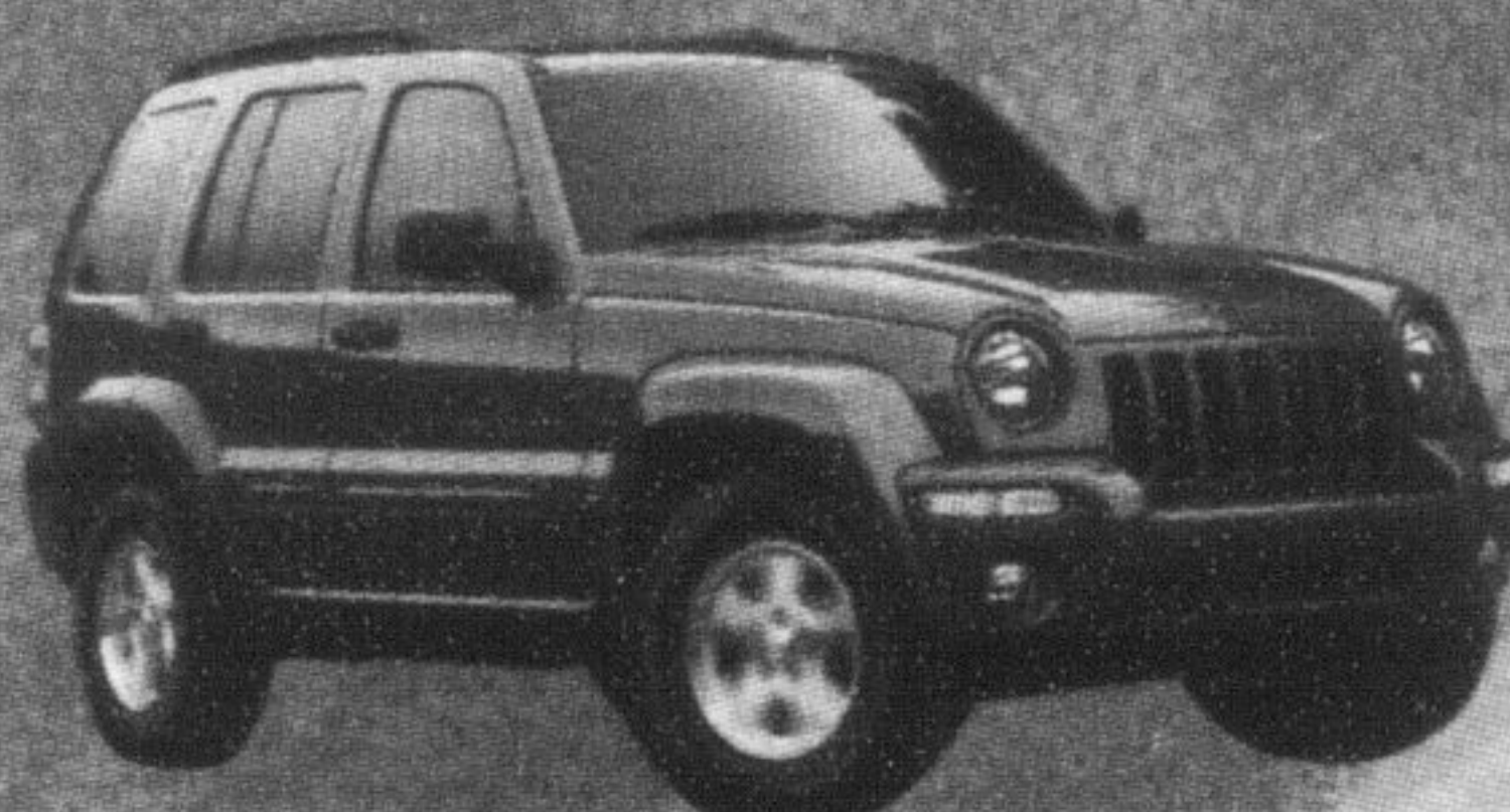
'03 Jeep Liberty