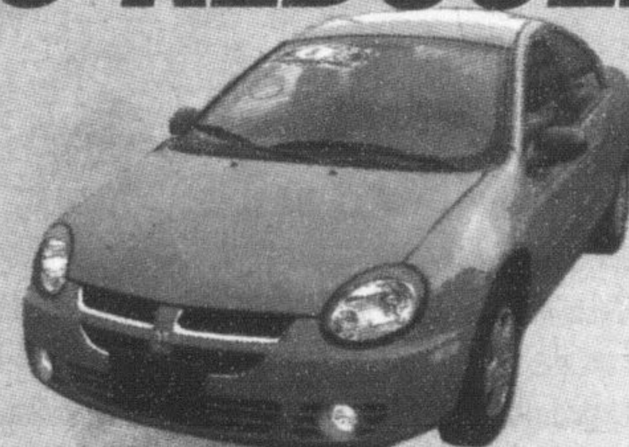
'03 Dodge SX 2.0