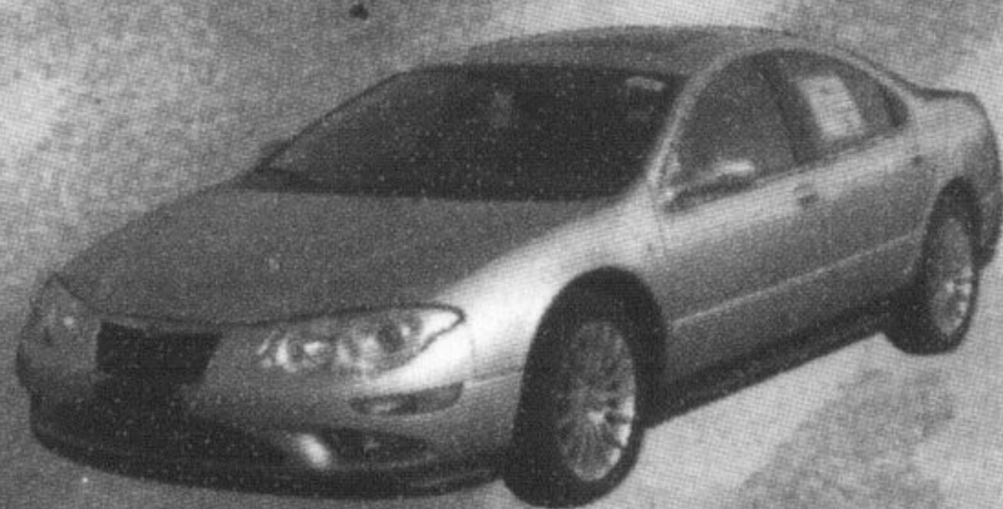
'03 Chrysler 300M