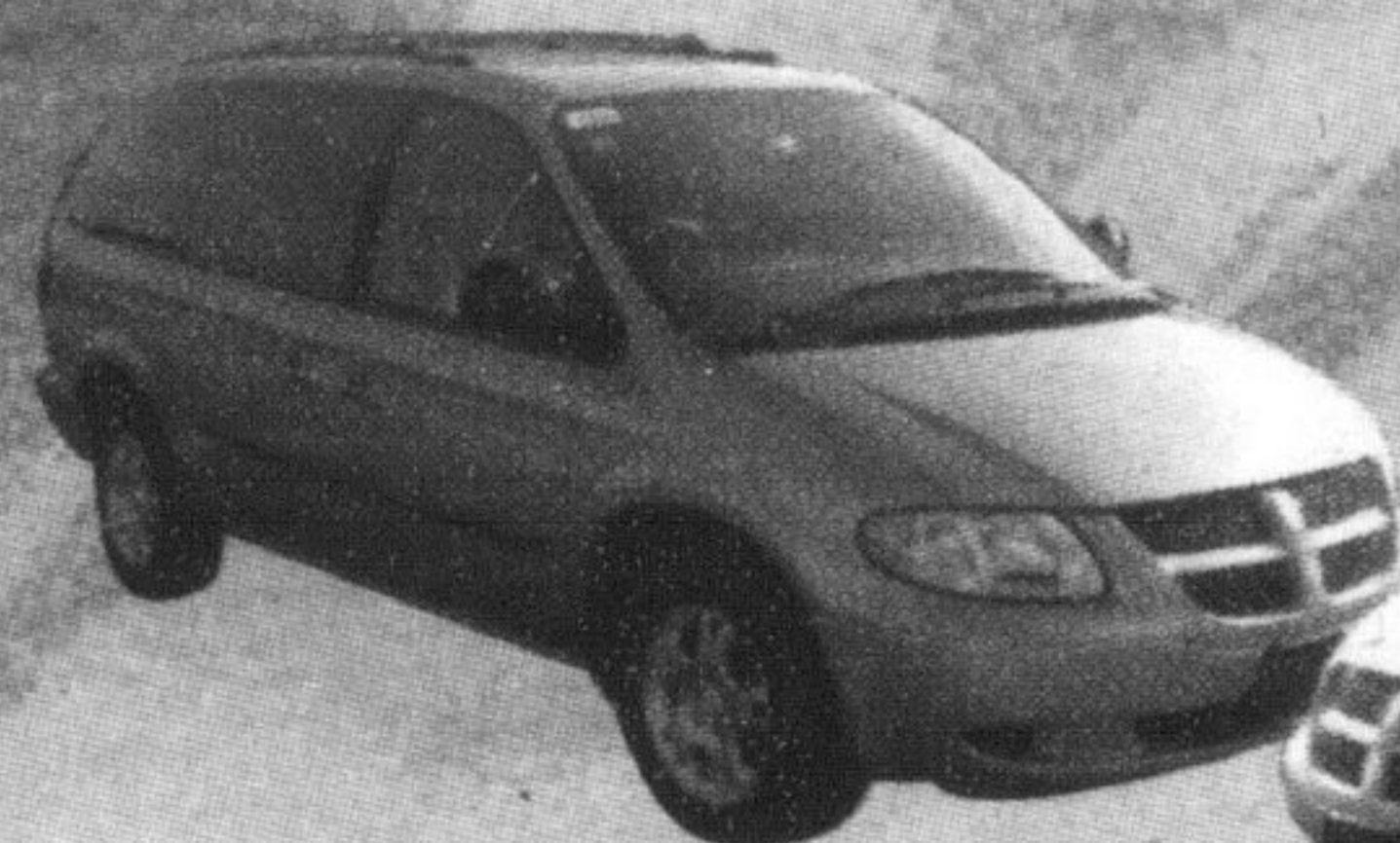
'03 & '04 Dodge Caravan's