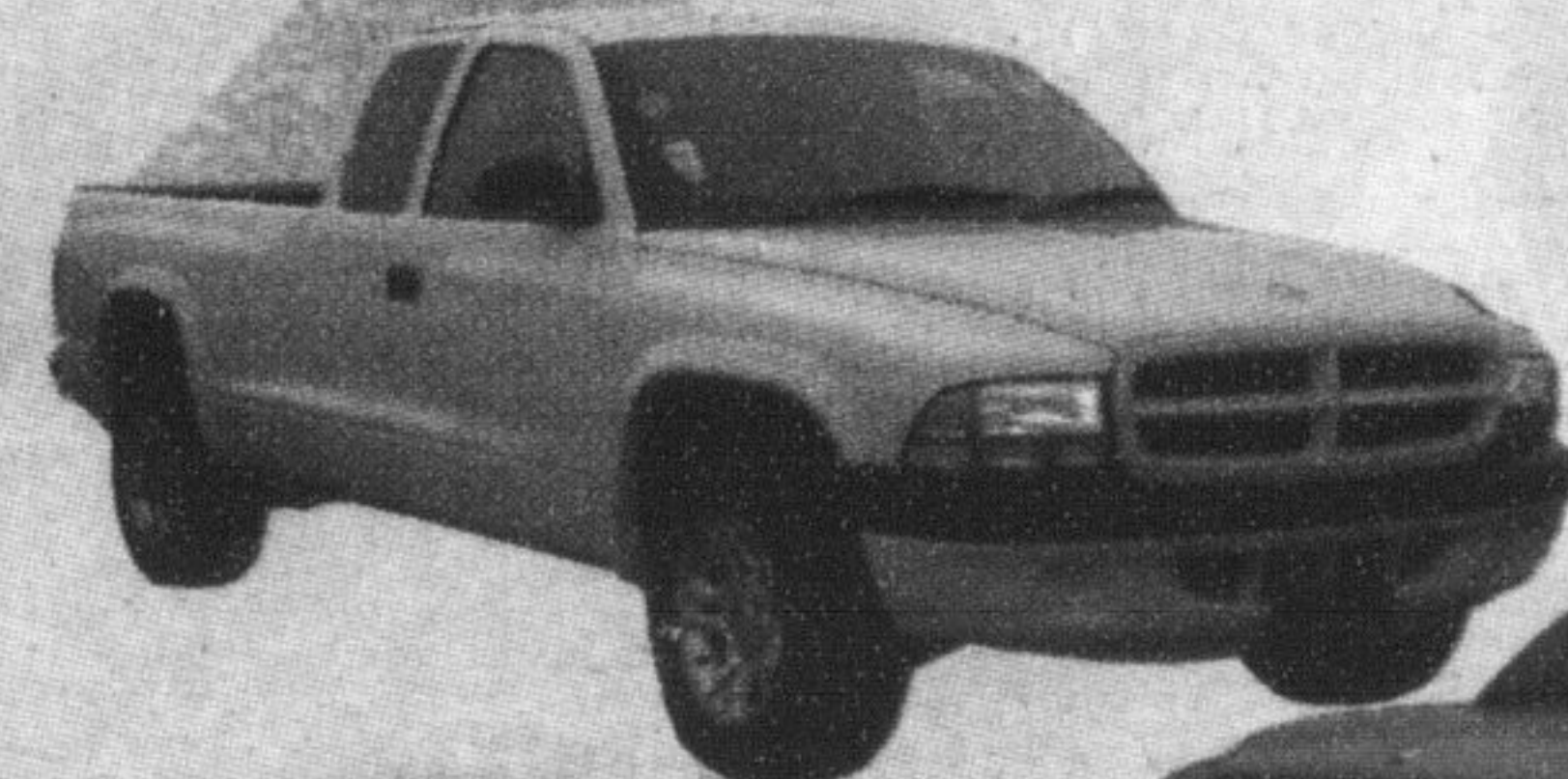
'03 & '04 Dodge Dakota's