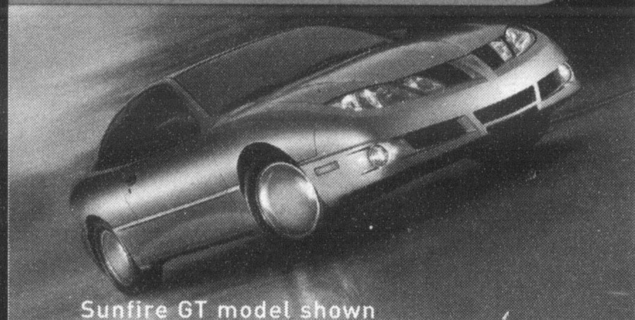
Sunfire GT model shown

More standard horsepower than the Civic, Corolla, Sentra and Focus.