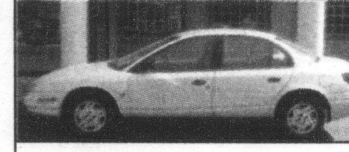
2002 Saturn SL1 (only 30,000km! Air conditioning) Now $11,495