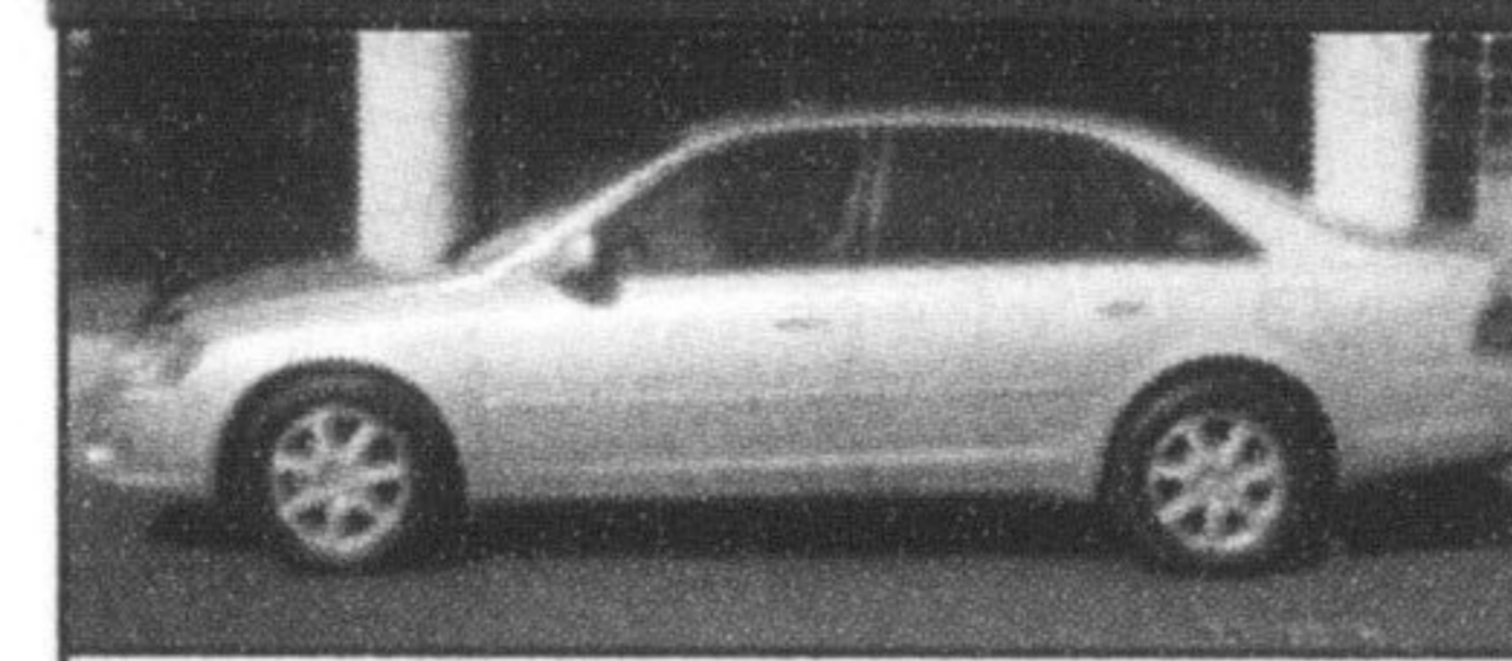
2003 Toyota Avalon XLS (only 58,000km! leather, moonroof) Now $33,995