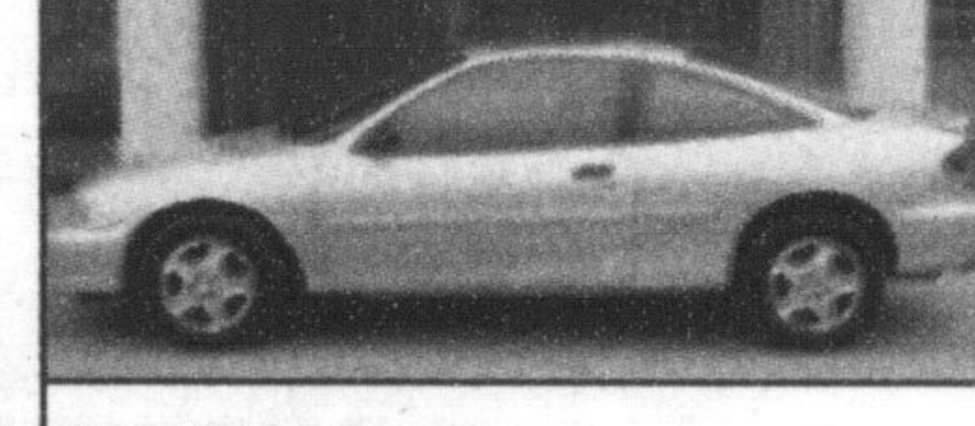
2000 Chev Cavalier (2dr, only 70,000km! Air conditioning) Now $8,995