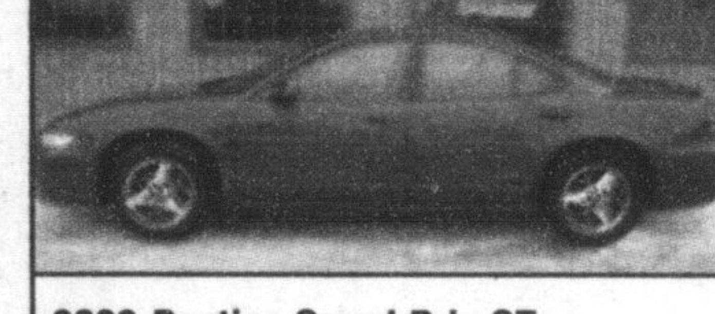
2000 Pontiac Grand Prix GT (4dr, only 65,000km! Leather HUD) Now $16,995