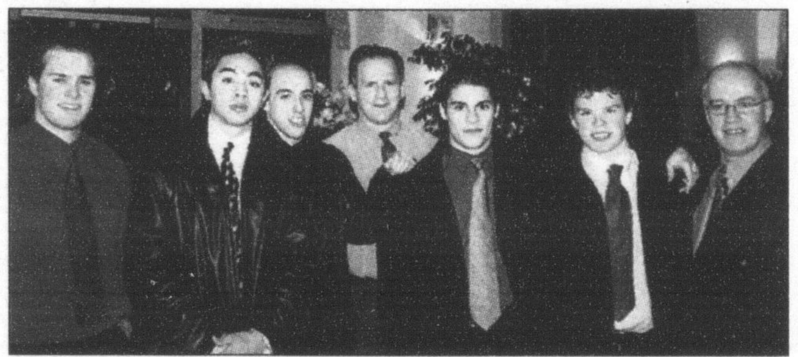
Our Platinum Sponsor Guests: Milton Ice Hawks Junior "A" Hockey Club