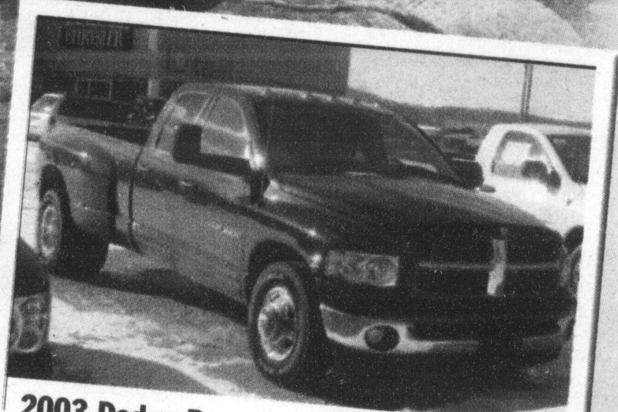
2003 Dodge Ram Quad Cab 3500 4X4 SLT Leather, trailer tow, heated seats, anti-spin axle, 5.9L HO turbo diesel, 6 speed HD Transmission, power group, patriot blue Stk# WT75