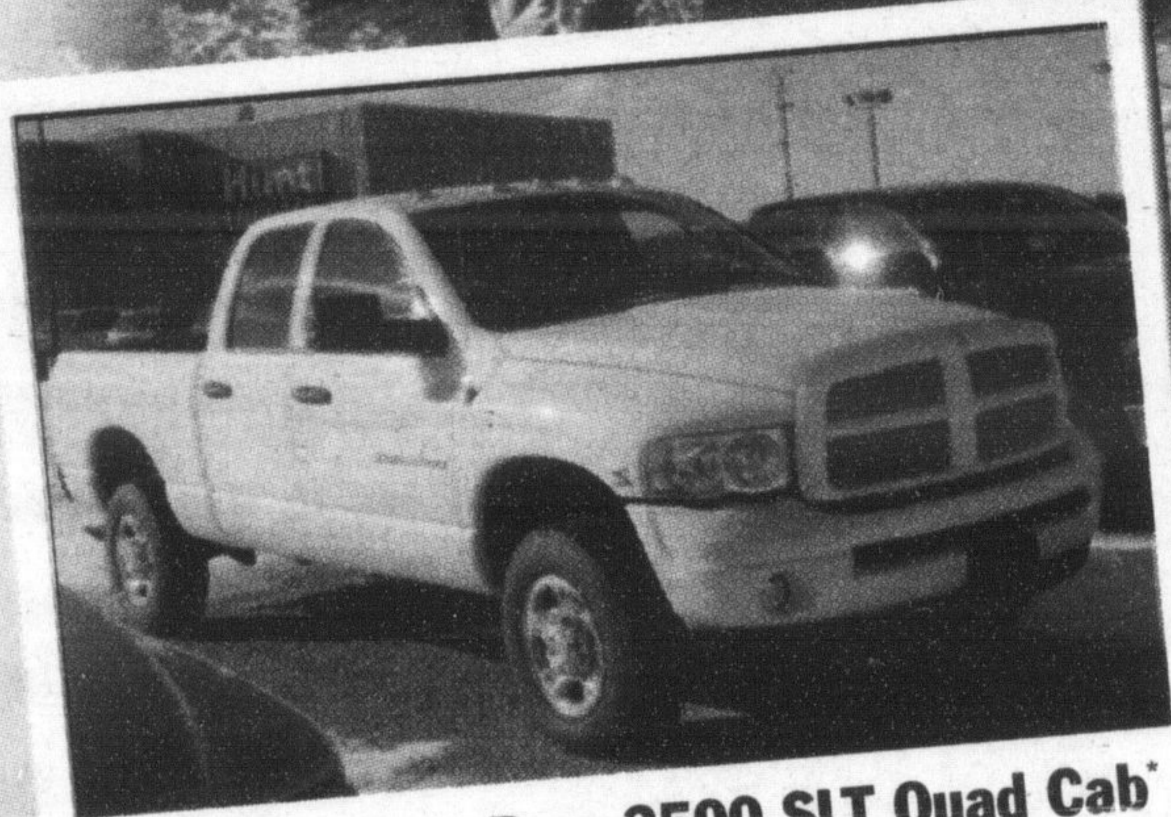
2003 Dodge Ram 3500 SLT Quad Cab* 5.9L HO Turbo Diesel, 6 speed transmission, sport appearance group, trailer tow group, box liner, 17x8 chrome clad wheels, leather seats, bright white. Stk# WT41