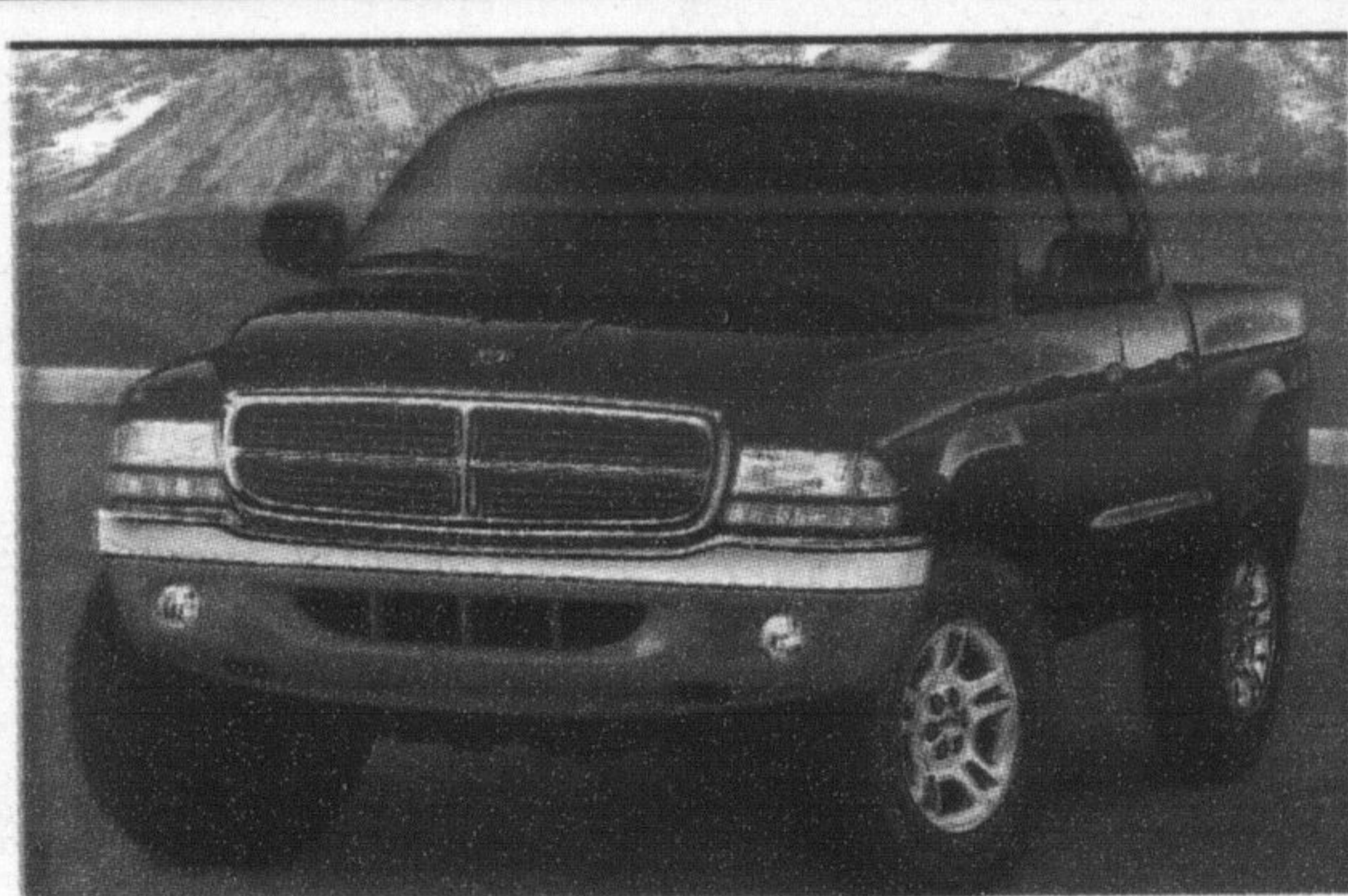
2003/2004 Dodge Dakota 15 TO CHOOSE FROM!