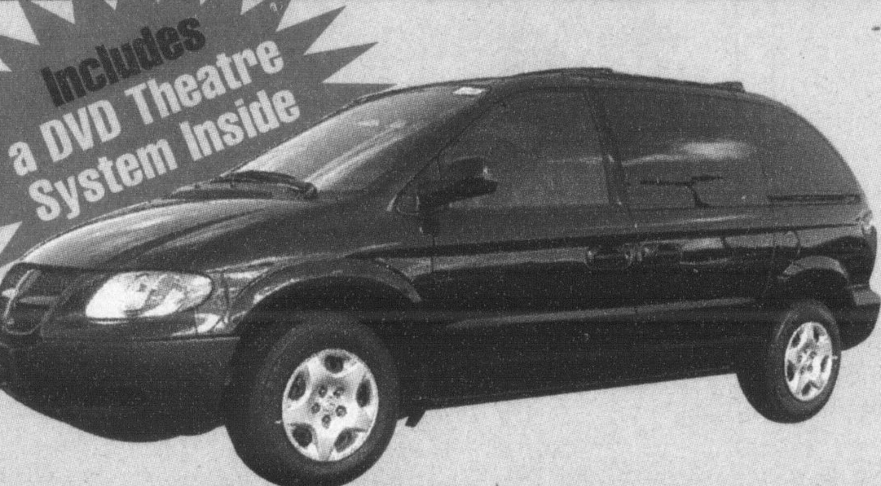
INC. 28C Pkg, 180 3.3L V6, auto, O/D, A/C, AM/FM/CD, DVD with 7" screen, 7 pass., tilt, cruise, dual sliding doors, roof rack, sunscreen glass, pwr. windows, door locks & mirrors & much more. Stk 588003