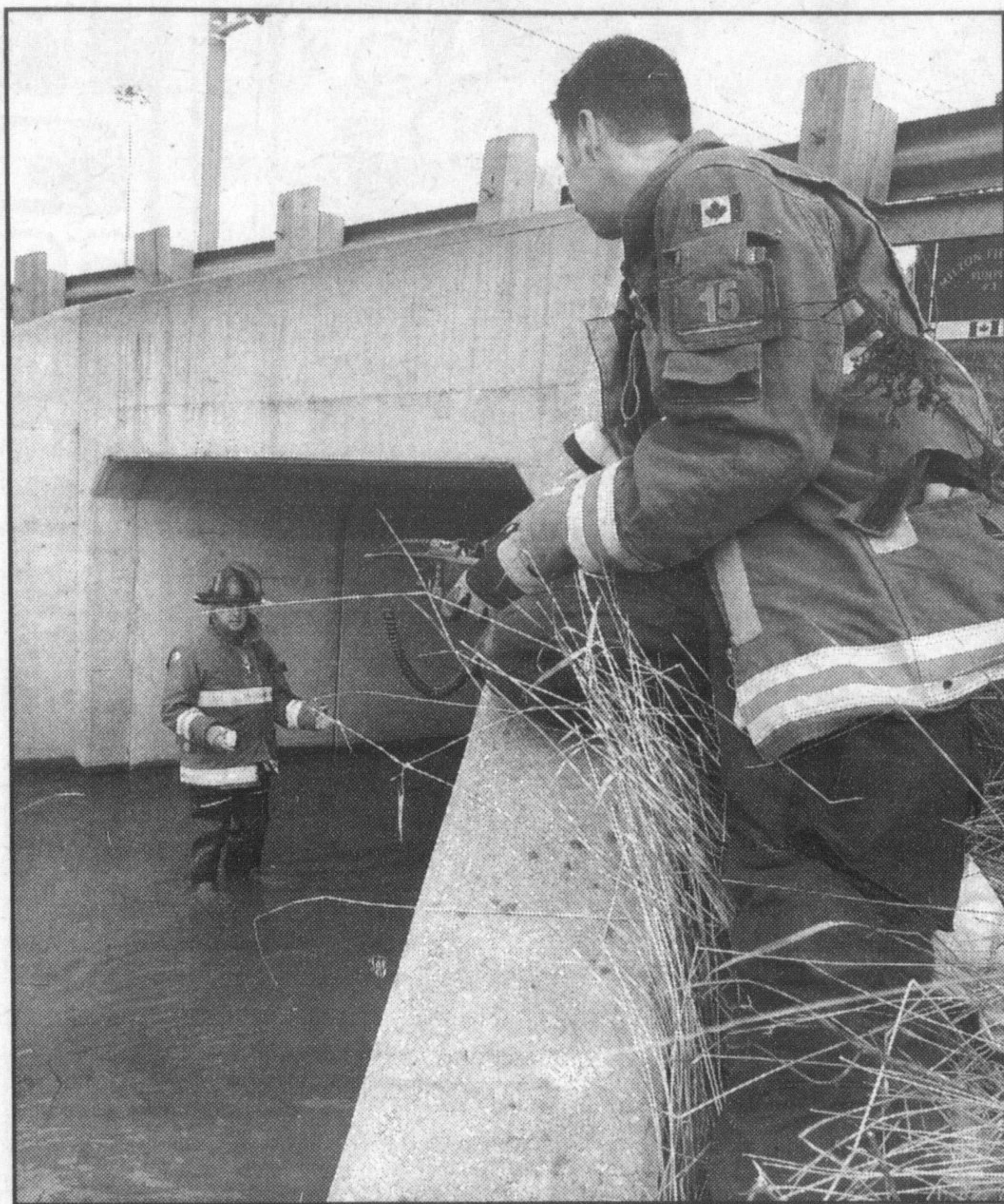
Milton firefighters search the stream at Martin Street and Chisholm Drive for the source of Wednesday's fuel leak.