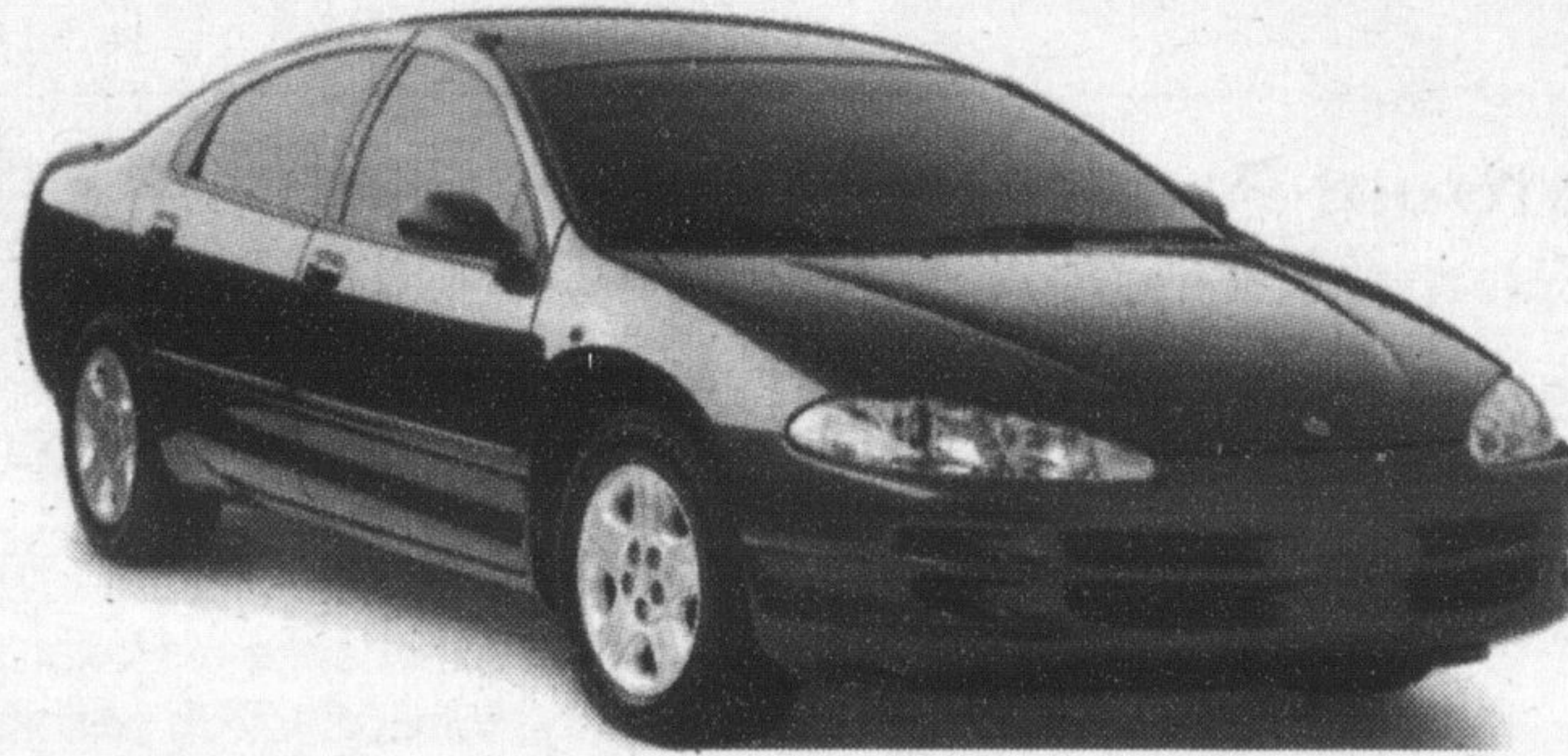
2004 chrysler intrepid

Cash purchase for $21,688 † or lease for $238 †† a month for 54 MONTHS with $4,698 down payment or equivalent trade. NO SECURITY DEPOSIT