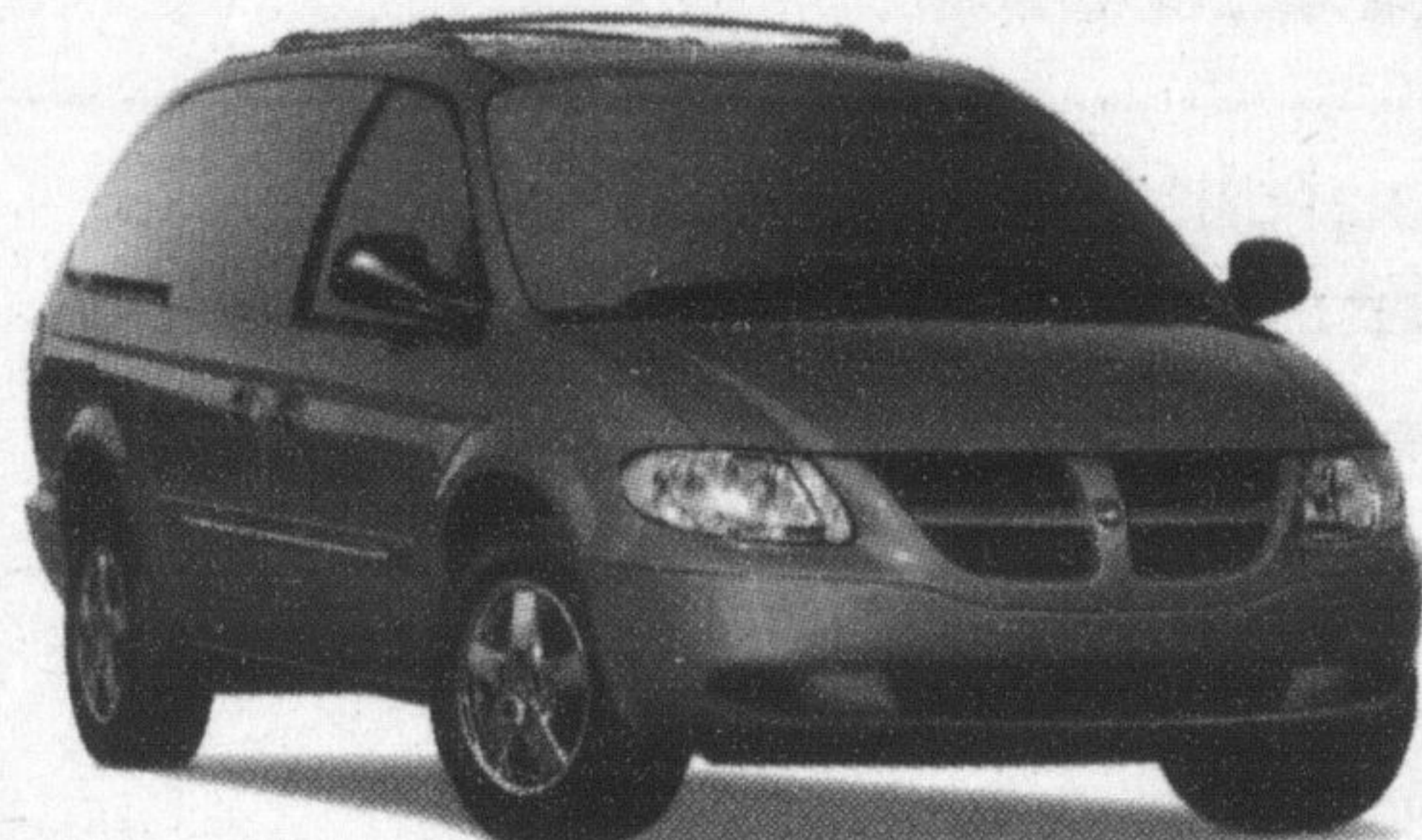
2004 dodge caravan | Anniversary Edition

Cash purchase for $22,588 † or lease for $268 †† a month for 54 MONTHS with $4,460 down payment or equivalent trade. NO SECURITY DEPOSIT