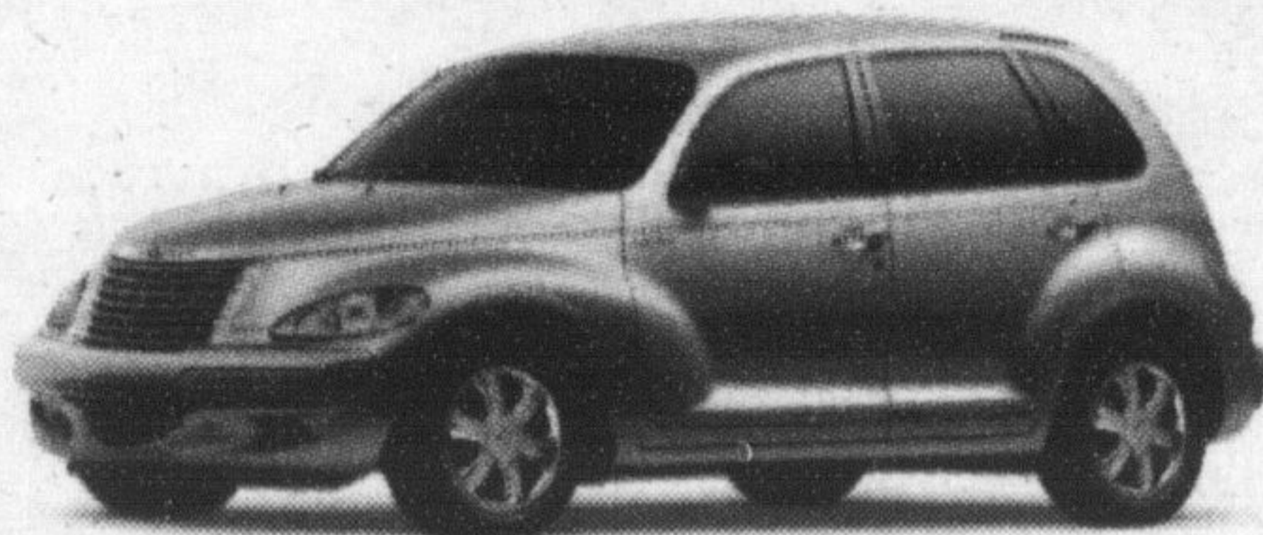
2003 chrysler pt cruiser touring edition