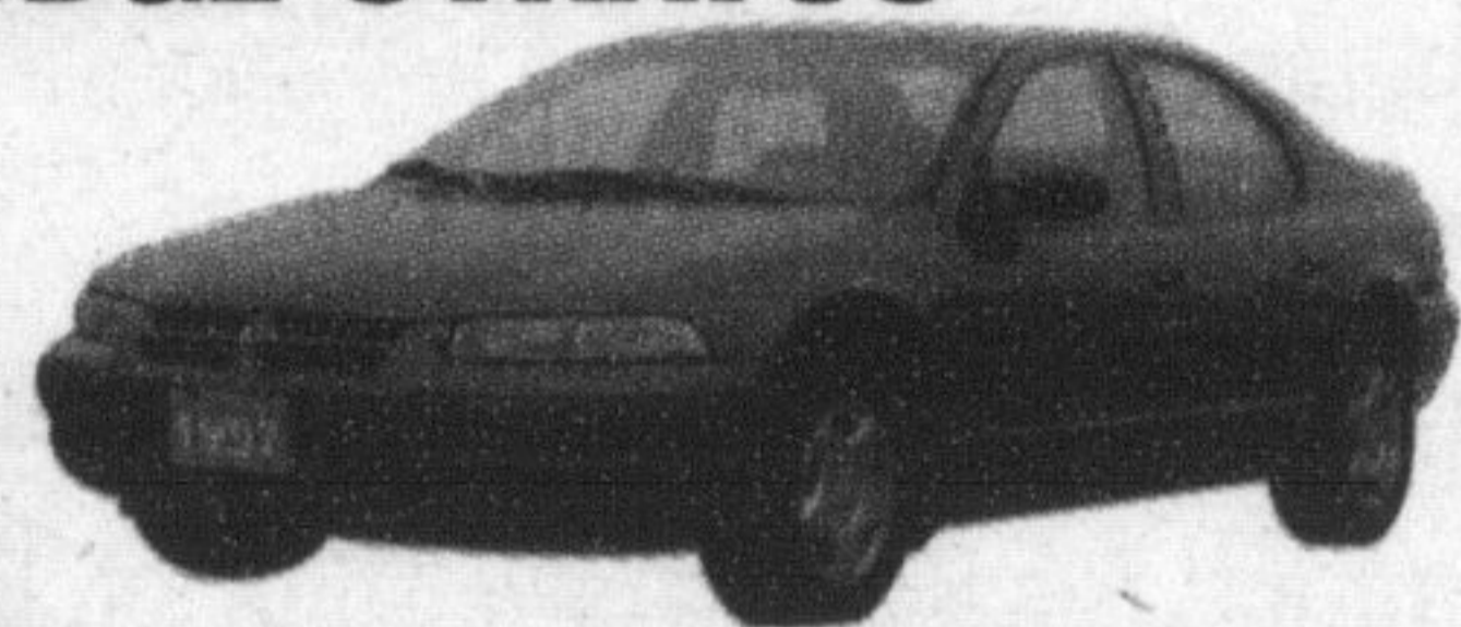
Auto, air, tilt, cruise, only 97,000km Stk#XE44-1