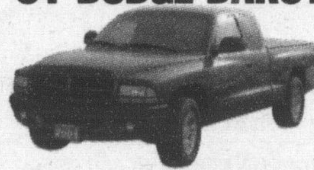
V6, auto, wheel pkg, p.group, must be seen. Stk# VG11-1