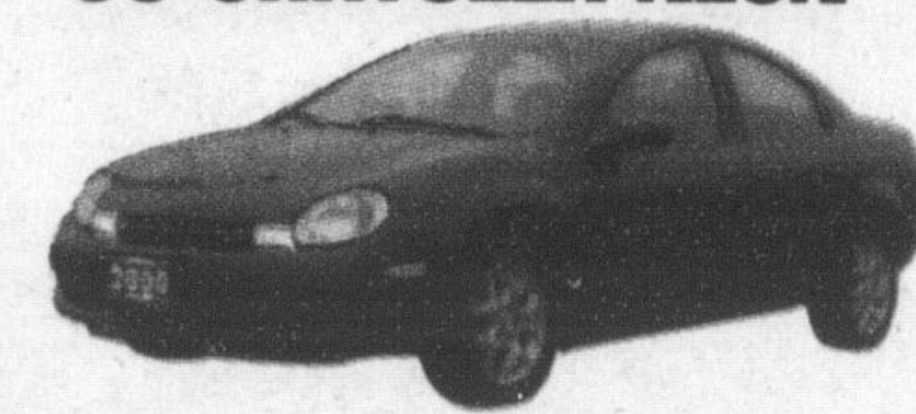
Auto, air, tilt, cruise, Stk#P2776