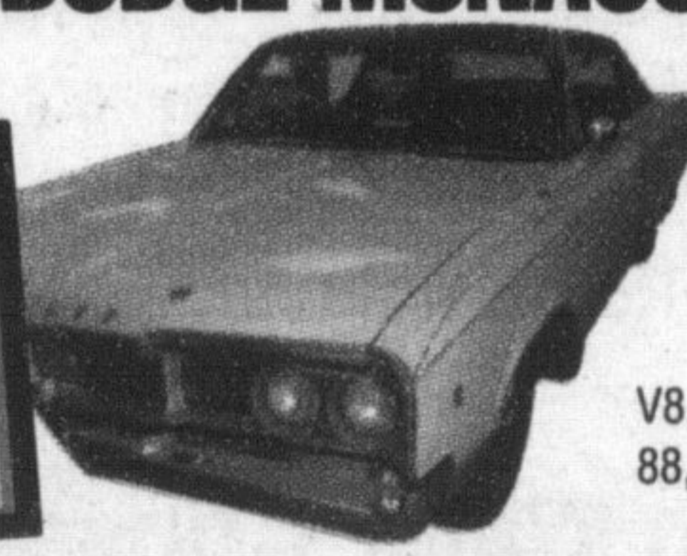
V8, auto, only 88,000 miles