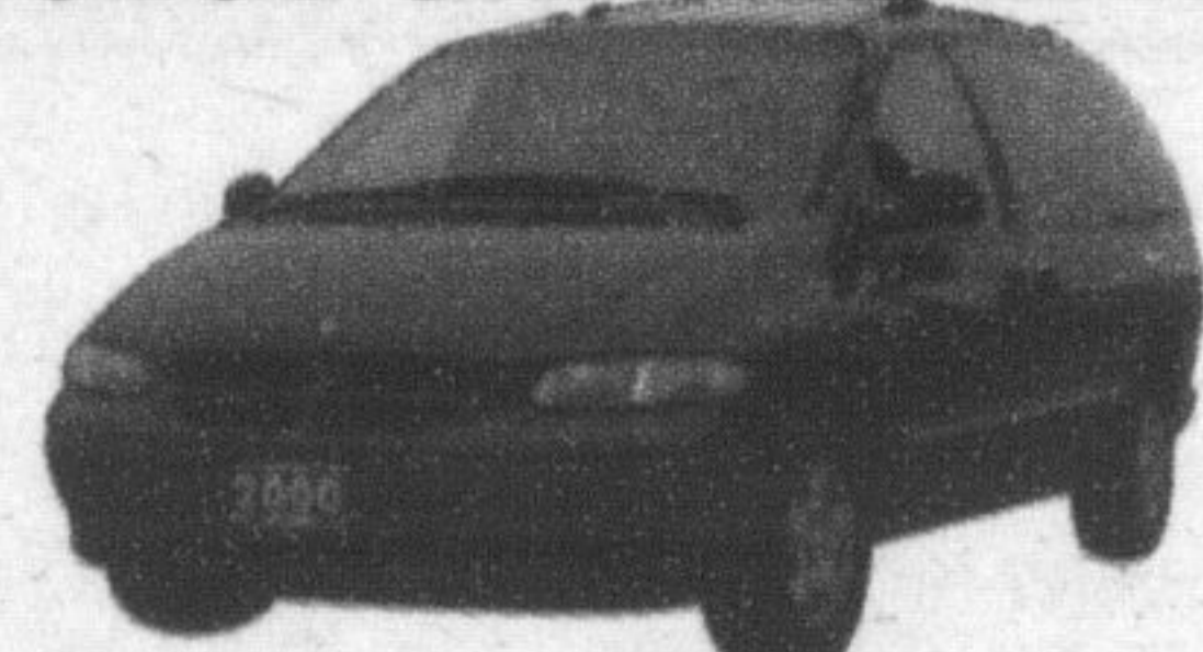
V6, pw, pl, pm, cruise, tilt, air, cass.. 68,000 km Stk#P2706