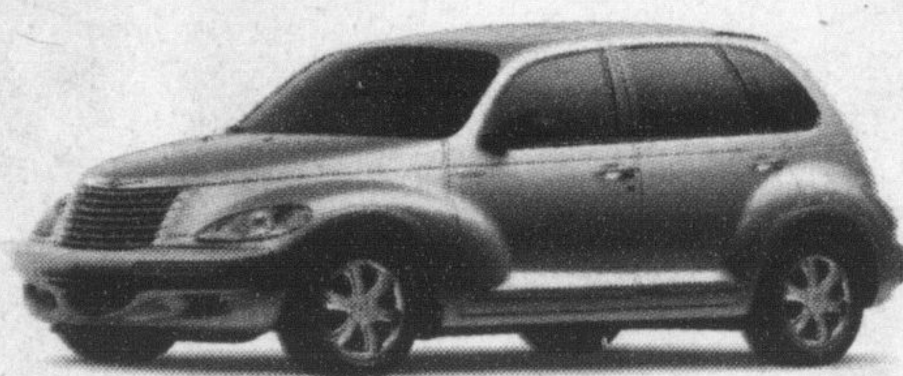
2003 Chrysler PT Cruiser Touring Edition

Cash purchase for $20,988* or lease for $248** a month for 54 MONTHS with $3,457 down payment or equivalent trade. NO SECURITY DEPOSIT