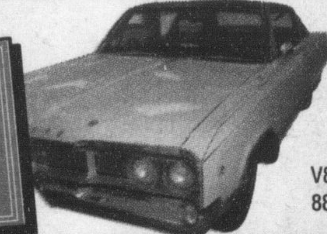
V8, auto, only 88,000 miles

NO PAYMENTS FOR 90 DAYS '01 DODGE NEON LX