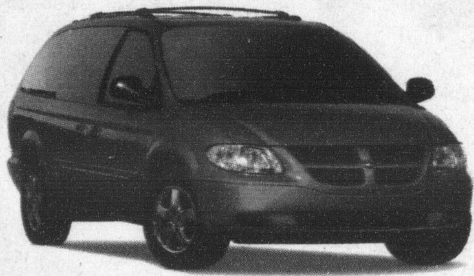
2004 Dodge Caravan | Anniversary Edition

Cash purchase for $22,588* or lease for $268** a month for 54 MONTHS with $4,460 down payment or equivalent trade. NO SECURITY DEPOSIT