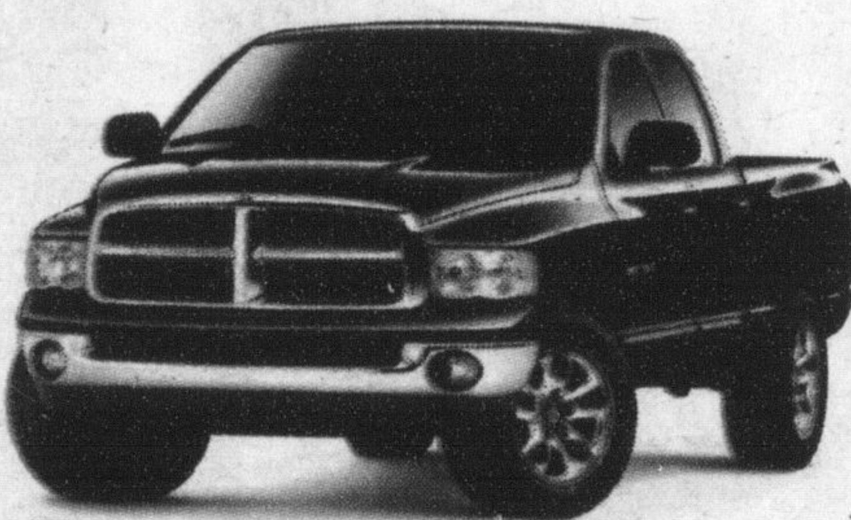
2004 Dodge Ram 1500