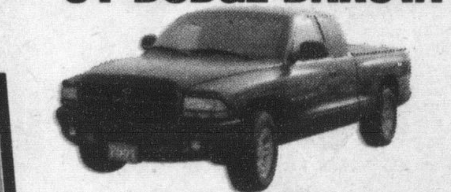
V6, auto, wheel pkg, p.group, must be seen. Stk# VG11-1

NO PAYMENTS FOR 90 DAYS '00 CHRYSLER NEON