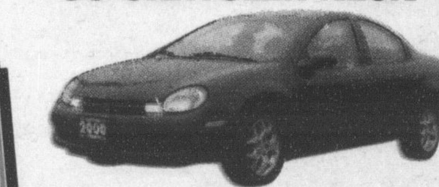
Auto, air, tilt, cruise, Stk#P2776