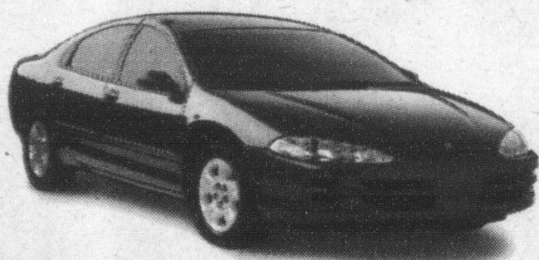
2004 Chrysler Intrepid

Cash purchase for $21,688* or lease for $238** a month for 54 MONTHS with $4,898 down payment or equivalent trade. NO SECURITY DEPOSIT