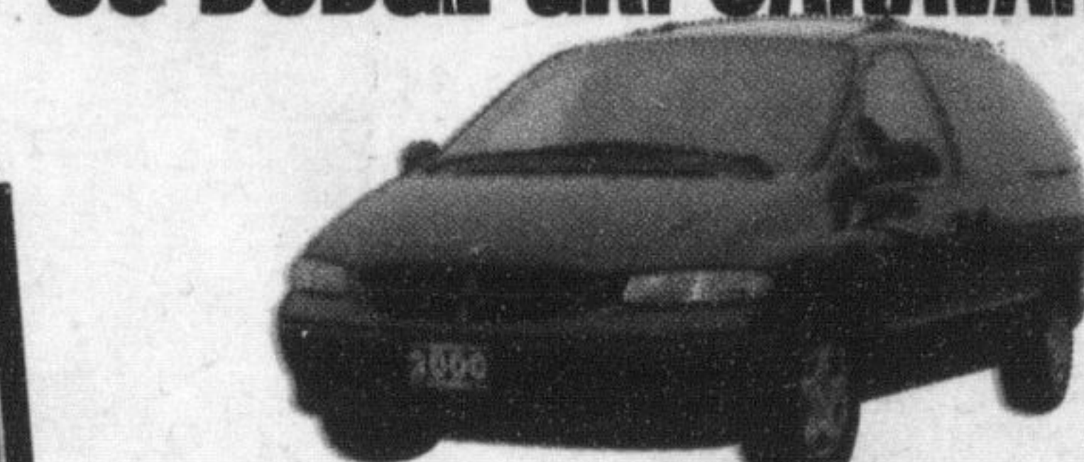
V6, pw, pl, pm, cruise, tilt, air, cass.. 68,000 km Stk#P2706

NO PAYMENTS FOR 90 DAYS '01 DODGE DAKOTA