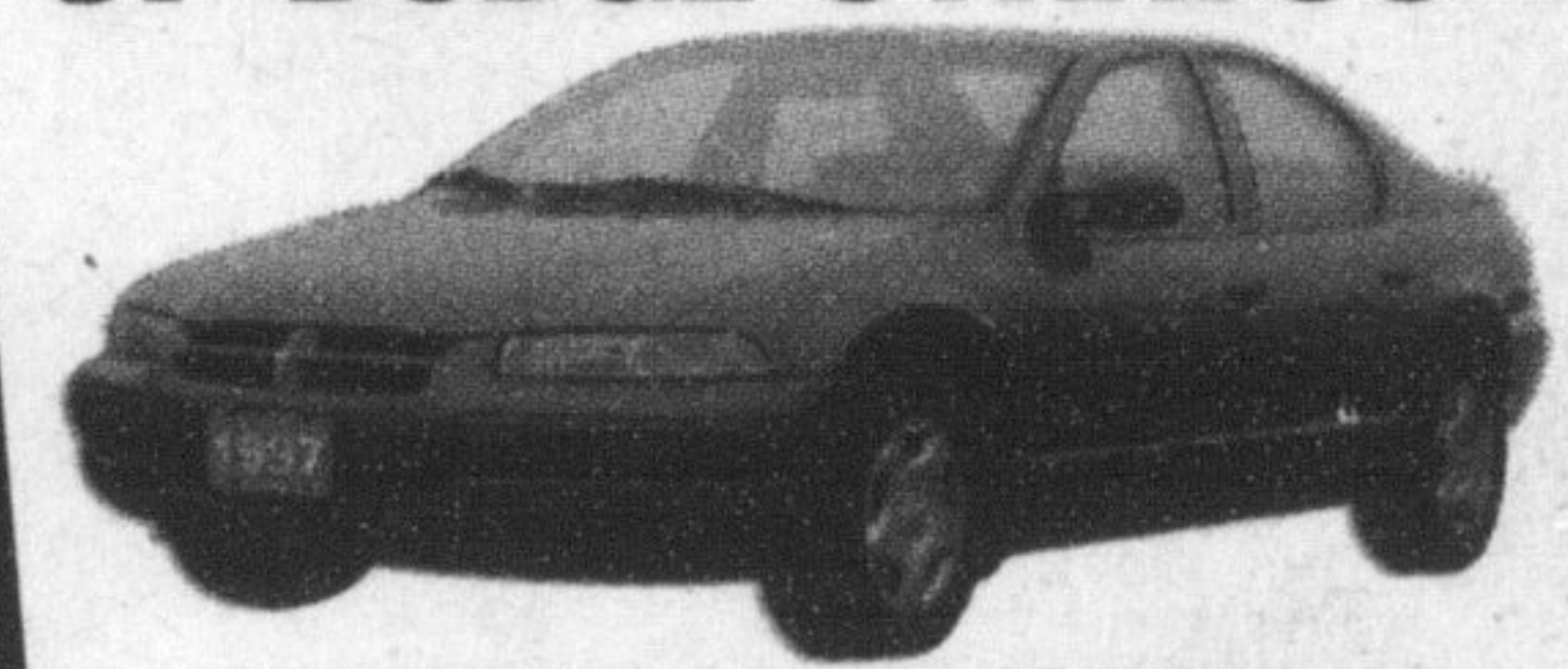
Auto, air, tilt, cruise, only 97,000km Stk#XE44-1