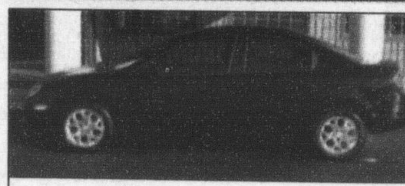
2000 Chrysler Neon LE NOW $6,995