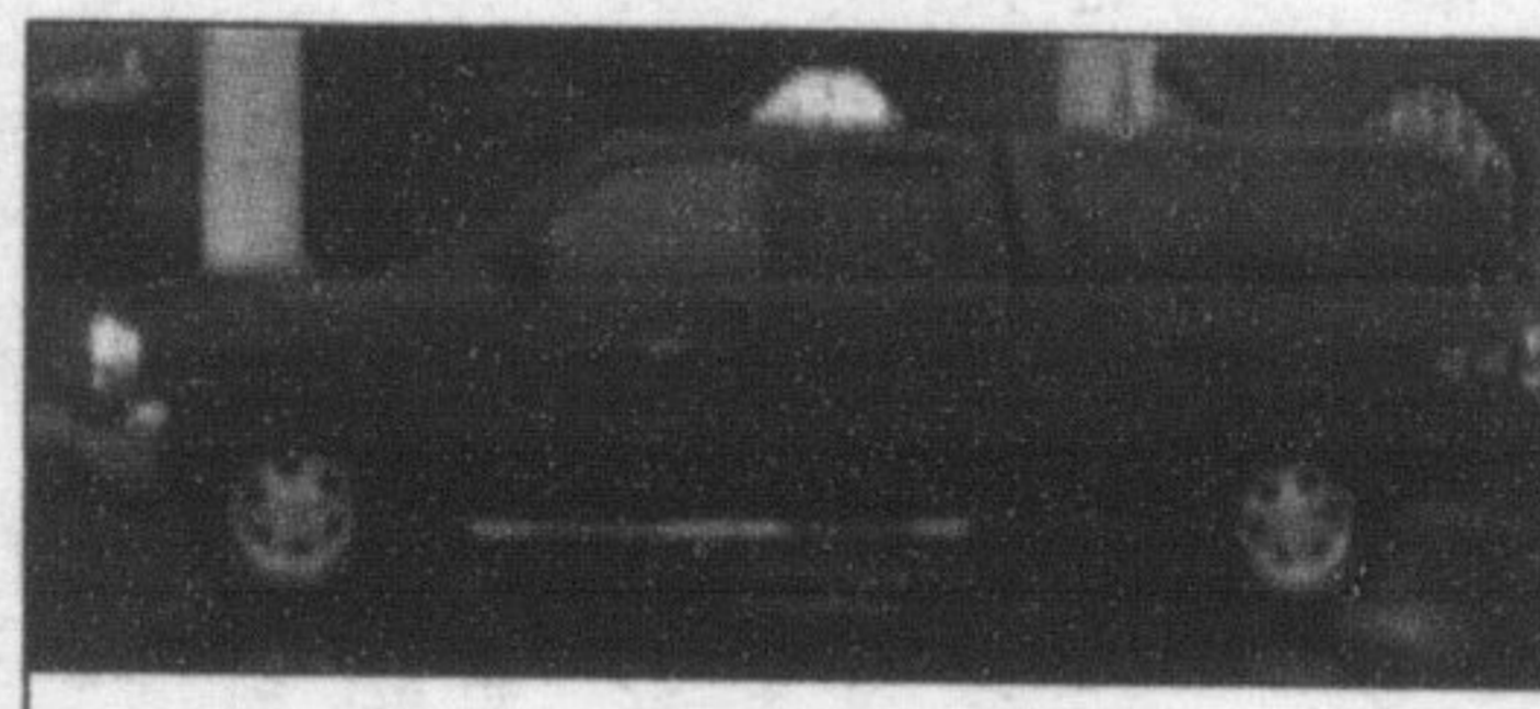
2002 GMC Sierra X-Cab 4X4 Stopside NOW $27,995