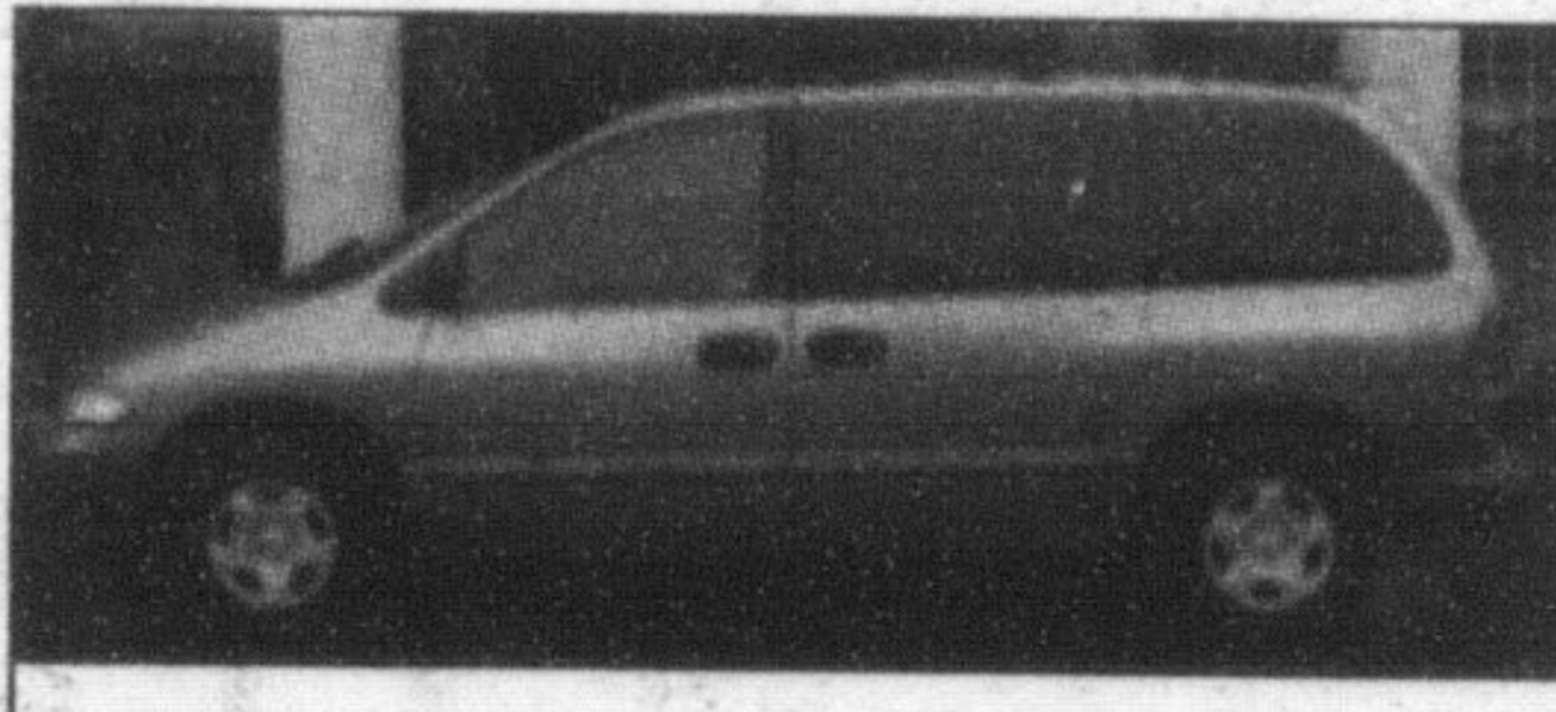
2000 Dodge Caravan NOW $10,995