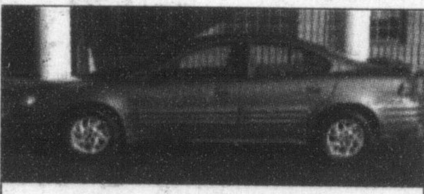
2002 Pontiac Grand AM SE NOW $12,698

We're one of Southern Ontario's largest used car dealerships!