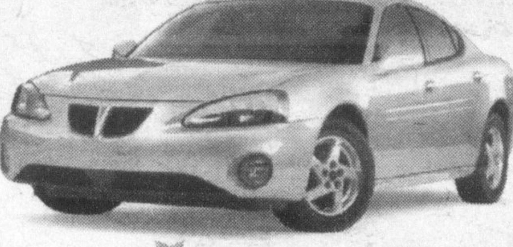
2004 Pontiac Grand Prix