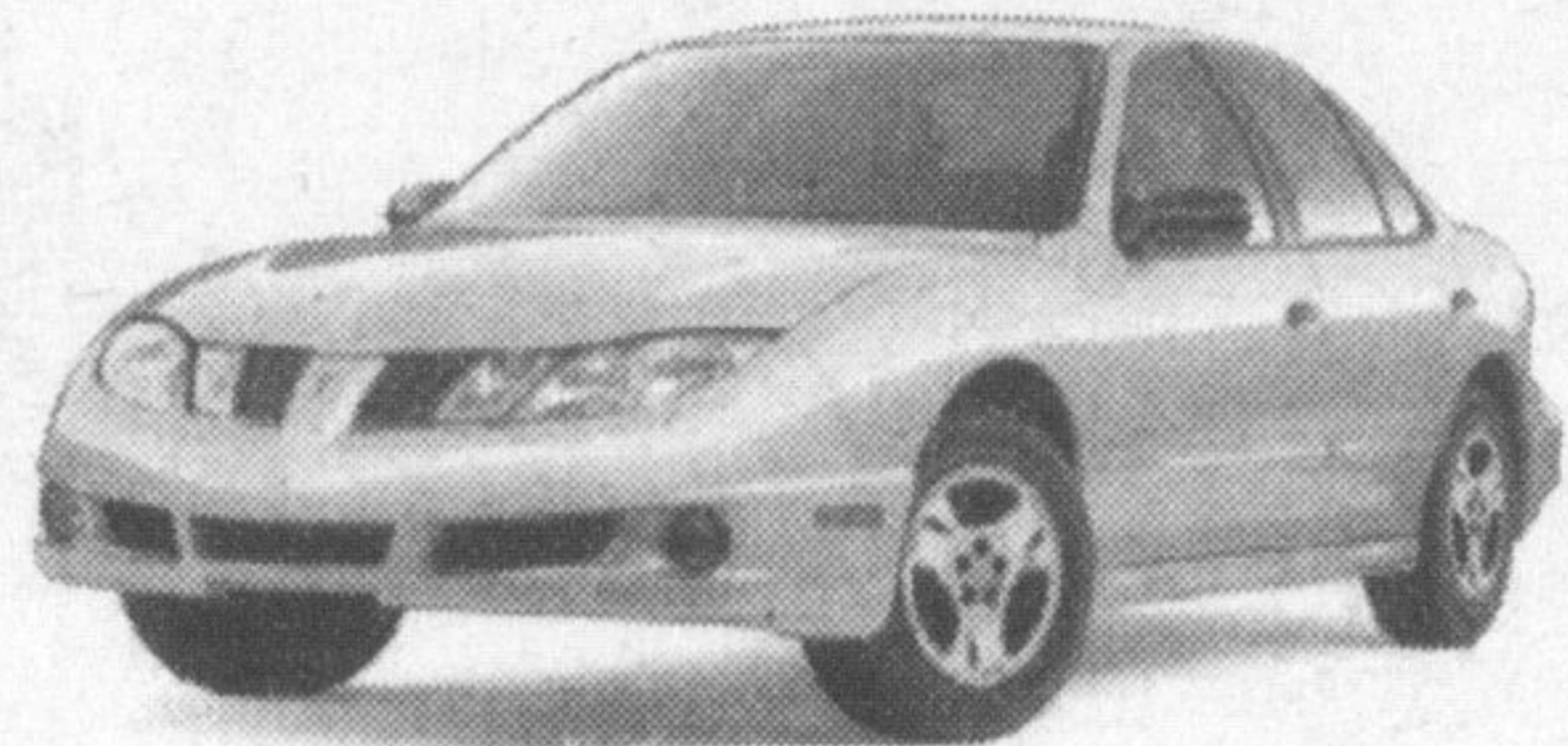
2004 Pontiac Sunfire