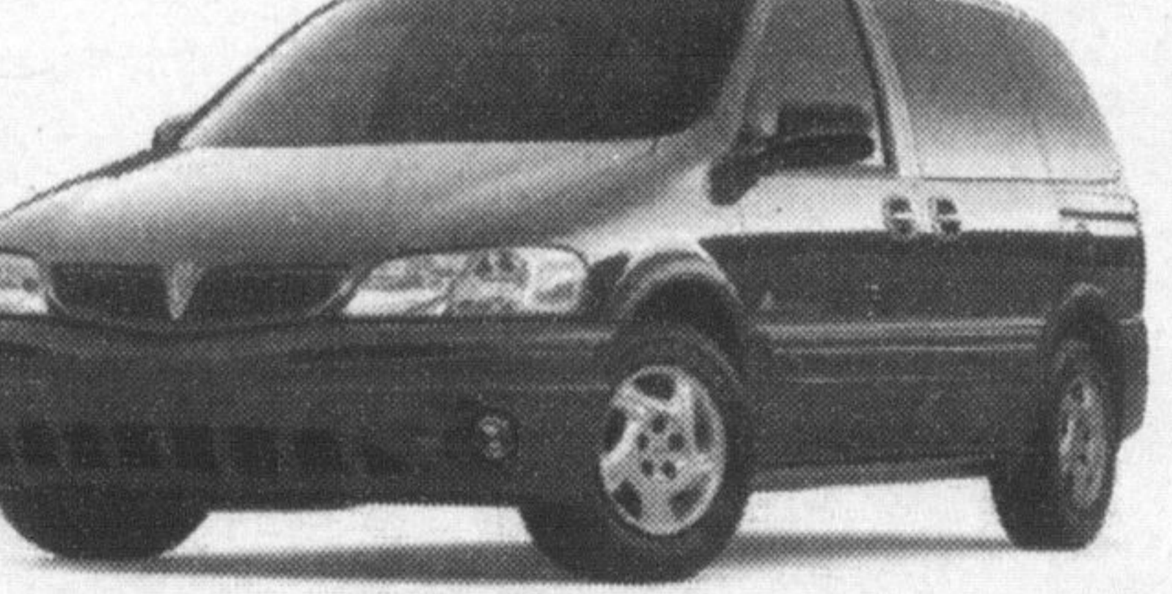
2004 Pontiac Montana