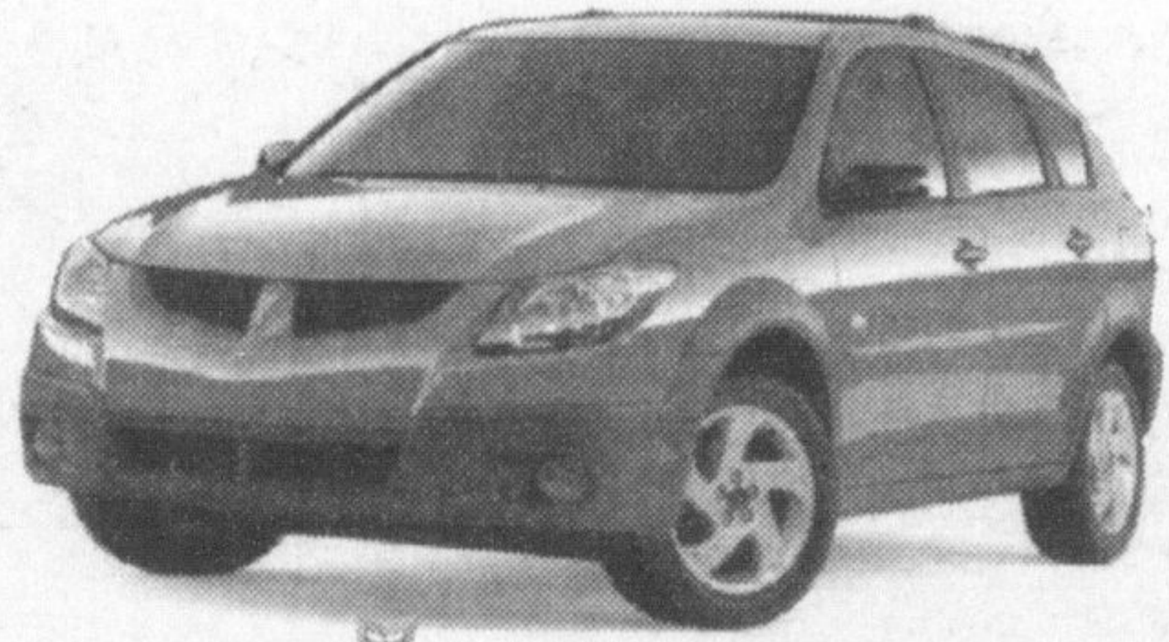
2004 Pontiac Vibe