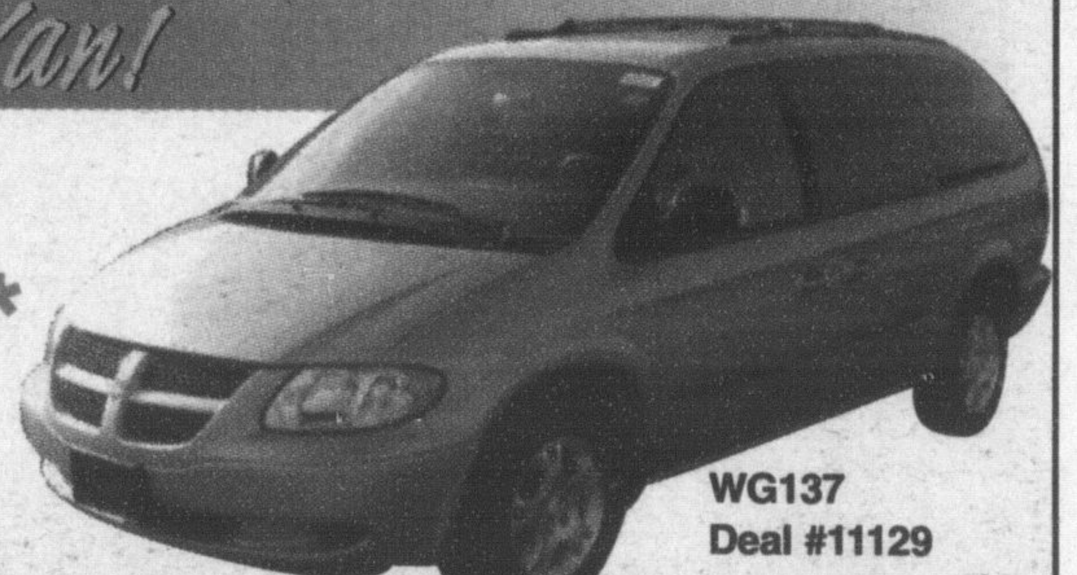
WG137 Deal #11129