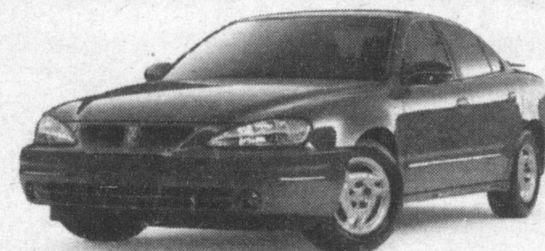
2003 PONTIAC GRAND AM

$4,600 OFF CASH PURCHASE PRICE OR $2,000 Finance Credit*