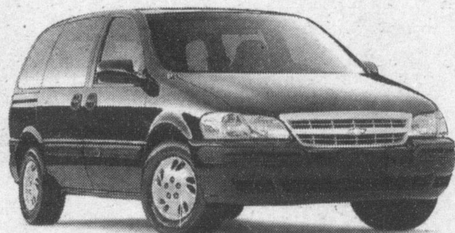
2003 CHEVROLET VENTURE

$6,500 OFF CASH PURCHASE PRICE OR $2,000 Finance Credit*