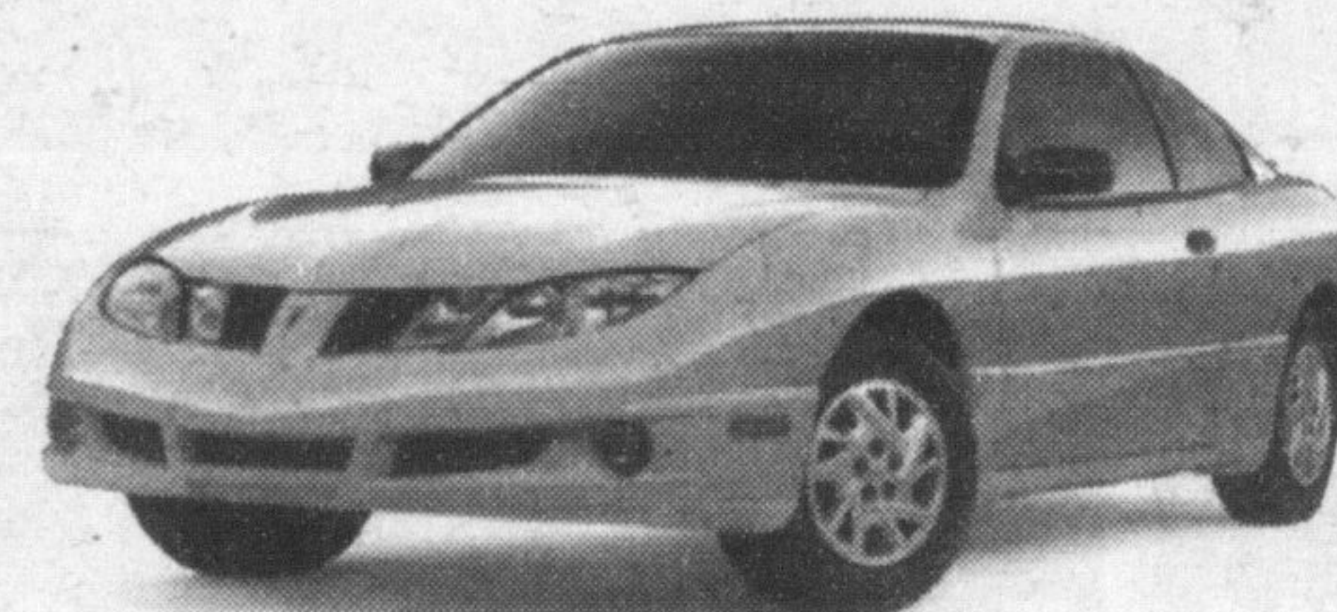
2003 PONTIAC SUNFIRE

$4,500 OFF CASH PURCHASE PRICE OR $2,000 Finance Credit*