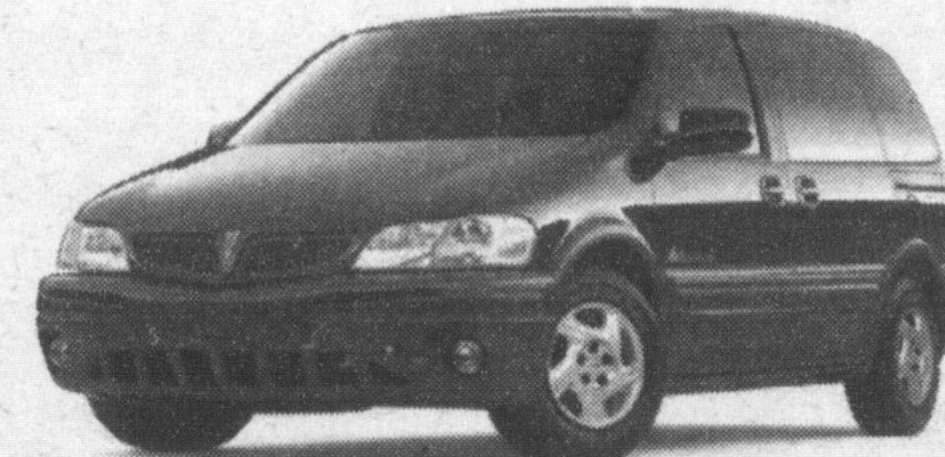
2003 PONTIAC MONTANA

$6,500 OFF CASH PURCHASE PRICE OR $2,000 Finance Credit*