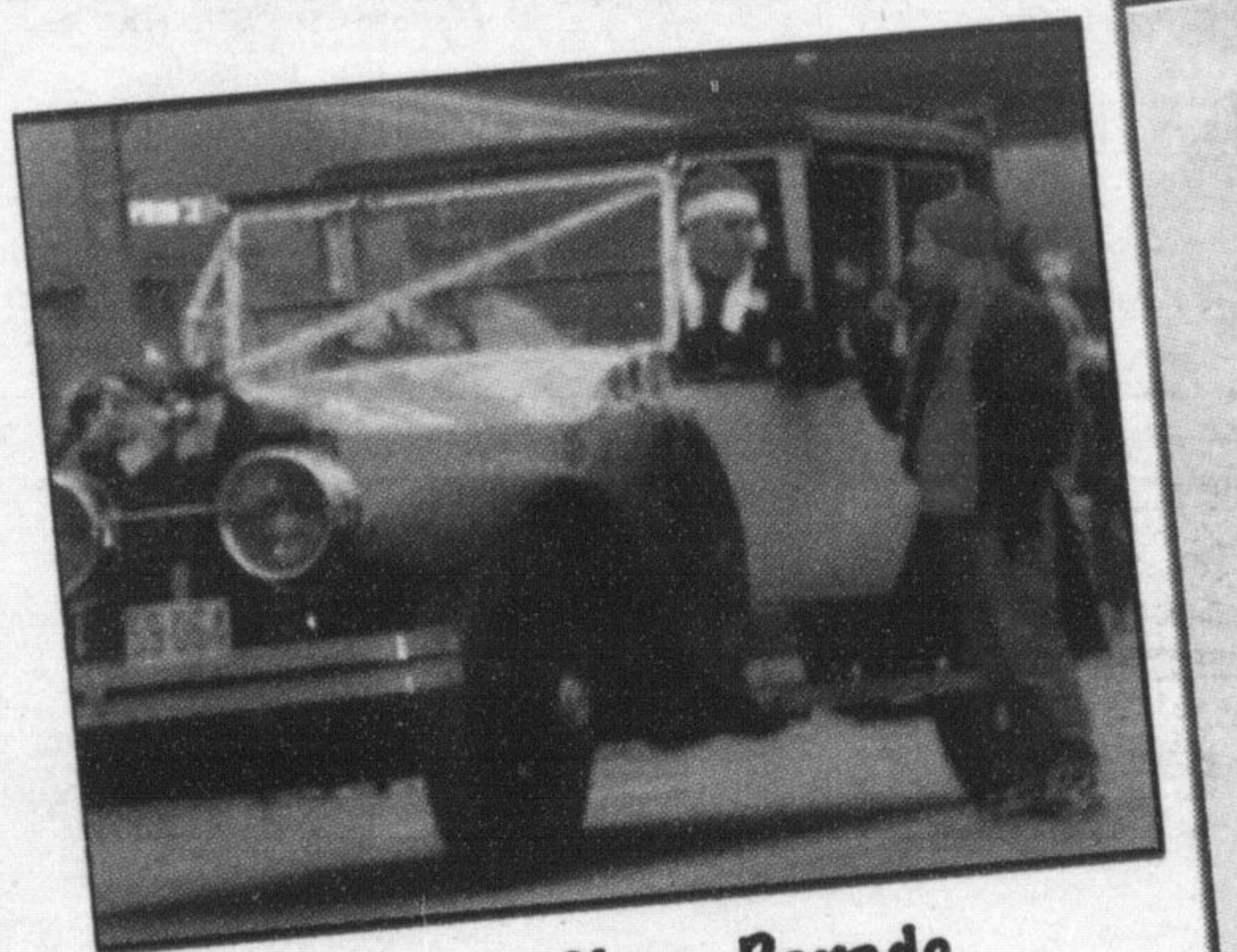
Santa Claus Parade 1998