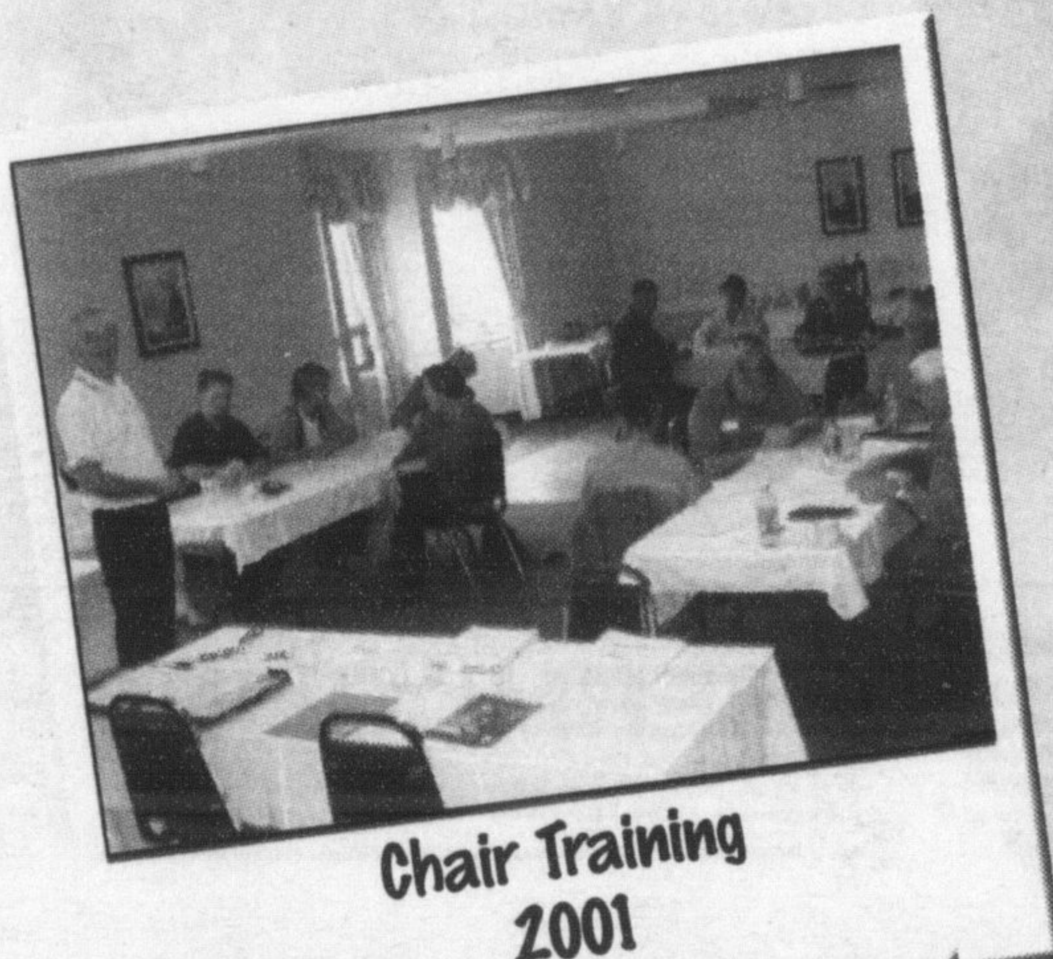
Chair Training 2001