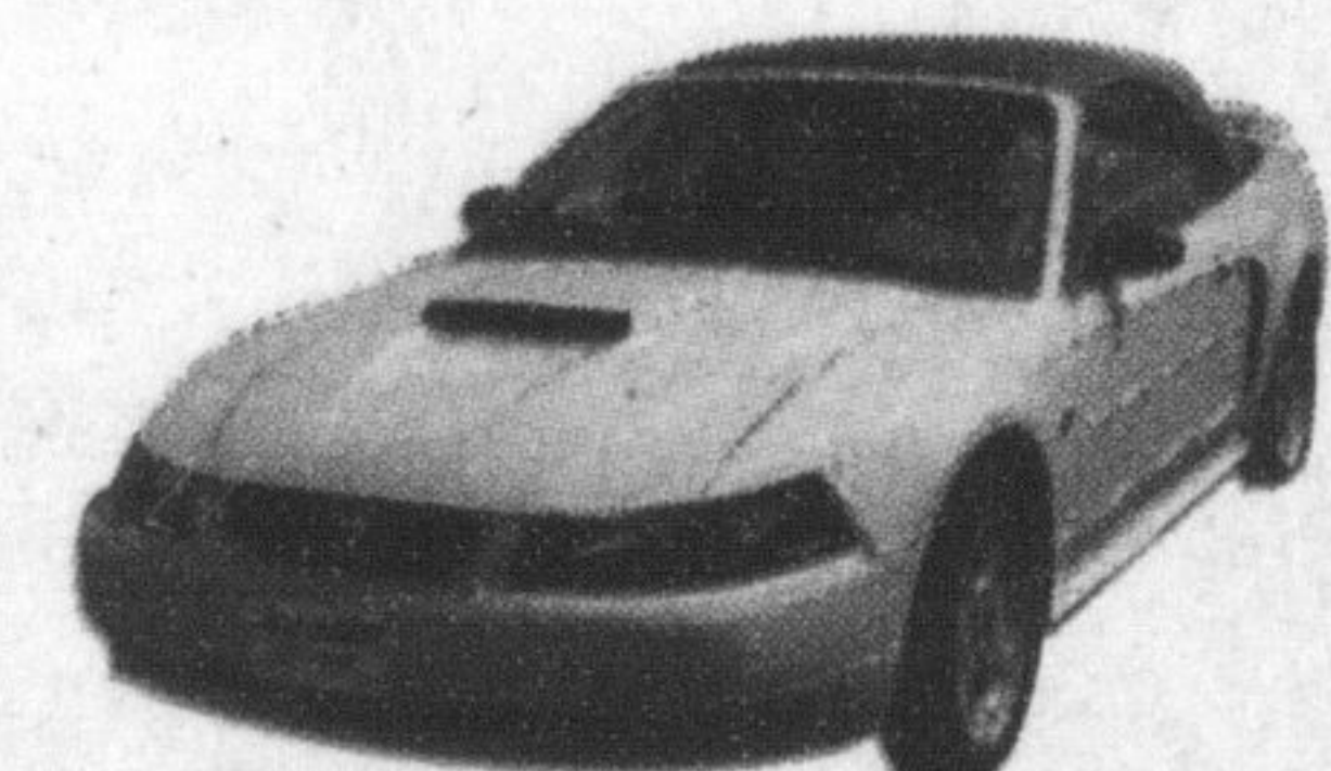
2003 FORD MUSTANG Mustang 2 dr Coupe M3008 Pony pkg, handler pkg. $21,999* Mustang 2 dr Convert. M3014 V6, sport pkg, leather $24,999* Mustang 2 dr Coupe M3015 V6, sport appear. handling pkg $21,999* Mustang GT Convert. M3016 Auto, leather, mach 1000 avoid $33,999* Mustang Convert. M3017 V6, sprt pkg $25,999* Mustang GT Mach 1 M3018 torn red M3020 Black $33,999* Mustang GT Coupe M3022 Blk, loaded $34,499*