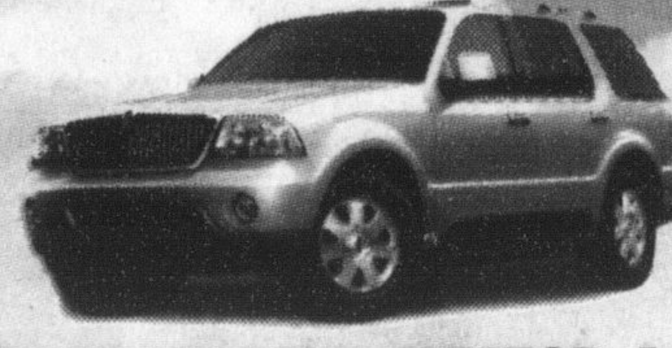
2003 LINCOLN AVIATOR 4 DR V3013 green, parchment leather $49,999*