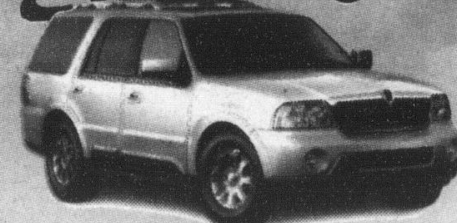
2003 LINCOLN NAVIGATOR 4X4 N3012 silver, blk leather $62,999*