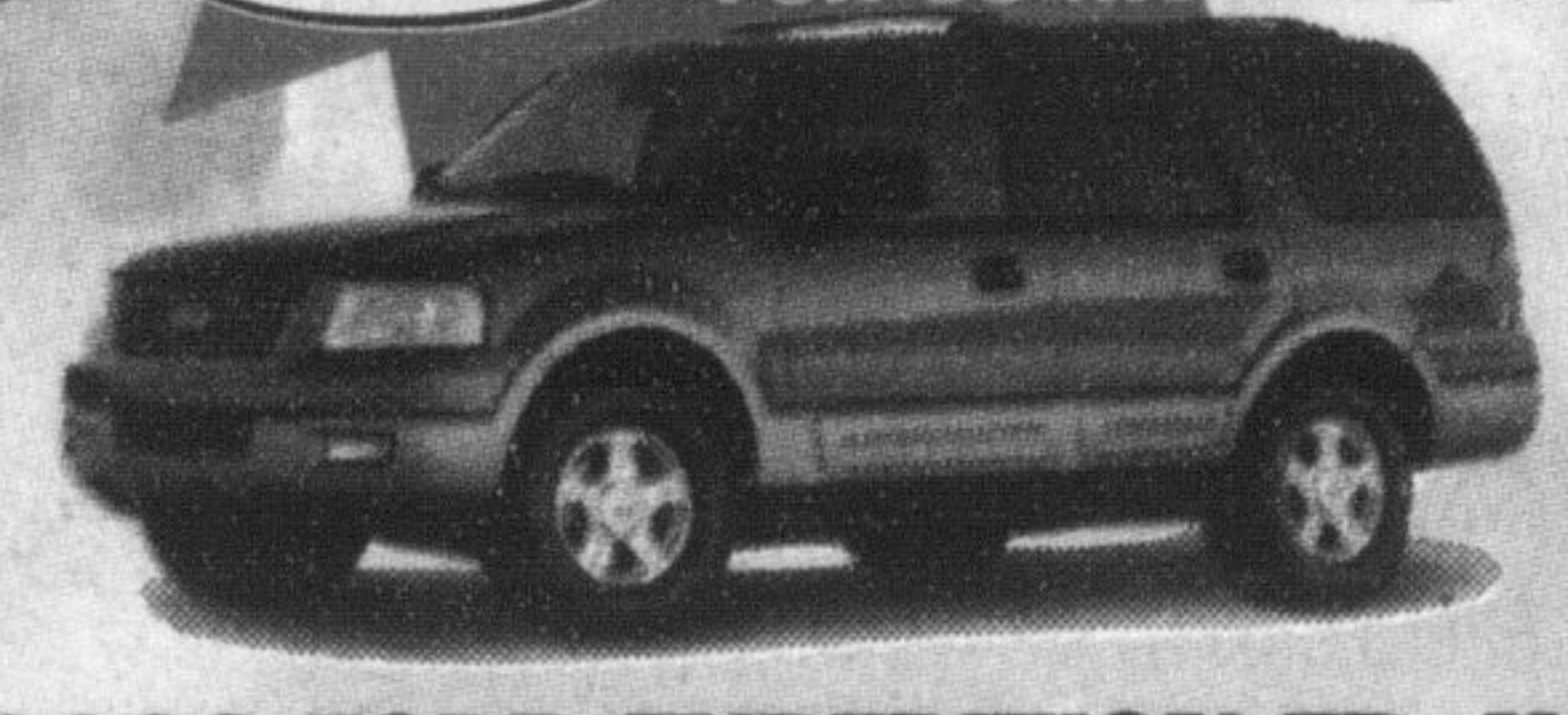
2003 FORD EXPEDITION EB 4X4 P3004 company car, loaded $43,999**