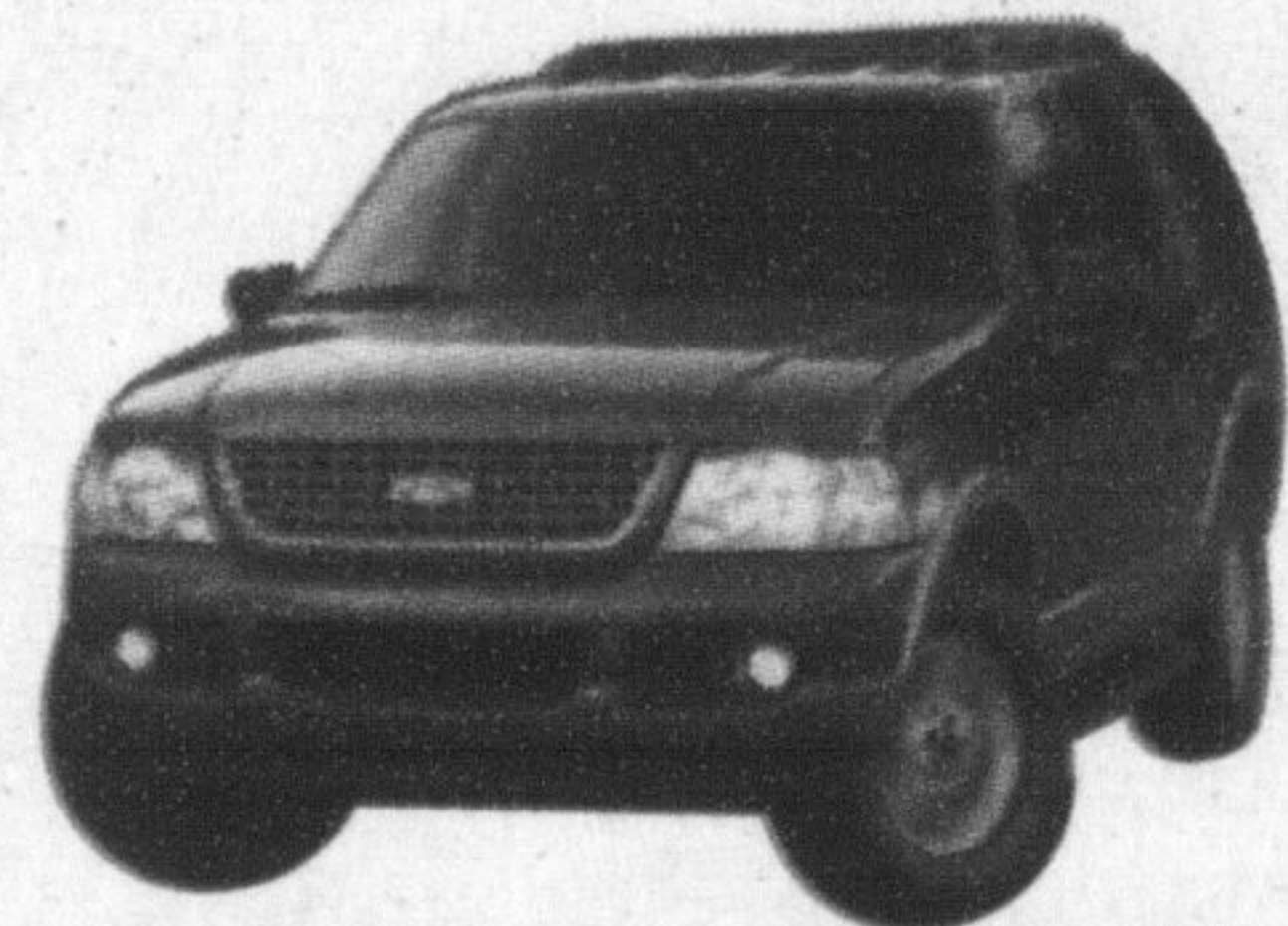
2003 FORD EXPLORER Explorer 4x4 Sport X3017 Red, moonroof $49,999* Explorer EB 4x4 X3017 red, safety croup, p.roof $27,999* Explorer XLT 4x4 X3049 Silver, mid grey cloth, trailer tow $34,999*