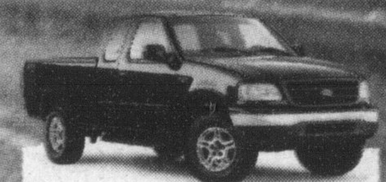
2003 F150 S/CAB LARIAT 4X4 F3034 trailer tow, two tone $38,499* F150 S/Cab 4x4 F3072 White, SLE, 5.4L $24,999*