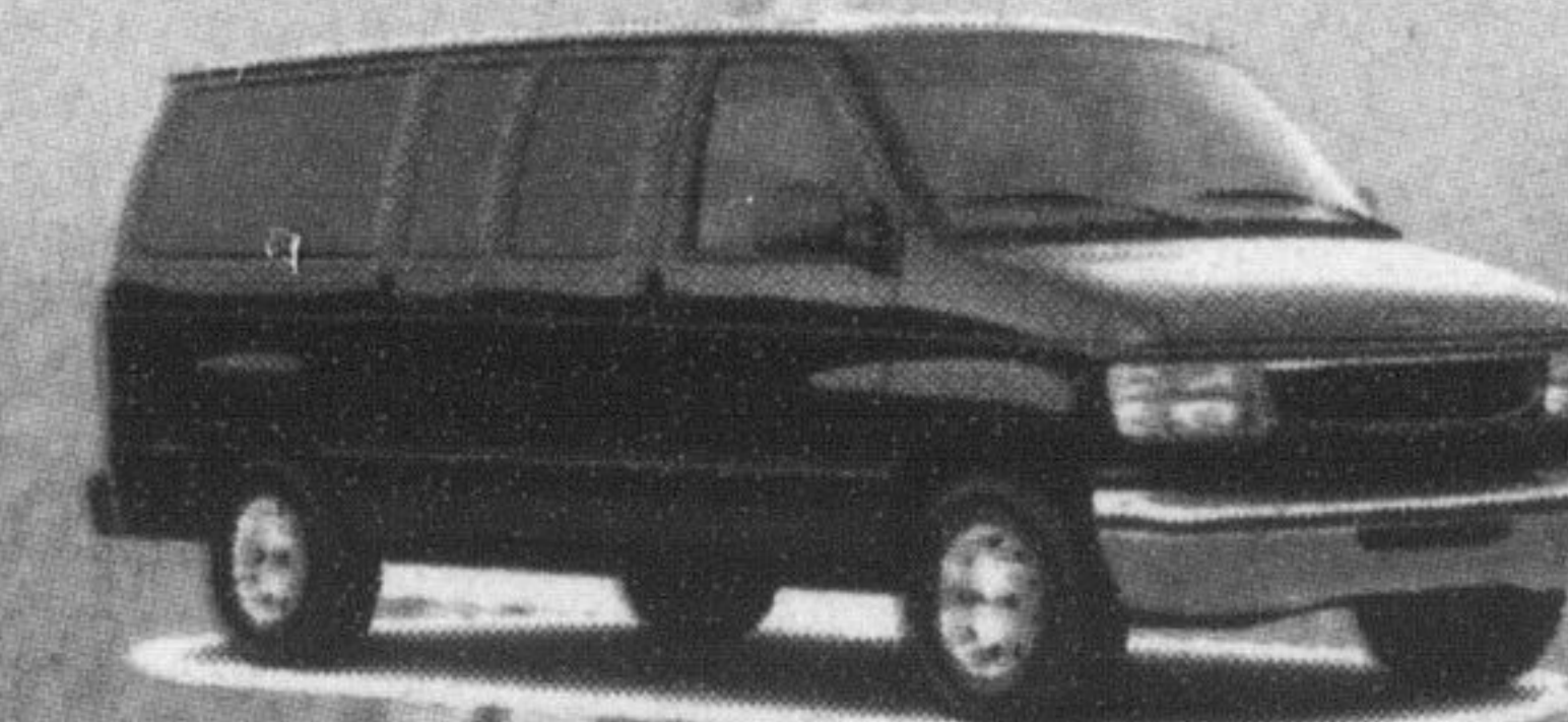
2003 E-SERIES CARGO VAN E3014 V6, auto, air $26,499*