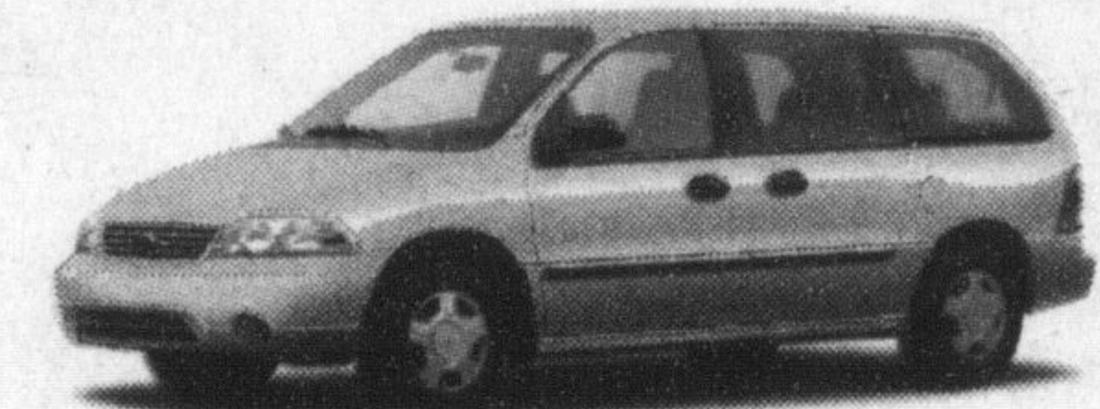
2003 WINDSTAR LX UTILITY W3040 Family security pkg, climate group $23,999* W3078 Spruce green $21,999* W3082 Tropic green $21,999*