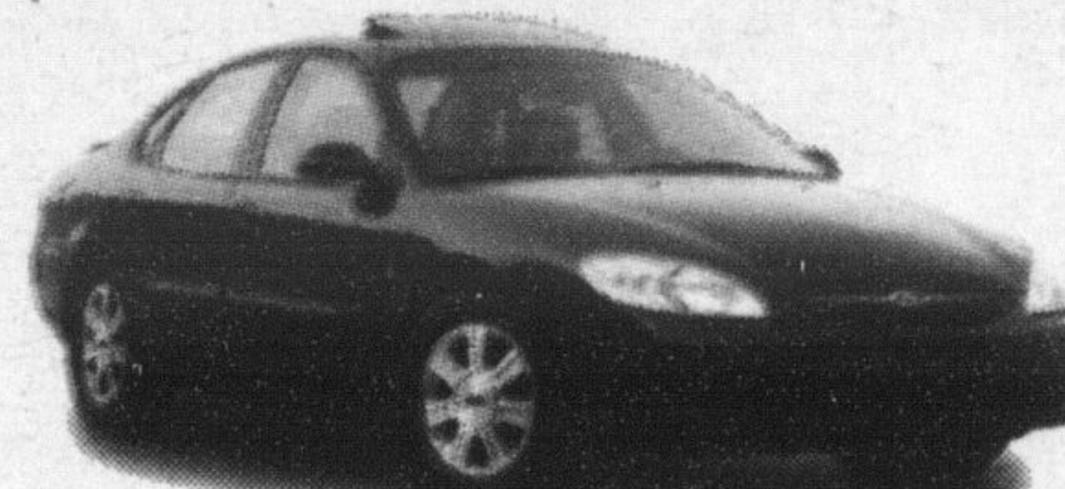
2003 FORD TAURUS 4 dr Sedan T3039 moonroof, spoiler $21,999* 4 dr Sedan T3043 blk, moonroof, spoiler $21,999* T3044 red, moonroof, spoiler $21,999* 4 dr Sedan T3042 3.0L 4V, spruce green, spoiler $23,699* Taurus SE 4 dr T3004 Company car, spoiler $19,999* Taurus SE 4 dr T3005 Company car $18,999*