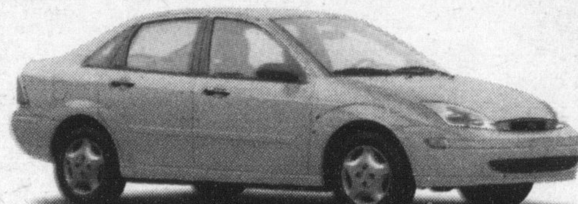
2003 FORD FOCUS A3017 Company car, red, low kms $16,399** A3022 Company car, wagon, sprt pkg, silver $16,598** 4 Dr Wagon A3084 Blk, auto $17,999* Focus ZTW 4 Dr A3113 Company car, p.moonroof, leather $19,799* Focus SE 4 Dr A3120 Silver, auto $14,999* Focus SE 4 dr A3122 Company car A3124 Company car, red, low kms $14,999* Focus ZX5 5 dr A3130 yellow, p.moonroof $18,999* Focus ZX5 5 dr A3130 Company car $18,999* Focus SE 4 dr A3130 arizona beige, auto $14,999* Focus SE 4 dr A3134 Silver, auto $14,999*